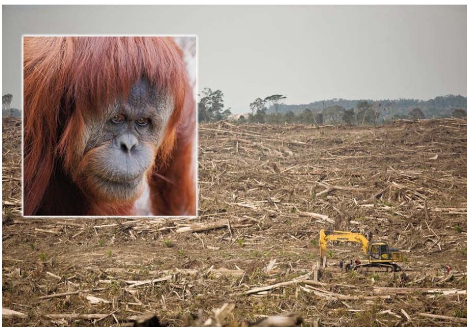
The explosion in palm oil use, largely to replace unhealthy trans fats in food, has wreaked havoc on tropical rainforest ecosystems across Southeast Asia, pushing some endangered species -- including orangutans like the one pictured here -- to the brink.

Given the potential negative impacts of so-much corn-based ethanol, the U.S. Environmental Protection Agency is reportedly weighing a proposal to cut the amount currently required by law to be blended into gasoline by 1.39 billion gallons. If the federal government decides to do this, it could lower U.S. carbon emissions by some three million tons—equivalent to taking 580,000 cars off the roads for a