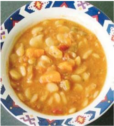
Lima Bean Soup

Heat oven to 450 degrees. Transfer beans to a wide, shallow pan and top with remaining tablespoon of paprika, cumin, black pepper, and a film of olive oil. Bake, uncovered, until sauce begins to boil, about 30 minutes, adding additional water, if necessary. For best flavor, serve warm not piping hot.