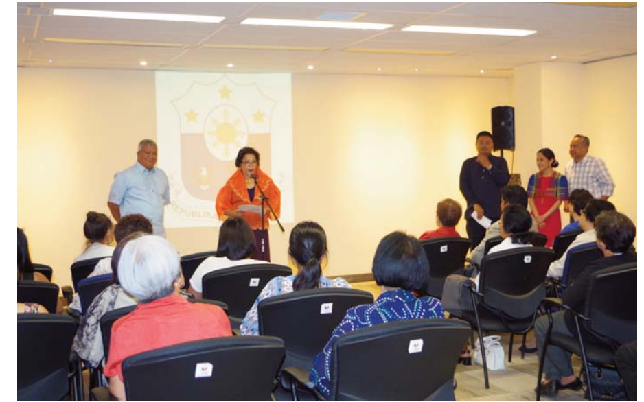
Photo shows the Ambassador delivering her speech while the other officers listen