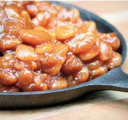
Barbecued Lima Beans