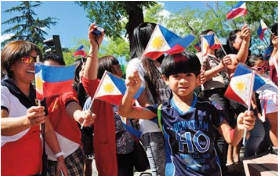
Filipinos in Madrid, Spain wave the Philippine flag as they await the arrival of President Benigno Aquino III on Sunday, September 14. Aquino is in Spain as part of a four-country European visit.

Economic Development Cluster will try to get more investments by explaining how conditions in manufacturing, information technology-business process outsourcing, and various projects under public-private partnerships have improved. Aquino also intends to convince European leaders how Philippine maritime conditions have become better and allay their fears of illegal, unreported, and unregulated fishing. During his European trip, the See Page 18 - European investments