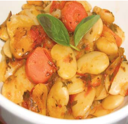
Baked Balcan Lima Beans

Meanwhile, saute bacon until crisp; drain on paper towels. Remove cover from lima beans. Arrange bacon over top. Bake uncovered, 10 minutes. Makes 8 servings.