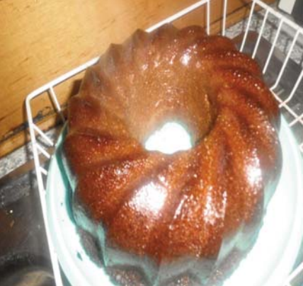
Lima Bean Cake

In the meantime, bring 4 cups of water to a boil. Add the vegetable bouillon to the boiling water, and stir until dissolved. Add broth to the sauteed vegetables and beans. Add remaining water, and allow soup to simmer over a low flame for 1 to 1 1/2 hours. Serve steaming hot.