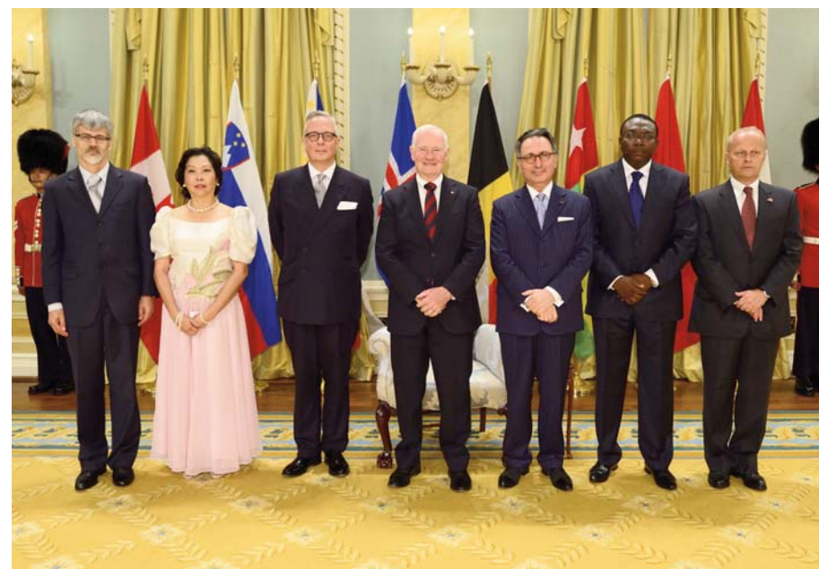
Governor General David Johnston (center) with newly accredited ambassadors of Slovenia, the Philippines, Iceland, Belgium, Togolese Republic and Swiss Confederation.