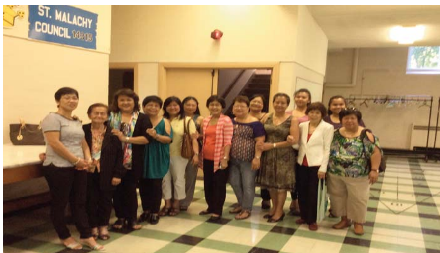
The Daughters of Isabella held a spaghetti lunch as a fund raising campaign for their charity work, held in the basement of St. Malachy's Church recently.