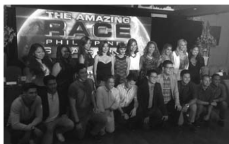
"The Amazing Race Season 2" contestants