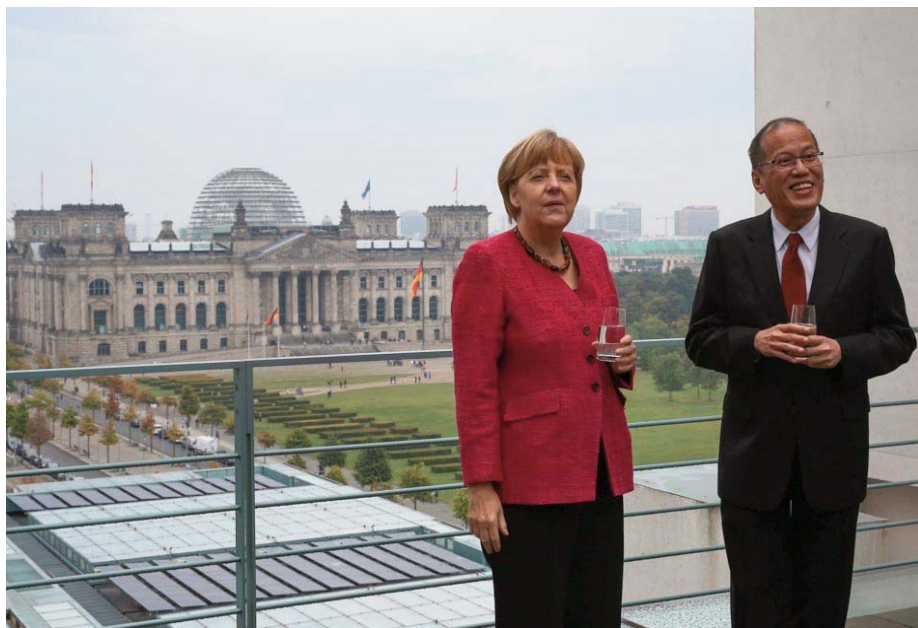
President Aquino converses with Federal Chancellor Angela Merkel on Friday at the Federal Chancellery, with the historical Reichstag building in the background, during his visit to Berlin, Germany. Aquino is in his last stop of his four-nation European tour before proceeding to New York.

He said the German government was assured that whatever the outcome of the arbitration, the Philippine government will abide by the court's