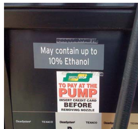
The federal government's push to increase production of corn-derived ethanol as a gasoline additive since 2007 has actually expanded our national carbon footprint and contributed to a range of other problems.

And while food scientists are working on other alternatives to trans fats that could be greener and healthier, none are as a cheap-to-produce and easy-to-process as palm oil, at least for applications requiring a food product