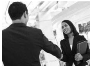
Certified International Trade Professional