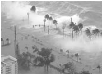
A storm surge caused by the confluence of high tide and strong winds from Typhoon Pedring sends waves of sea water over the embankment along Roxas Boulevard in Manila on September 27, 2011. The typhoon made landfall in Aurora province & caused devastation in Luzon.

At least 12 people were killed as typhoon "Pedring" whipped Luzon with heavy rains and forceful winds that wrought destruction, knocked out power and communication lines, paralyzed air, sea, and land transport, and caused a rare storm surge in Manila Bay.