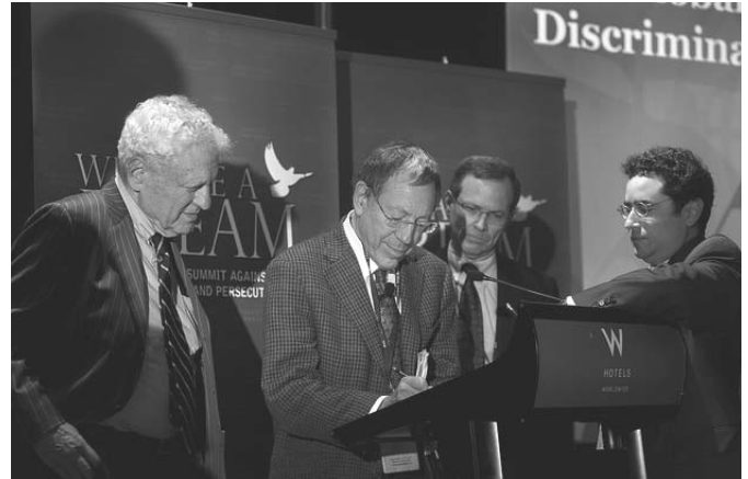
United Nations, New York, September 22, 2011

We, former prisoners of conscience, dissidents, victims of torture, persecution, and repression, fighters for freedom, democracy and the dignity of all human beings, gathered here at United Nations Headquarters in New York City, on 22 September 2011, do hereby declare: