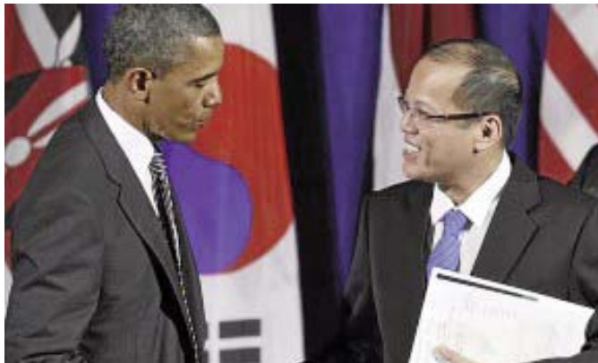
President Aquino listens intently to U.S. President Barack Obama as the two leaders meet on the sidelines of the Open Government Partnership event in New York on Tuesday prior to the UN General Assembly this week.

Aquino attributed the Filipinos' toppling of the late dictator Ferdinand Marcos in 1986 to their "collective yearning for what we are discussing today: open and accountable governance."