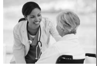
P.A.B./PSW Nursing Aide