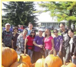
Gilmore College students, family and friends went to the apple orchard in Mont St. Gregoire to have a picnic after picking apples, Sunday, September 25, 2011