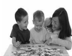
Early Childhood Education Assistant