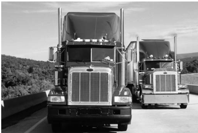
Freight shipments are responsible for about a quarter of all transportation-related greenhouse gas emissions. Heavy duty trucks are the biggest villains, accounting for 77.8 percent of freight transportation's total. Running mostly on diesel fuel, they are also major emitters of nitrogen oxides and particulate matter, which are linked to a wide range of human health problems.

Another leading conservation group, Defenders of Wildlife, details how a long list of other North American fauna is in decline as a result of global warming. The gray wolf, trout, salmon, arctic fox, desert bighorn sheep, desert