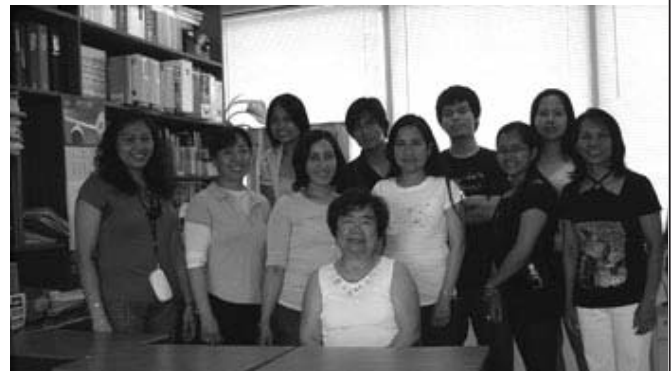
Sunday French Class