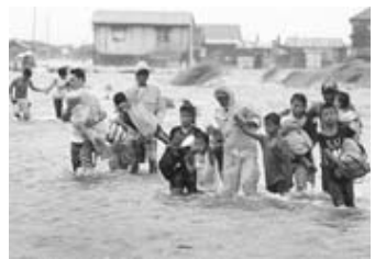
Pedring's Fury - Typhoon Pedring caused a storm surge and flooded many areas in Luzon and Metro Manila, forcing the evacuation of people from homes with many wading in hip deep waters to escape the deluge, damaging and leaving malls empty, stalling vehicles, and destroying shanties in coastal communities.

In Pampanga, rubber boats were deployed in low-lying areas of Arayat, Mexico, Sta. Ana, Candaba, San Luis, Minalin, San Simon, Apalit, Macabebe, Masantol, Sasmuan,