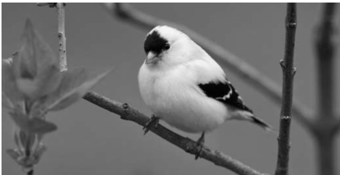
Climate change is affecting many more species than polar bears. The National Audubon Society found that 60 percent of the 305 avian species in North America during winter have shifted their ranges northward by an average of 35 miles, thanks to warming temperatures. The American Goldfinch, pictured here, has moved some 200 miles north in the last 40 years.

use of fossil fuel. Meanwhile, the Wildlife Conservation Society adds the Irrawaddy dolphin of Southeast Asia, the Arctic's musk ox, the ocean-going hawksbill turtle and others to the list of species that are "feeling the heat" from global warming.