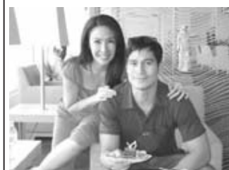
Piolo Pascual with Giselle Sanchez inside the Qatar First Class lounge

For weeks, Piolo Pascual has been mum about the status of his relationship with KC Conception.