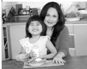
Judy Ann admits it's not easy to balance her career and family life

"I don't want her to go back and say na, 'Sana nagawa ko 'to sa career ko.' Malulungkot ka, eh. I want her to grow. Let her blossom..." ■