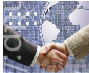
International Trade (C.I.T.P.)