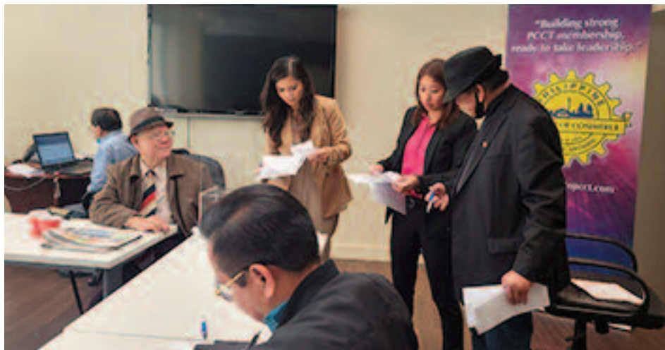
The PCCT Board of Directors Election while in process.