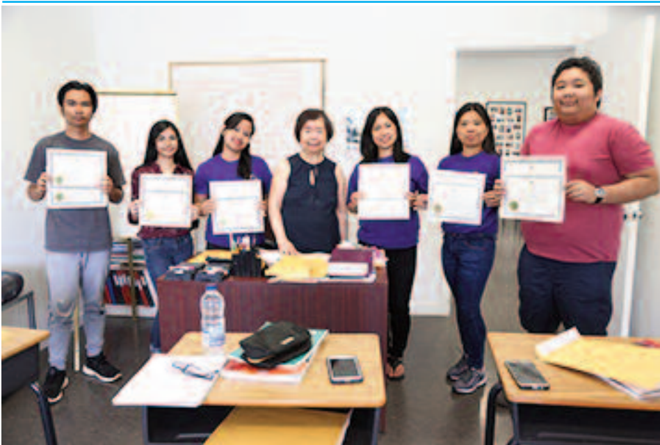
French class 2019 Levels 1 and 2 Proficiency Certificates presentation These students continued to complete level 3, but only 4 completed Level 4.