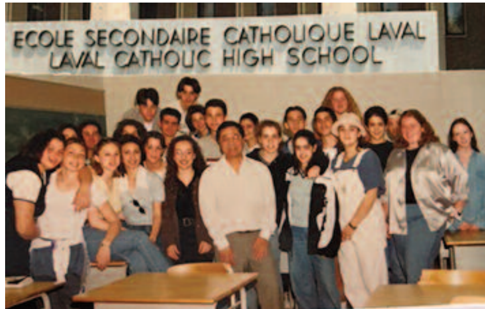
Religion class at the former Laval Catholic High School in Chomecey.

proudly happy as well to become a dual citizen of the USA and Canada. The transition, however, to teach in public schools had affected the dynamics of pedagogy, an adjustment that required a revisit of the principles of teaching, a redefining of goals and objectives, setting benchmarks and introducing technology as components.