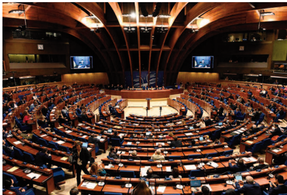
Ukrainian President Volodymyr Zelensky is seen on screen as he remotely addresses a speech to the members of the political delegations of the Parliamentary Assembly of the Council of Europe, in Strasbourg, France, on October 13.

"The continued use of long-range artillery by the Russian military to hit towns and cities across Ukraine has caused massive destruction and death," the resolution said. "With these indiscriminate attacks, Russia aims to advance its terrorist policy to suppress the will of Ukrainians to resist and defend their country and provoke maximum harm to civilians."