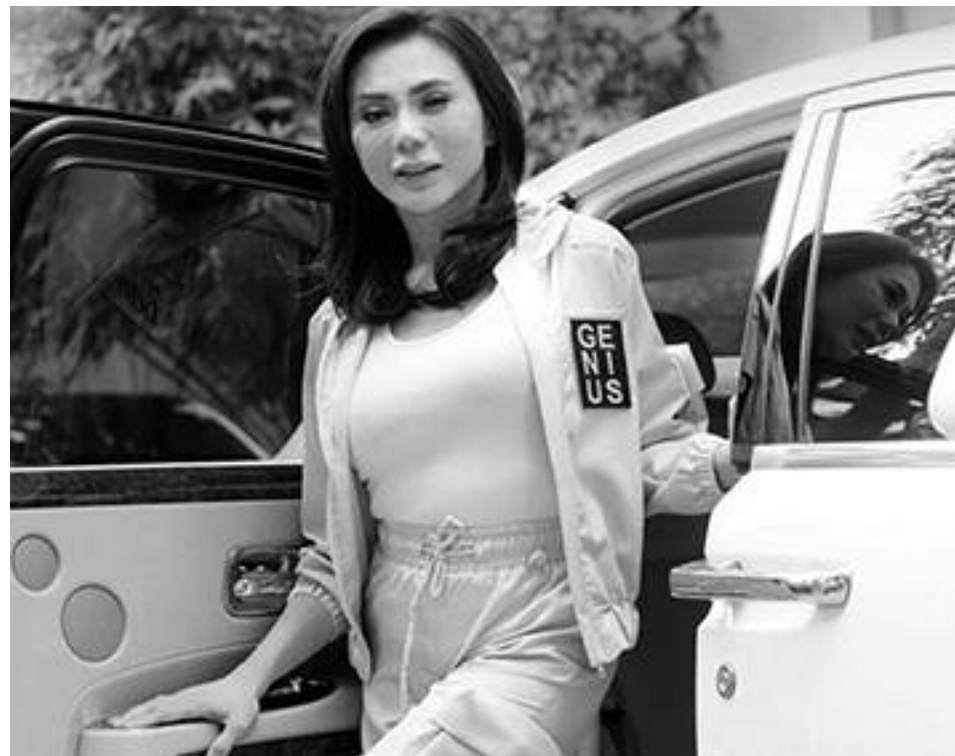
Celebrity cosmetic surgeon Dr. Vicki Belo

Celebrity doctor Vicki Belo revealed that she had stage 3 breast cancer in 2016.