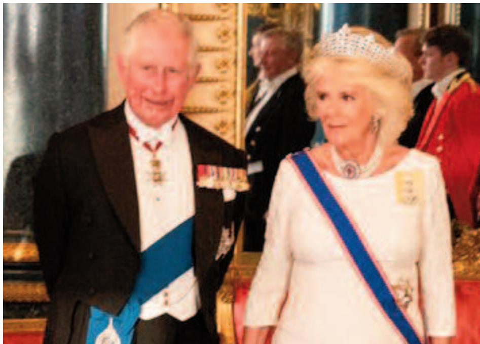
Charles and Camilla in 2019

The coronation of Charles III and his wife, Camilla, as king and queen of the United Kingdom and the other Commonwealth realms is set to take place on Saturday, 6 May 2023 at Westminster Abbey. It is meant to be the "symbolic high point" of his accession. King Charles III acceded to