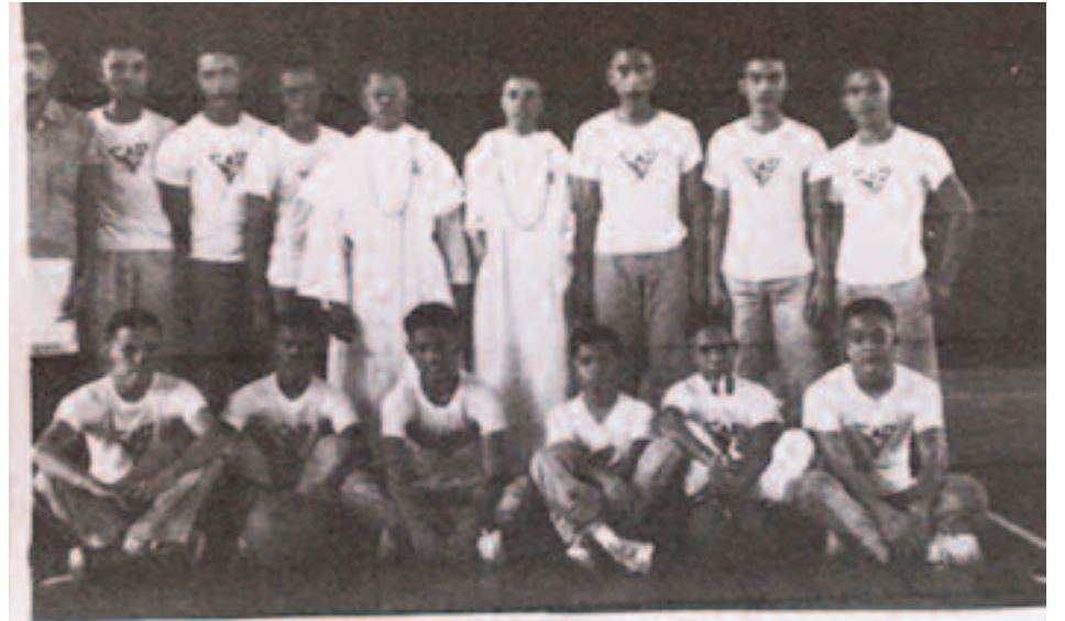
Basketball team of Colegio Apostolico Dominicano Postulants

My family was proud and happy that the sacrifices had paid off.