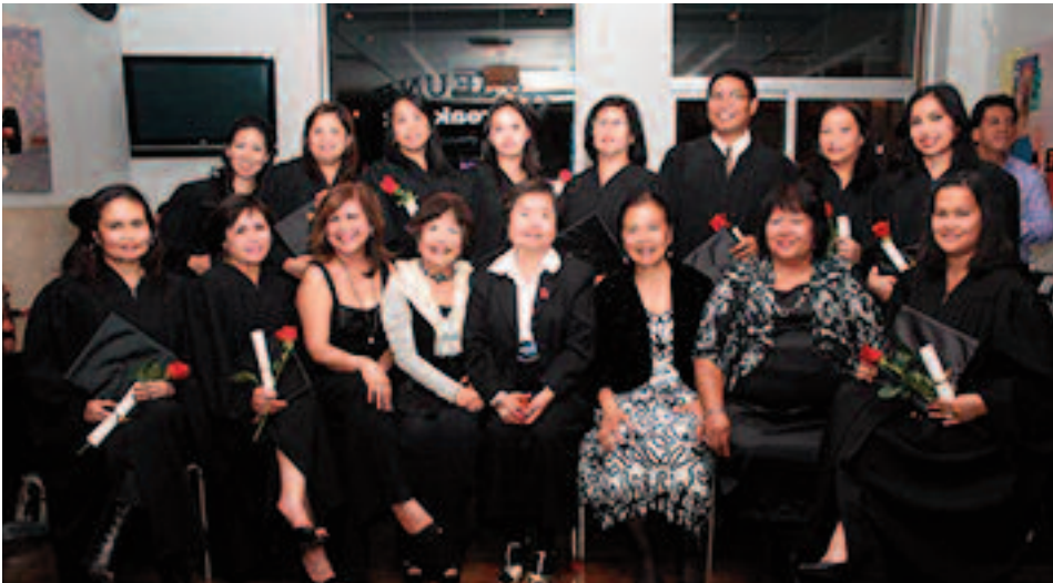
Graduation of PAB Batches 9 and 10, October 7, 2012 at La Cucina Restaurant, Sherbrooke West, Montreal