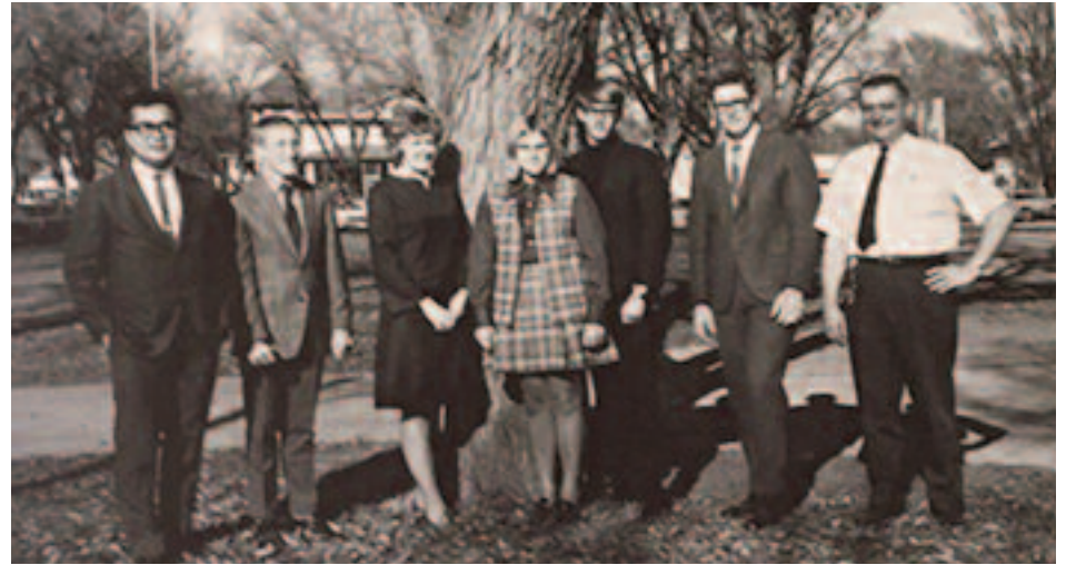
Student leaders with faculty advisers, Scotland, South Dakota, U.S.A.

The apprenticeship as an elementary teacher of Religion at San Beda College, now a university; and the educational experiences post monastic life as instructor of philosophy at San Sebastian College, Philippine Women's University and Spanish at the University of Manila had been my North American educational adventure. With 4 years in Manila, 22 in the USA and 27 in Canada, the 53 years of service to education had finally sealed the end of a career with a well-deserved retirement in Canada in 1997 and 2018 in the USA. I was