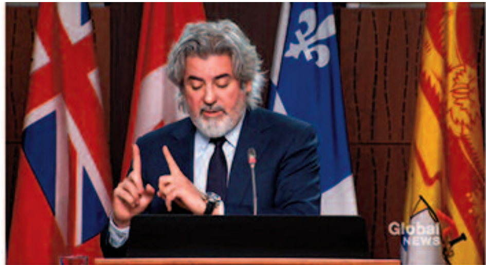
Liberals introduce bill that will force web giants to pay to reuse Canadian news content – Apr 5, 2022