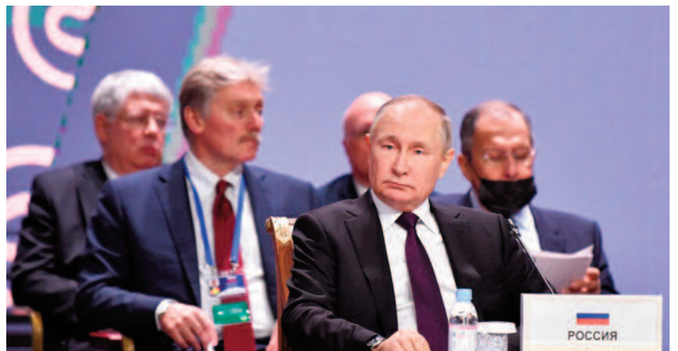
Russian President Vladimir Putin, flanked by Foreign Minister Sergei Lavrov and Kremlin spokesman Dmitry Peskov, attend the summit of leaders of the Commonwealth of Independent States (CIS) in Astana, Kazakhstan, on October 14

Earlier this month, Ukrainian President Volodymyr Zelensky signed a decree formally ruling out potential negotiations with Putin. It came in response to Putin's announcement that he would illegally annex four regions in Ukraine, in a move widely condemned by international leaders.#