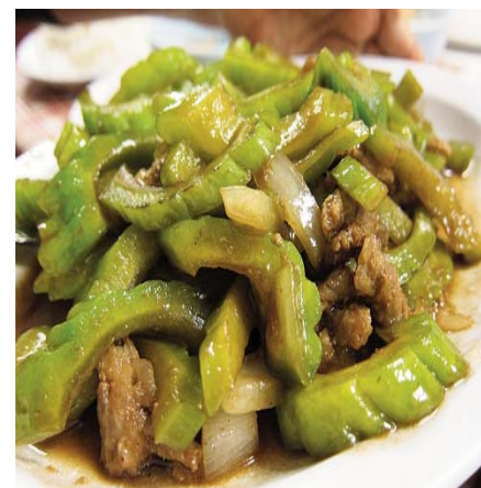
Sautéed Bitter Melon with Shrimp paste

In a deep pan cook the crab in water. Separate the meat and clean the shell. In a pan, add a small amount of cooking oil then saute' the garlic and onion. Add tomato, carrots and stir fry for minute. Remove from the pan and let it cool. In a mixing bowl, mix the potato, red pepper, crab mixture, salt, pepper and eggs. Add the spring onion and stuff the crab shell with crab mixture and set aside. In a deep frying pan add oil, bring heat to medium high, then deep fry stuffed crabs.