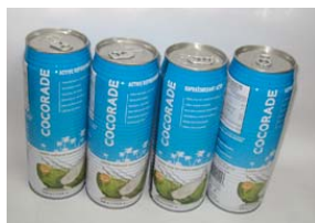
Cocomode coconut juice 520mL - 89¢