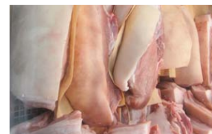
Pork Belly - $3.19 lb