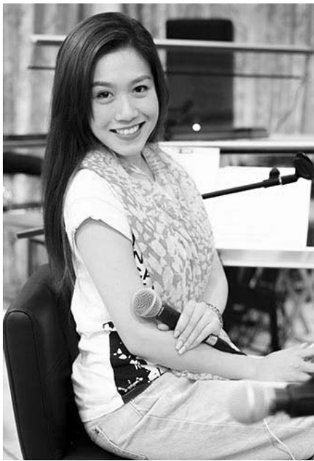
Rachelle Ann Go

She returned briefly to the Philippines a few days ago and made time to share with members of the press how different her life has been since conquering the West End with "Miss Saigon."