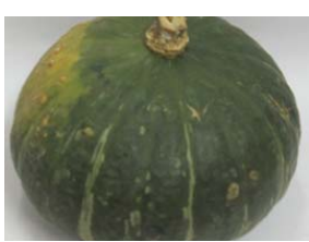
Squash - 59¢ lb