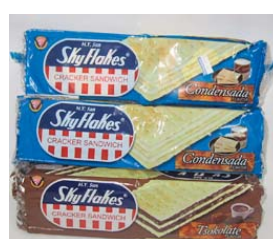
Skyflake sandwich $1.99