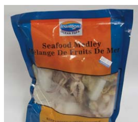
Aqua world seafood mix 240g - $1.49 pack