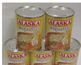
Alaska evaporated milk $1. each