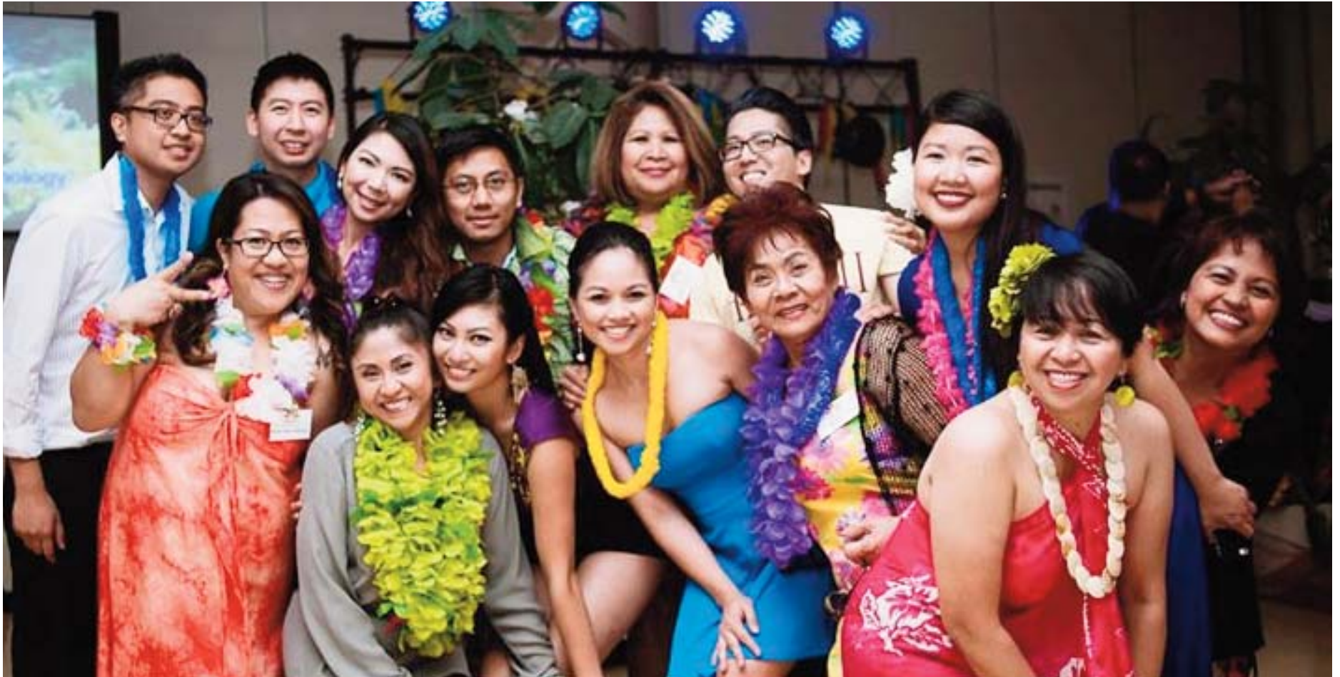
Guests and members of the MMTV crew seem to enjoy themselves as they pose for a colorful souvenir photo of the Hawaiian party held on October 10, 2014