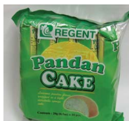
Regent cake all flavour $1.99 ea.