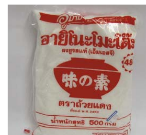
Ajinomoto 500 g - $1.99 ea.