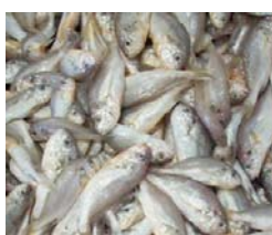
Silverfish 454 g - 2 for $5.00