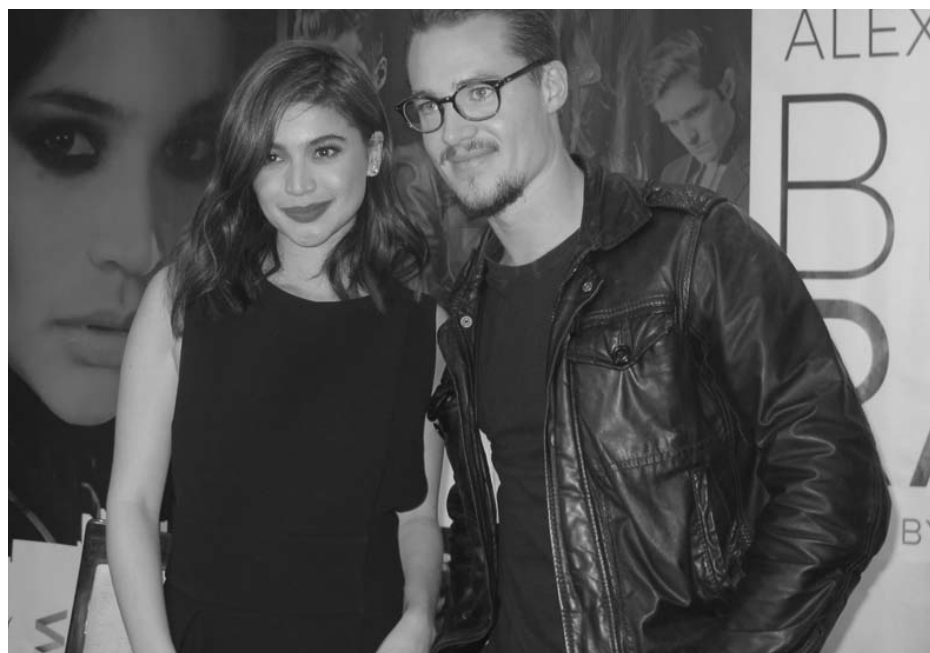
Anne Curtis and Alexander Dreymon

Anne Curtis knows there is still more to learn about filmmaking despite 18 long years in the business