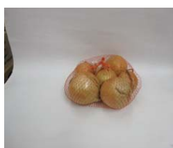
Onion - 2 lbs/ 59¢