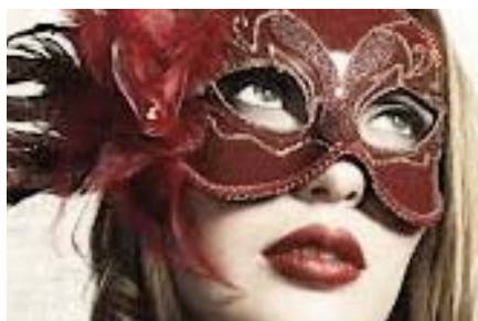
These masks are good examples of what you can wear to a masquerade ball

There are many good reasons to plan your funeral in advance... there are no good reasons not to!