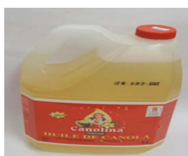
Candina canola oil 3 L $4.99