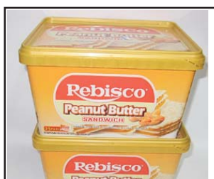
Rebisco peanut butter sandwich 850 g - $3.99