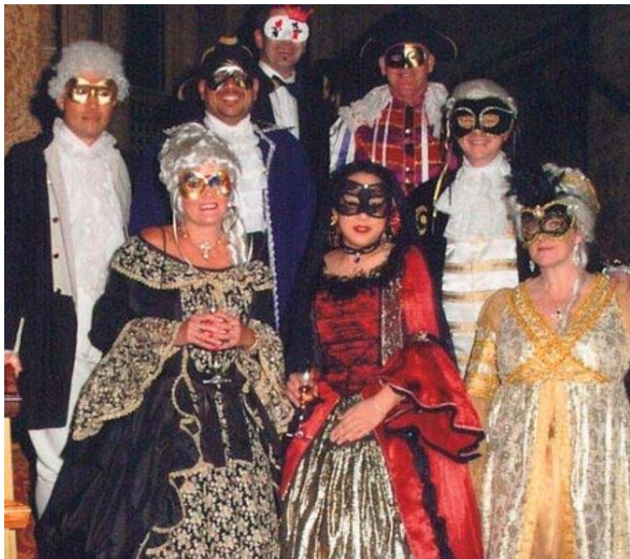
Masquerade ball costumes that you can wear to attend Gilmore College International's Silver Anniversary Dinner Dance Party, November 1, 2014 at the Hellenic