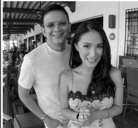
Senator Chiz Escudero and Heart Evangelista from the behind-the-scenes video of their magazine cover shoot

"Miss Saigon" tells the tragic tale of a young Vietnamese girl, orphaned by war, who falls in love with an American GI. It will run until April 2015 at the Prince Edward Theatre in London. ■