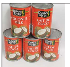
Dunn's Coconut Milk 400mL - $1 each