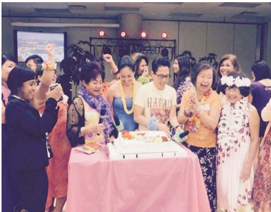
This is a candid shot of the TV crew enjoying the cutting of the anniversary cake.

You strengthen our resolve to move forward. You encourage us to