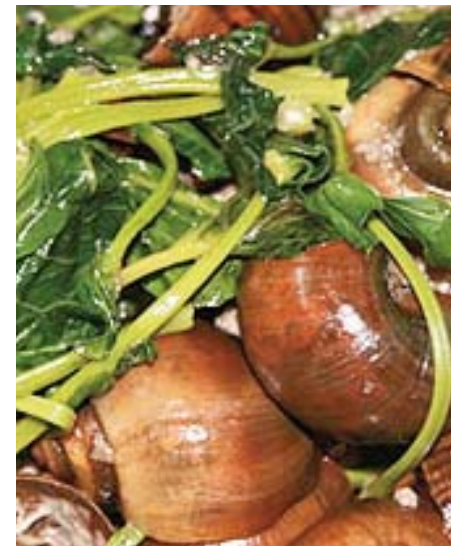
Guinataang Kuhl (Scargot with coconut milk)