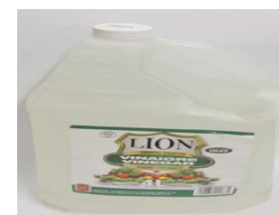
Lion Vinegar - 4L 0 $1.99