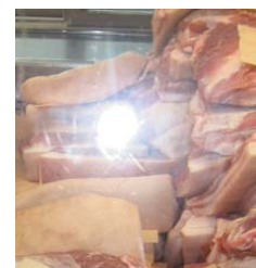
Pork Ham- $2.09 lb