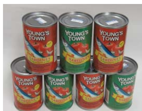
Young's Town sardines 155 g - 3/$2.