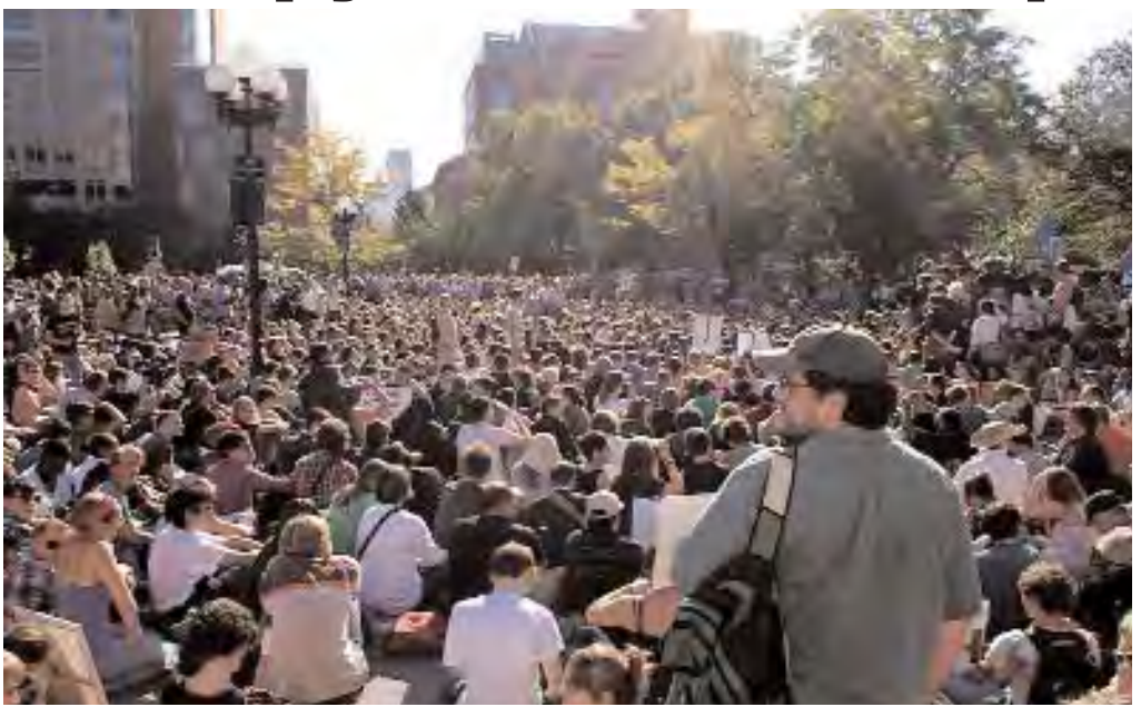
A general assembly of protestors held at Washington Square Park, October 9, 2011