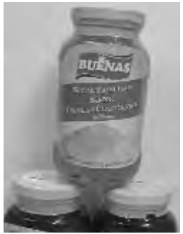
Buenas Kaong $1.59 / jar or 2/$3.00