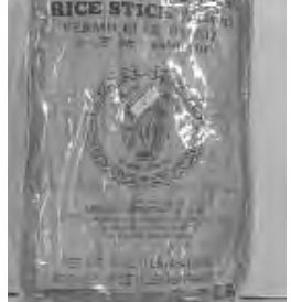
Elephant Rice Sticks (S) or (M) 99¢ / pack