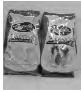
Magnolia powdered drink (all flavors) 500 g 2 / $5.00