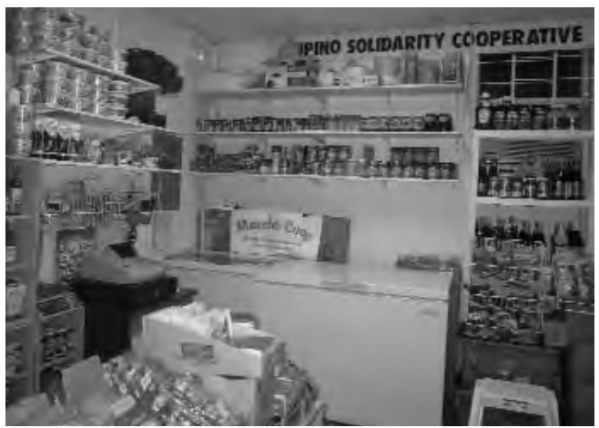
A partial view of the new Marché Coop located under the same roof as Gilmore College International on 5320-A Queen Mary Road

We have almost finished moving the Marché Coop to its new location but we have to leave behind some office furniture that we cannot accommodate in our new office. We hope to sell them off to any interested buyer and no reasonable offer will be refused. We still have a set of class computer table with a matching desk and bookshelf that can be sold for $250. and an airconditioner, hardly used, 6000BTU for $180, and a big wooden table with drawers and bottom shelf, originally made to be used for chopping "lechon". This can be sold at any reasonable price to someone who can use it. At the moment, they are still in the basement of Cuisine de Manille Restaurant on 5710 Victoria Avenue.