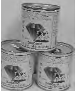
Diamond condensed milk $1.99 / can