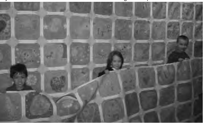
Three children showing their artwork which have been assembled into a big guilt for display

"The project fosters love and understanding among all children regardless of cultural backgrounds," said Loftus. "But it gives them satisfaction and more motivation in their work. It creates awareness and friendship with one another as they work together. Special needs students