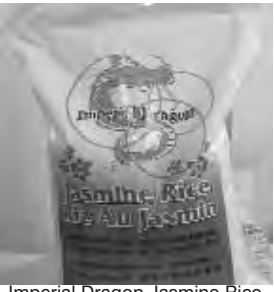
Imperial Dragon Jasmine Rice 8 kgs - $12.99 / bag