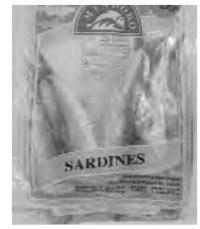
Sardines 2 / $3.00