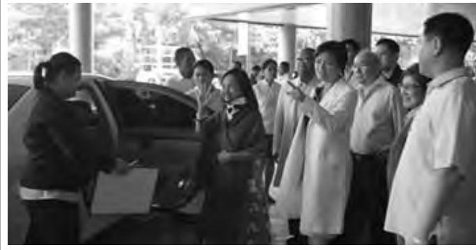
Gloria Arroyo puts on a brave face exiting a non-descript clinic surrounded by her physicians on Oct 18, 2011

"Sensitive issue iyan, kasi what if hindi kami maniwala that her condition is serious enough to warrant medical