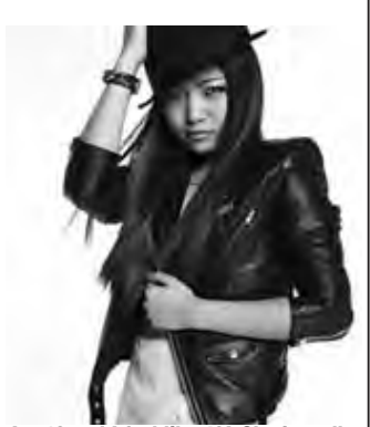
'I'm 19 and I feel like 40!' Charice tells Rolling Stone Japan

"I prepared with a little makeup and [wore] a skirt. They didn't remember me and [after I sang] they were like, 'You're so great! You're in!' I was like, 'Wow, you don't remember me. You told me I can't be in your contest just 'coz I don't have the looks.' She just looked at me like she was just