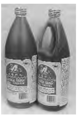
Silver Swan Soy Sauce 1 L $1.69 / bottle