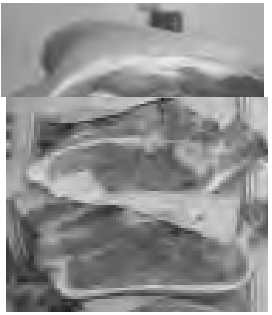
Picnic Pork $1.09 / lb