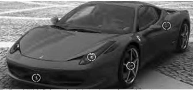
The Ferrari 458 Italia is a seriously fast and expensive exotic sports car