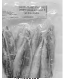
Galunggong 8 to 12 pcs. $2.99 /pack