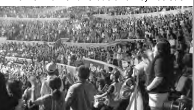
About 13,000 people attended the first year anniversary of evening variety show "Wil Time Bigtime" at the Smart-Araneta dome.

Willie Revillame runs out of time, not cash