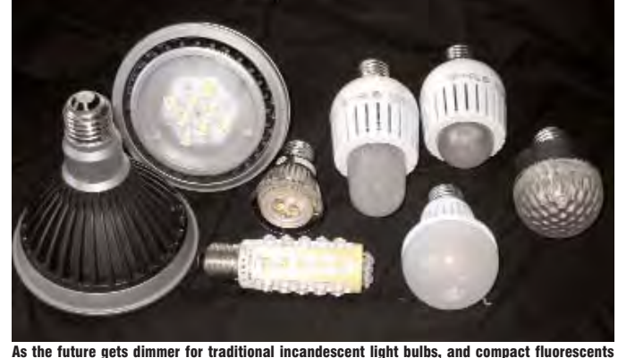
As the future gets dimmer for traditional incandescent light bulbs, and compact fluorescents (CFLs) fall out of favor due to their toxic mercury component, light-emitting diodes, or LEDs, are beginning to come on strong. LEDs, which are clusters of small bulbs that come in many shapes and sizes, last five times longer than CFLs and 40 times longer than incandescents and use much less energy. (Geoffrey Landis, Wikipedia)

The EPA is encouraging drycleaners to make the switch to greener solvents through cooperative partnership with the professional garment and textile care industry. The agency's Design for the Environment Garment and Textile Care Partnership recognizes the wet process cleaning 20 "an environmentally preferable technology that is effective at cleaning garments.'