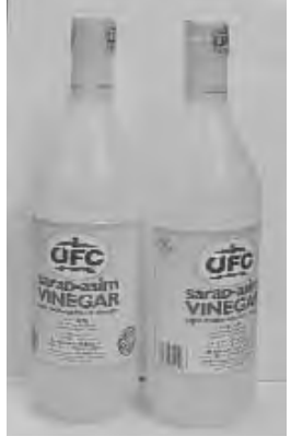
UFC Vinegar 99¢/bottle