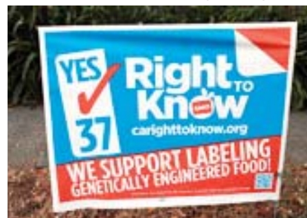
Twenty-one countries and the European Union have instituted policies requiring foods created using genetic engineering (GE) be labeled accordingly so consumers can know what they're putting into their mouths. Pictured: A California campaign (defeated in 2012) demanding labeling of GE foods.

Whole Foods, for one, is working toward full disclosure via labeling in regard to