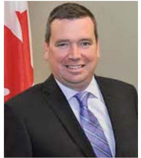
Hon. Christian Paradis, Minister of International Development & La Francophonie

"In honour of Universal Children's Day and the 25th anniversary of the United Nations Convention on the Rights of the Child, I want to reaffirm Canada's commitment to promoting and protecting the rights of children around the world," said Minister Paradis. "I would also like to encourage all Canadians to get involved in their schools, communities and places of work to raise awareness about children's rights. Together, we can help all children be healthy, go to school, and secure the kind of present and future they deserve." Twenty-five years ago, Canada played an instrumental role in negotiating the United Nations Convention on the Rights of the Child. Canada has continued to champion children's rights and child protection ever since. As the most vulnerable members of society, children have a right to safe and secure environments in which to grow, learn, and play. Without addressing protection