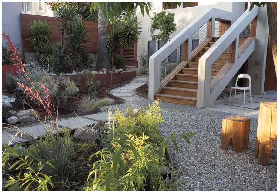
Using "greywater" from sinks, showers and washing machines to irrigate outdoor gardens is a great way to increase the productivity of backyard ecosystems while reducing household water use by as much as 30 percent. Pictured: A backyard garden watered with residential greywater.

A more comprehensive system can draw wastewater from sinks, showers and tubs, too—and then filter and distribute it to backyard landscaping via a drip irrigation network. Getting such a system professionally installed can run upwards of $5,000.