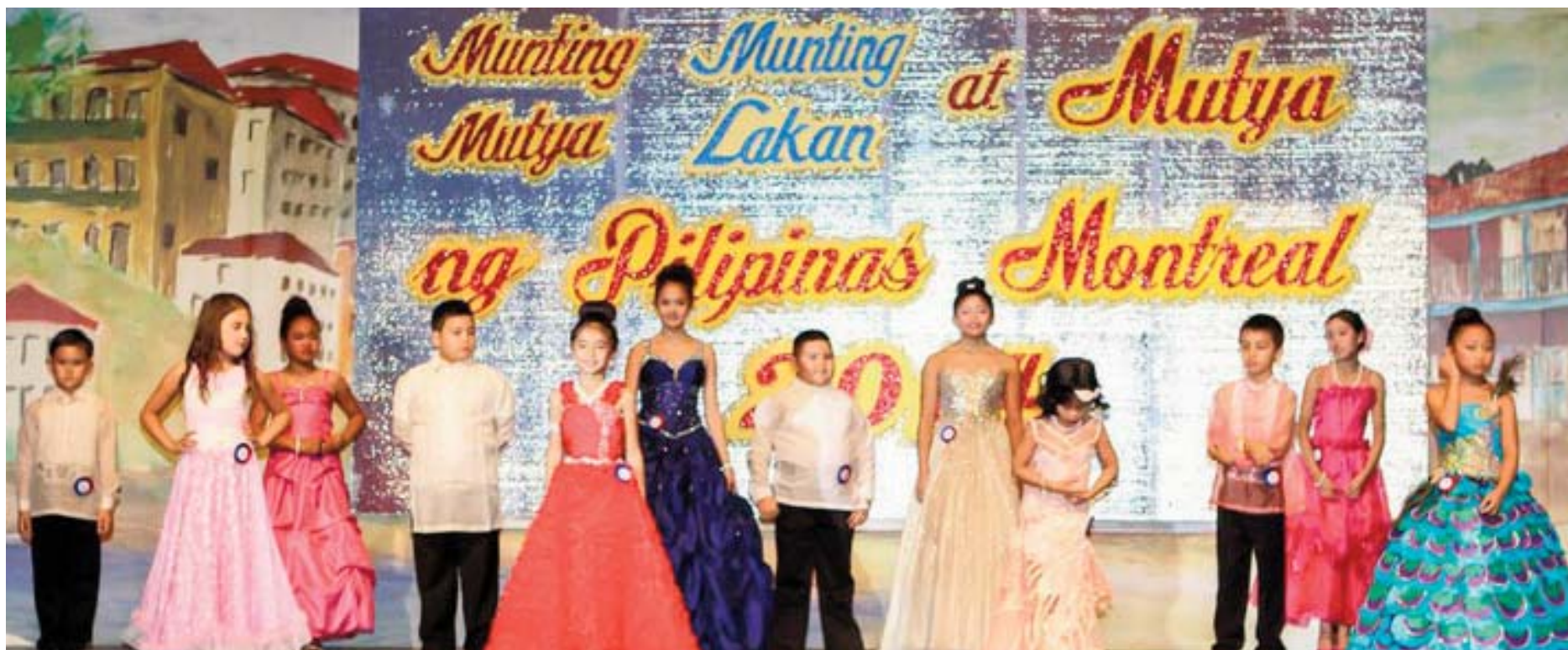
Twelve young candidates for Munting Mutya and Munting Lakan are presented in their evening attire during the pageant held on October 14, 2014, Hellenic Centre.