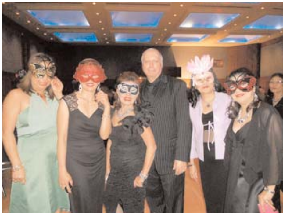
All dressed up in masquerade costumes, these guests seem to be enjoying the party in elegant style during the Silver Anniversary Celebration of Gilmore College