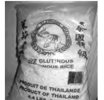
Glutinous Rice $3.99

jump through extra federal bureaucratic hoops could create challenges for patient care.