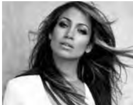
Jennifer Lopez enjoyed resurgence in popularity when she became a judge on US talent search 'American Idol'

International singer Jennifer Lopez has brightened up the day of one of her Filipino fans by mentioning his name during a radio broadcast abroad.