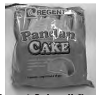
Regent Cake all flavors $1.99 each