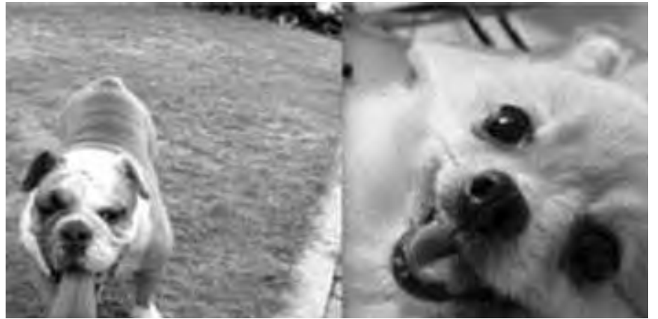
Friend posts photos of Derek's pets on Twitter

Hunk actor Derek Ramsay has turned to Twitter to ask for help in finding his two dogs.