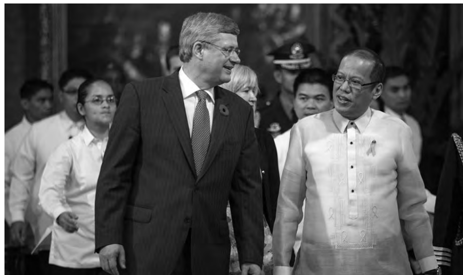
Prime Minister Stephen Harper being welcomed by Philippine President Benigno Aquino III

2012, Prime Minister Stephen Harper announced support of $15.5 million over four years, starting in 2013 and ending in 2016, for a project that will promote economic growth and employment in the Philippines.