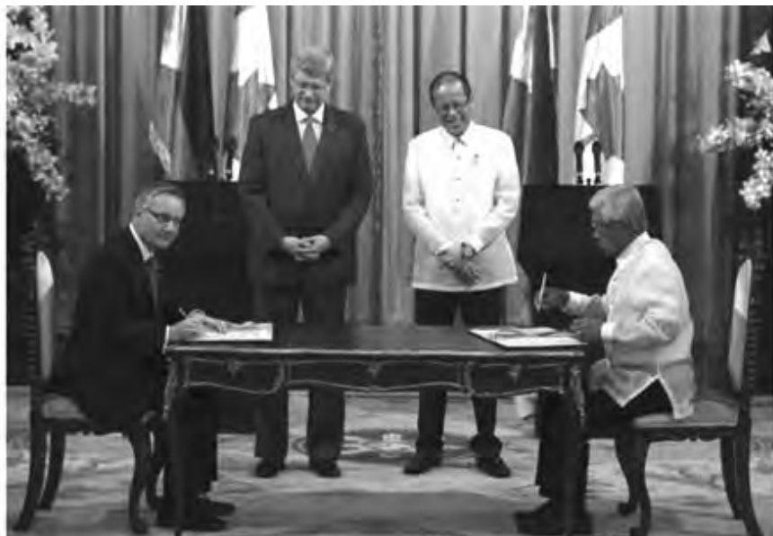
Visiting Canadian Prime Minister Stephen Harper, second from left, and Philippine President Benigno Aquino III, second from right, witness the signing of documents by Canadian Minister for International Trade Ed Fast, left, and Philippine Defense Secretary Voltaire Gazmin, in a ceremony Saturday, Nov. 10, 2012 at Malacanang Palace grounds in Manila, Philippines. The signed documents involves the transaction in defense and military-related equipment by Canada to the Philippines. It was the first visit by a Canadian head of state in 15 years which was aimed at strengthening relations between the two countries. Canada is home to hundreds of thousands of Filipino immigrants.

The project builds on the achievements of the Government of Canada's Support to the Implementation of the Convention on the Elimination of All Forms of Discrimination Against Women (CEDAW) initiative in Southeast Asia (2004-2009). Also implemented by UN Women (formerly UNIFEM), it successfully raised awareness among governments and civil society on the UN CEDAW obligations, and supported major legislative reforms on domestic violence and laws protecting