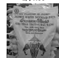
Elephant Jasmine Rice 8 kg $12.99