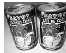
Savoy coconut cream - $1.49