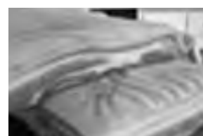
Pork Belly $2.25 lb