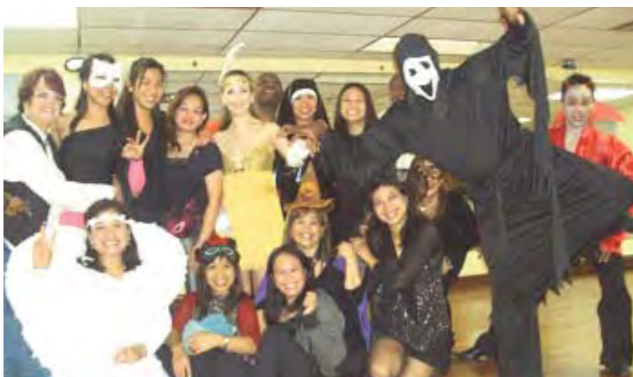
Halloween Party of Edouard Dance Studio, Friday, October 26, 2012.