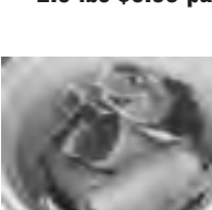
Pork Hock $1.09 lb