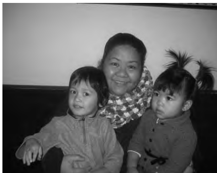
Si Pichu at Pechay kasama ng Lola

Pechay: Bayaan mo, Peras, mabilis ang takbo ng panahon at aabot ka rin sa klase namin. Sabay-sabay tayong tatlo papasok.