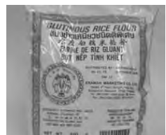
El Glutinous Rice Flour 400 g 89¢ each