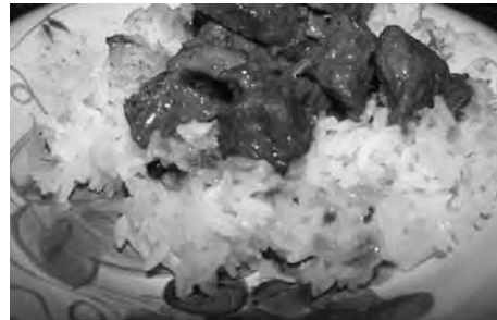
Filipino Beef Adobo with Coconut Milk

In a saucepan, brown pork pata in oil, then add the garlic, onion, and tomatoes. Stir fry for 3 minutes, then add the broth to cover, soy sauce, and sugar. Cover and simmer until the pork is tender. When little sauce is left, add the tomato sauce. Simmer for few minutes until sauce thickens. Season with salt, pepper, and oyster sauce to taste. Drop the banana blossoms and star anise. Cook until done are done and serve.