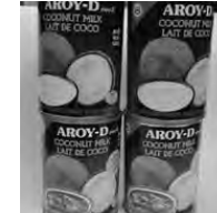
Aroy-D Coconut Milk 560 mL $1.99