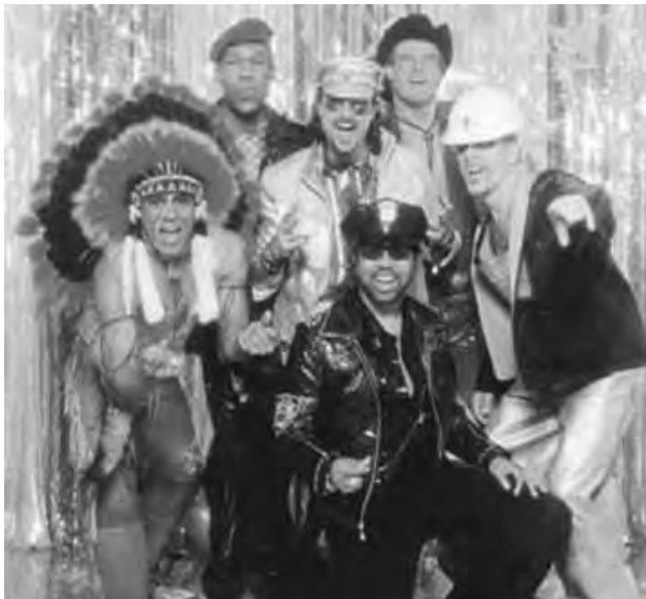
The Village People

Beginning their 35th year as the "kings of disco," Village People performs on Nov. 17 at SMX Convention Center.