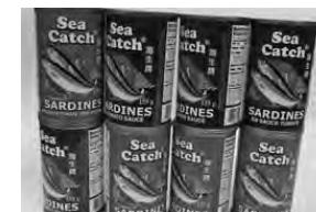
Seacatch Sardines 3/$2.00