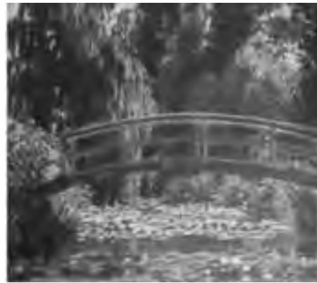
Monet's water lily est.worth $32 Mil