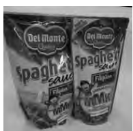
Delmonte Spaghetti Sauce 250 g - 79¢, 560 g - $1.79 ea.