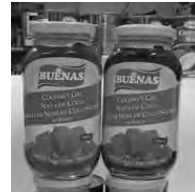
Buenas coconut gel 2/$3.00