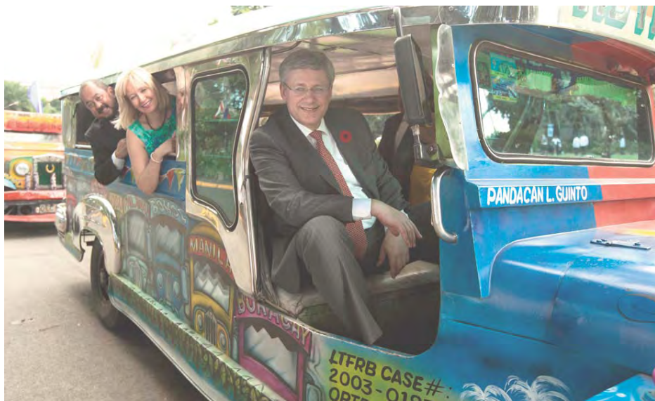
Prime Minister Stephen Harper and his wife Laureen ride a jeepney during a visit to Fort Santiago in Manila, Nov. 10, 2012, accompanied by Senator Tobias Enverga.