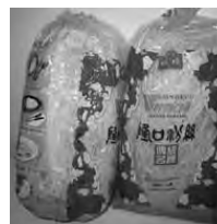
Sotanghon 79¢ each