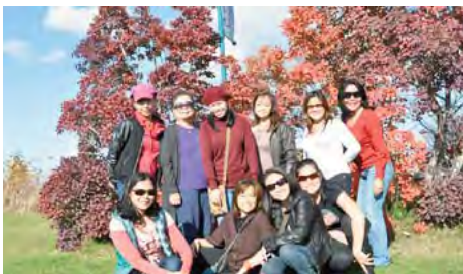
Fall colors at Magog park cannot be resisted, hence, the girls pose for souvenir