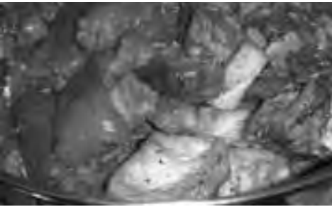
Pata Tim Ingredients: