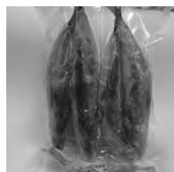
Lucky Roundscad 4-5 pcs $1.99 pack

Prices valid from November 23 - 30, 2012