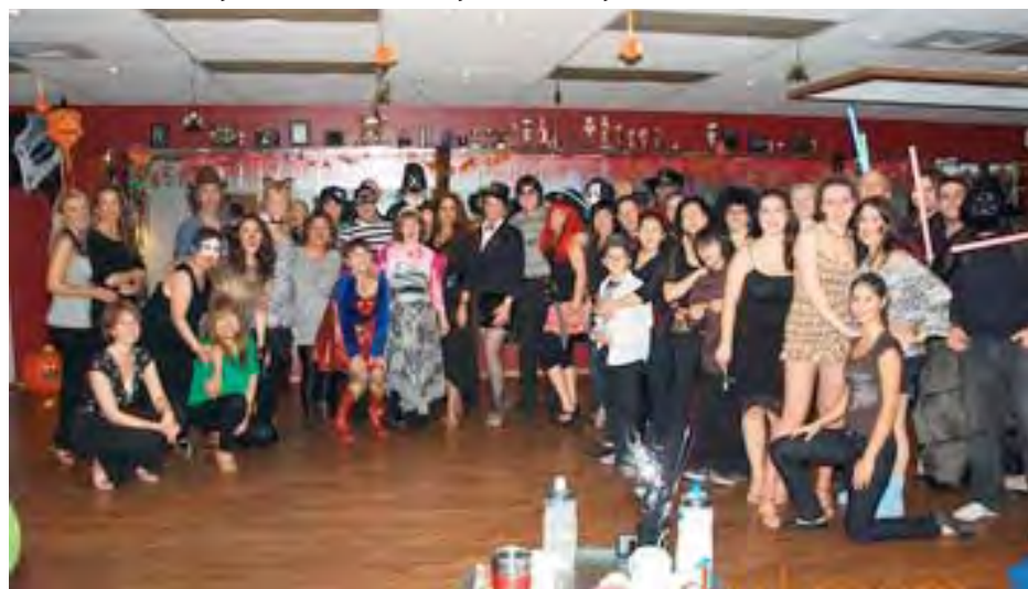
Halloween Party of Ballroom Dance Sport, Thursday, October 25, 2012.