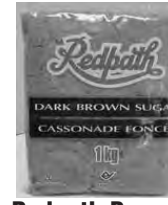
Redpath Brown Sugar, - $2.89