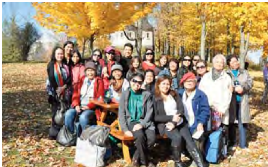
Photo taken after the picnic on the grounds of the St. Benoit du Lac Abbey