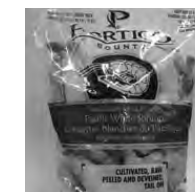
White Shrimp no skin, tail on 2.5 lbs $8.99 pack