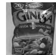
Ginisa - Flavor Seasoning Mix 250 g $1.99 each