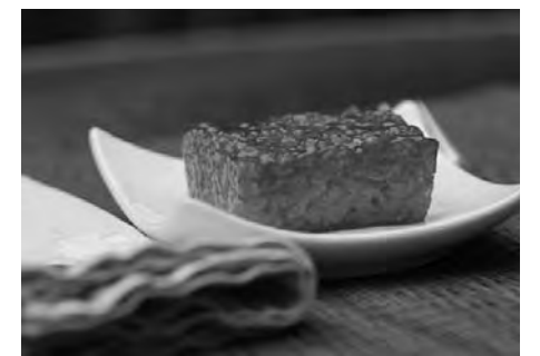
Filipino Dessert Biko (Glutinous Rice)