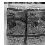
Egg Noodle 79¢ each