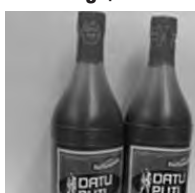
Datu Puti Soya Sauce 1L $1.79 bottle