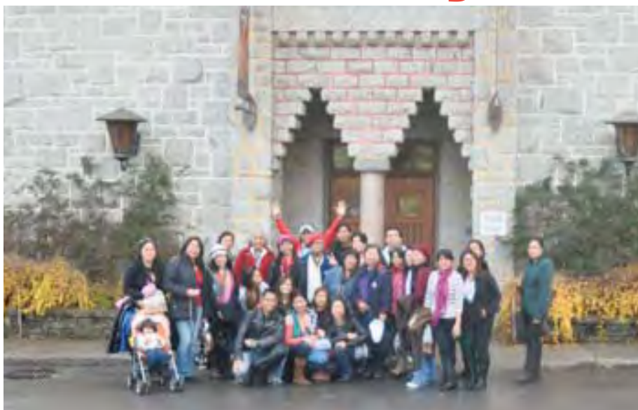
Gilmore College students and friends at the door to the Abbey of St Benoit du Lac, during their trip on October 20, 2012.