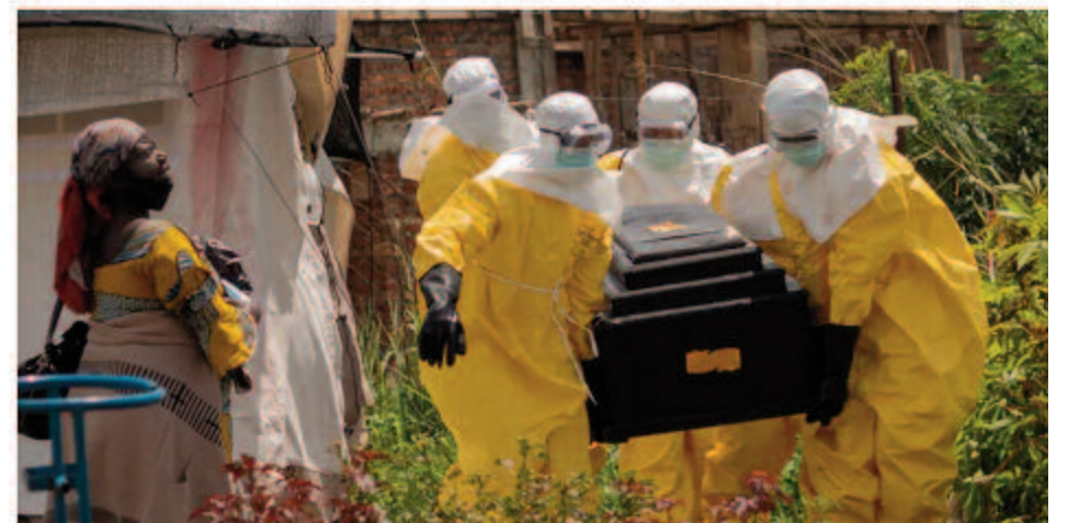
A woman cries as Red Cross workers carry the coffin of a person who died of Ebola from a health center in Rwampara, Congo, Wednesday, May 20, 2026.

the edge of NATO territory. The military maneuvers involve over 64,000 active troops, alongside an array of nuclear-capable submarines, long-range bombers, and mobile missile launchers. Tensions escalated further when Moscow verified that actual