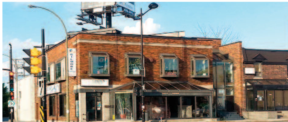
Gilmore College International campus since Sept. 15, 2015 in preparation for its application for accreditation in 2016, 2017, and 2019 which were all rejected in spite of the 3,000 sq. feet facility equipped with a library, cafeteria, computer lab, and sufficient washroom facilities supported by a prospective investment of a local businessman subject to the approval of the permit for a Designated Learning Institution number to resume acceptance of international students.

uphill battle and a lease expiring on September 30, 2026, she posted a furniture clearance ad in her community newspaper and Facebook Marketplace, selling student desks at bargain prices and donating copying machines and computers to a charity in Ghana. In a beautiful twist of fate, this sale revealed a hidden legacy: a former student who had taken French Levels 1 and 2 many years prior responded to the ad to buy a set of 7 classroom chairs and desks at a fraction of their cost. The founder discovered that this