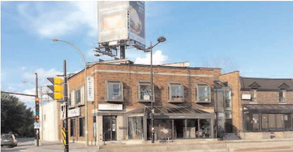
7159, ch. de la Cote des Neiges Montreal, QC H3R 2M2