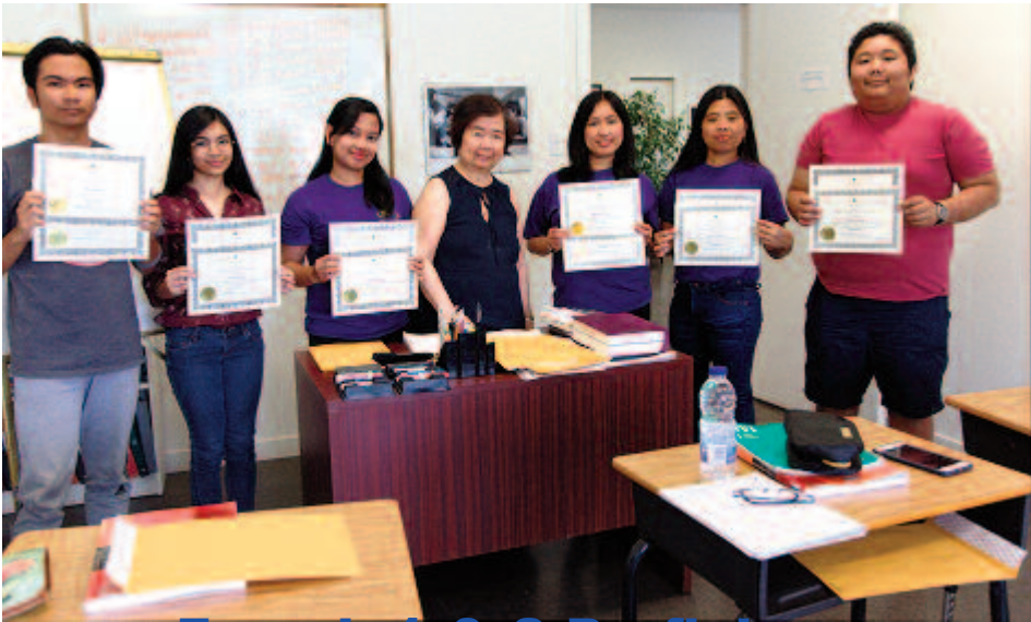
French 1 & 2 Proficiency Certificates Presentation