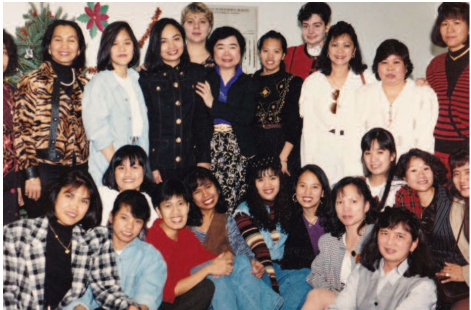
First students' Christmas party held at the Girouard Building where the Gilmore Business Institute was originally located that started on November 1, 1989, and moved to other locations in April 1996 until it moved to the current location on Sept. 15, 2015.