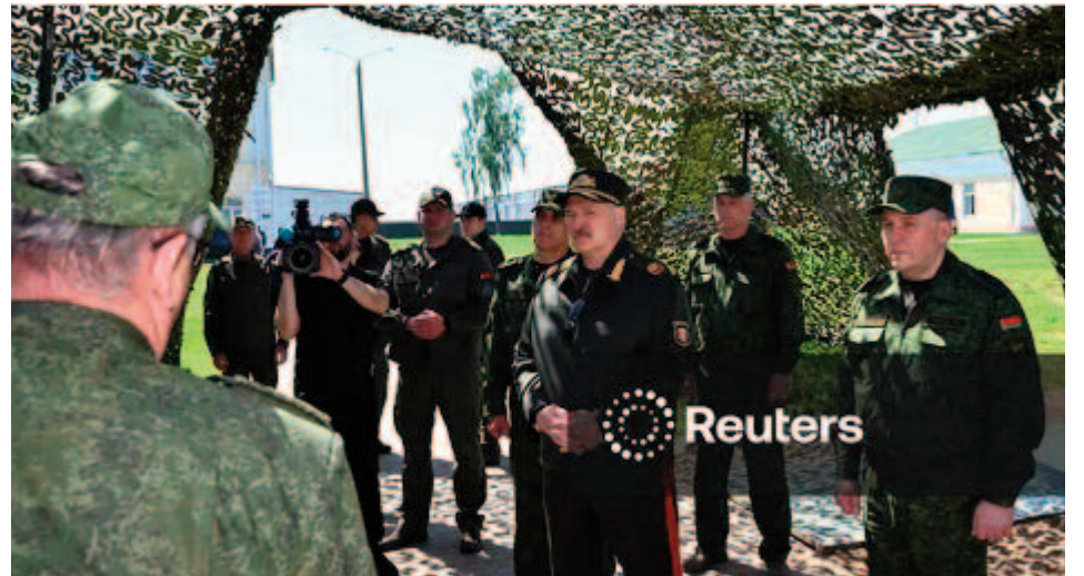
Belarusian President Alexander Lukashenko visits a missile brigade of the Armed Forces during joint Russian-Belarusian nuclear exercises, in the Asipovichy district, Mogilev region, Belarus, May 21, 2026.

Democratic Republic of the Congo and Uganda, health authorities have confirmed that suspected cases have breached the 500 mark, with more than 130 documented fatalities.