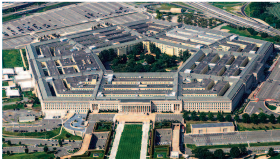
The Pentagon is 'pausing' participation in the Permanent Joint Board on Defence, which works on Canada-U.S. initiatives.

"Canada has yet to make the hard decisions and tradeoffs needed to put it on track to become a credible