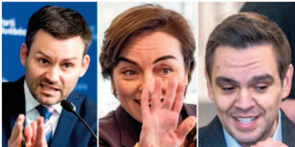
Parti Québécois Leader Paul St-Pierre Plamondon, Coalition Avenir Québec Leader Christine Fréchette and Quebec Liberal Party Leader Charles Milliard.

The Standings: The Parti Québécois (PQ), led by Paul St-Pierre Plamondon, maintains a slim lead with 30% of voting intentions. The Quebec Liberal Party (PLQ) follows closely behind at 28%.