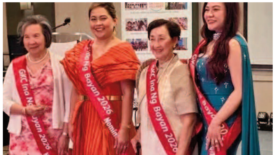
The 4 GK Canada Ina Ng Bayan 2026 Nominees.