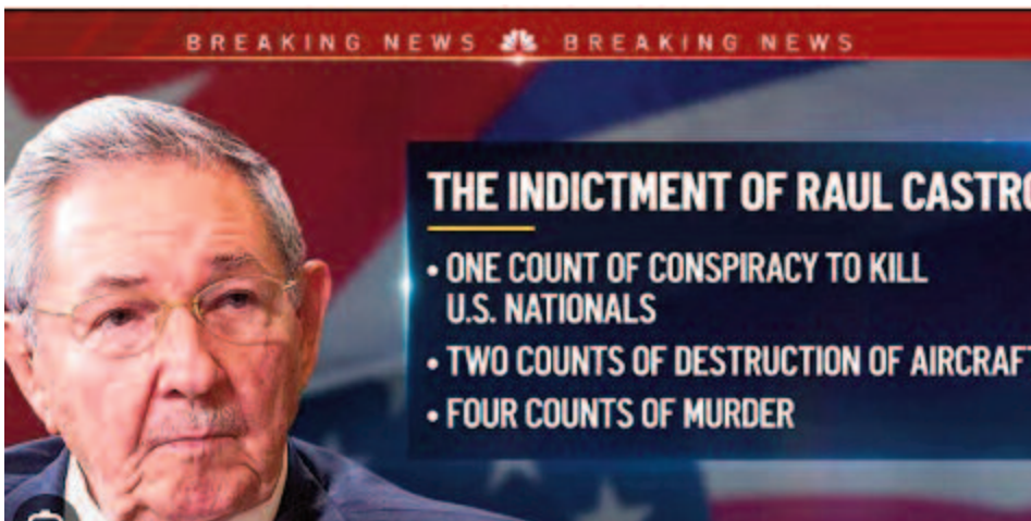
Photo that appeared in the Florida News and NBC News aired on May 20, 2026.

reserves, plunging the nation into widespread blackouts and crippling public transport. The aggressive maneuvers have drawn sharp international blowback, with both Russia and China issuing swift