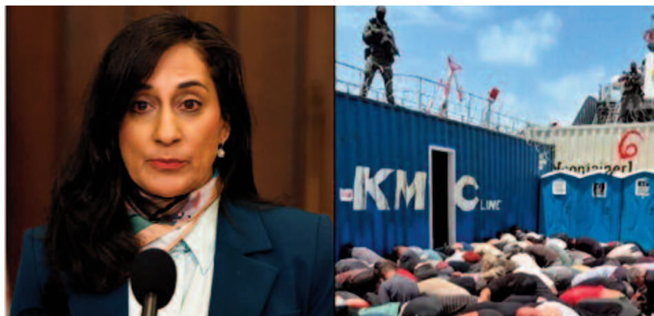
Foreign affairs minister summons Israeli ambassador for 'deplorable' treatment of flotilla activists. Foreign Affairs Minister Anita Anand says she's directed her officials to summon Israeli Ambassador Iddo Moed after the "mistreatment of civilians" aboard a Gaza-bound flotilla. (Excerpts from Global News)

A brief lookback over the years - from 1972 to 1989 founding of the 1st private school by a Filipino-Canadian immigrant