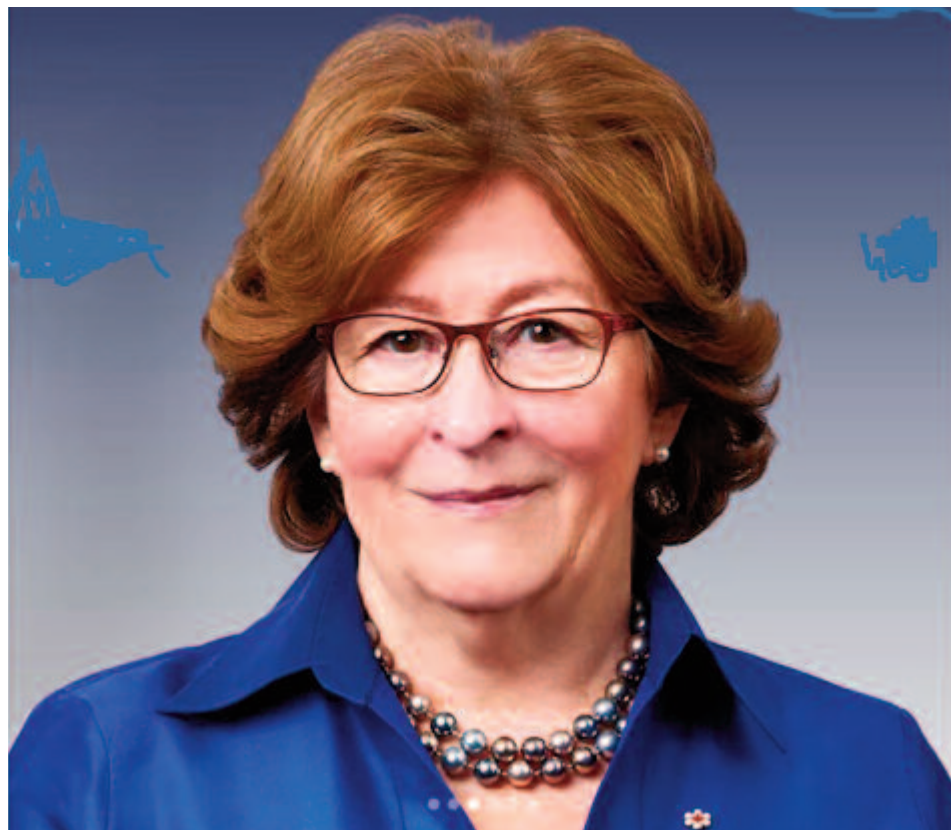
The Honourable Louise Arbour, Governor General-designate of Canada. Carney's official quote, the formal announcement date, Louise Arbour's educational background, and her extensive career accomplishments (including her 42 honorary doctorates