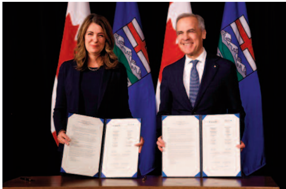
Prime Minister Mark Carney participates in a signing ceremony with Alberta Premier Danielle Smith in Calgary on Friday, May 15, 2026.

At the heart of the federal government's long-term planning is a newly unveiled national electricity strategy aimed at doubling the total capacity of Canada's electrical grid by 2050. Driven by a massive surge in demand from rapid industrial expansion, widespread domestic electrification, and an explosion of AI data centres and cloud computing