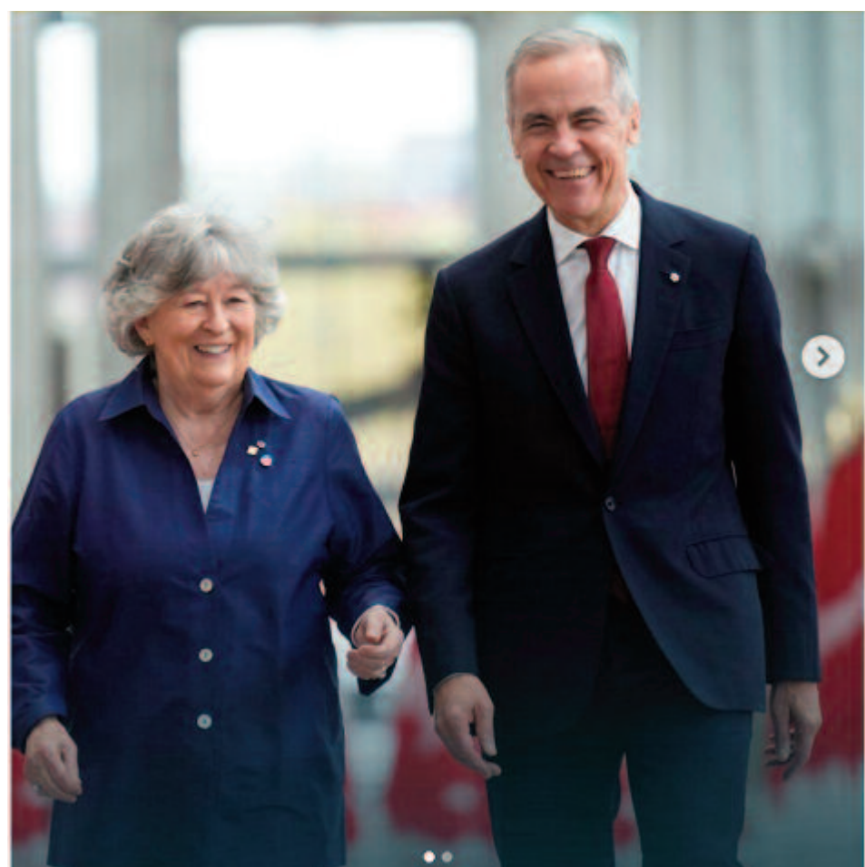
A TRAILBLAZER'S NEW PATH: Prime Minister Mark Carney alongside incoming Governor General Louise Arbour, pictured here during a previous press event in Ottawa.