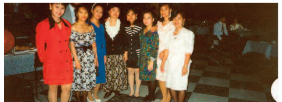
First gala event to celebrate the 3rd anniversary of Gilmore Business Institute held at the Victoria Hall, Westmount, QC, Nov. 3, 1992.

My dream is my final gift to the country that adopted me. Please, walk with me as I finish this work. #