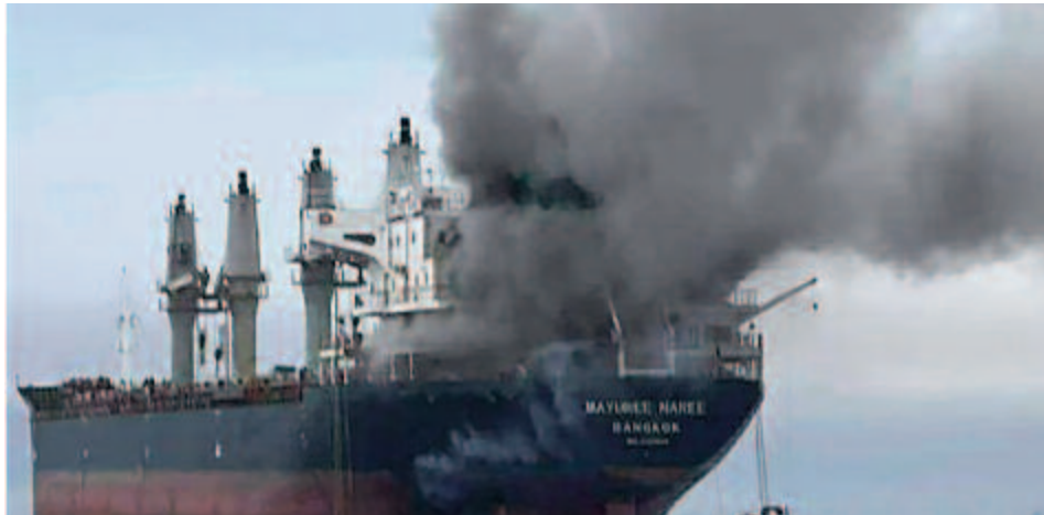
Smoke rises from the Thai bulk carrier Mayuree Naree near the Strait of Hormuz after it was hit by a projectile on Wednesday. As part of its retaliation against U.S. and Israeli airstrikes, Iran is choking traffic through the Strait of Hormuz, a critical water-way for a range of Gulf exports.

In a blunt show of force aimed directly at Western powers, Russia and Belarus have launched unannounced, massive strategic nuclear drills along