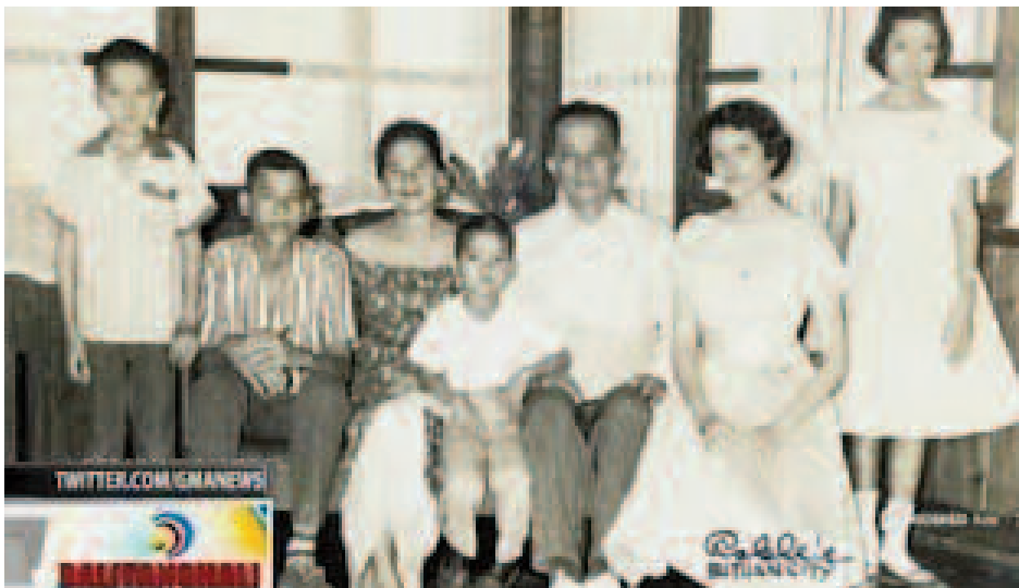
Rodrigo Duterte (second from left) as a young boy with his parents and siblings.

Then Duterte became officer-in-charge vice mayor and won the mayoralty in 1988 until 1998. After his