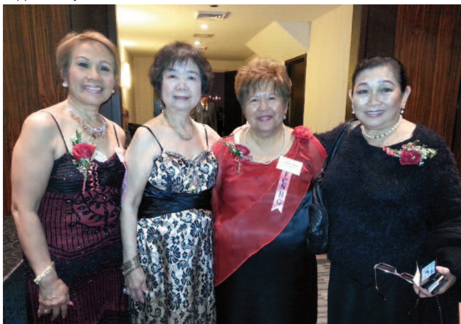
Souvenir photo of the Launching of the Canadian Filipino Nurses Heritage Guild at the Plaza Hotel, April 30, 2016.