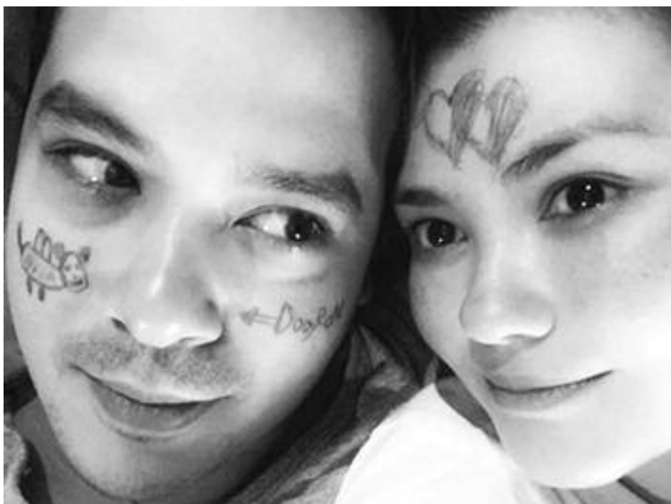
John Lloyd Cruz with Angelica Panganiban

Angelica Panganiban admits she has not yet fully recovered from her failed relationship with John Lloyd Cruz.