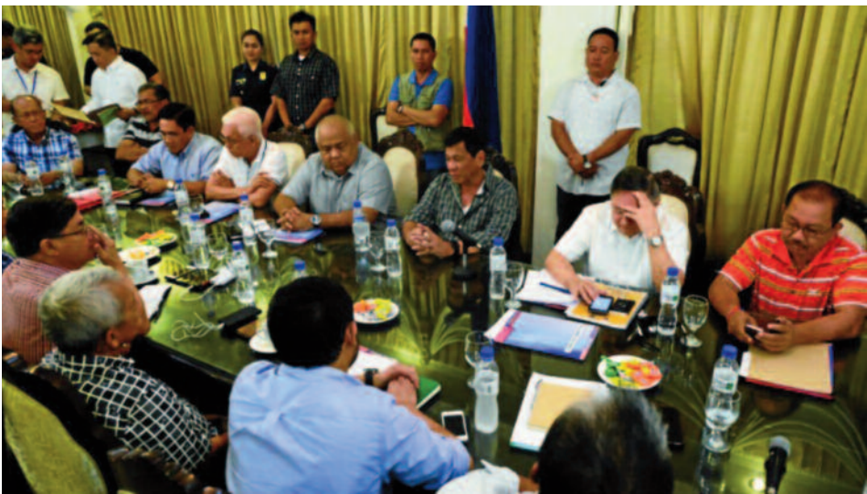
OFFICIAL FAMILY President-elect Rodrigo Duterte presents newly appointed members of his Cabinet during a press conference at Malacañang of the South in Panacan, Davao City.