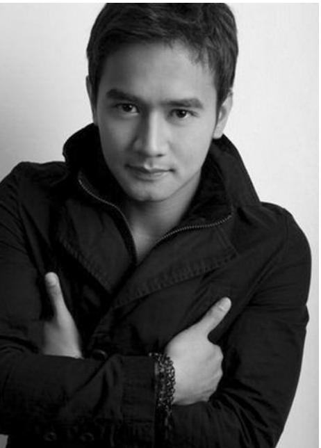
JM De Guzman

More than a year since going on hiatus, the actor returned to show business in 2014 following completion of a 15-month drug rehabilitation program.