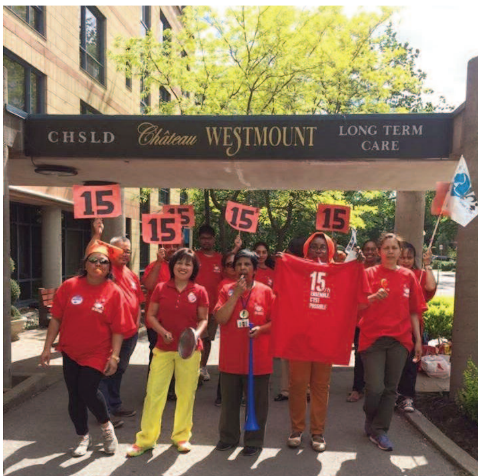
CHSLD Chateau Westmount on strike for their $15/h minimum wage demand supported by SQEES and 298 FTQ.