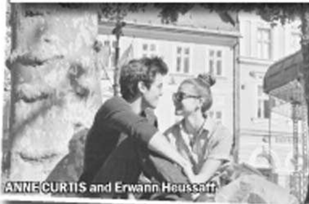
ANNE CURTIS and Erwann Heussaff