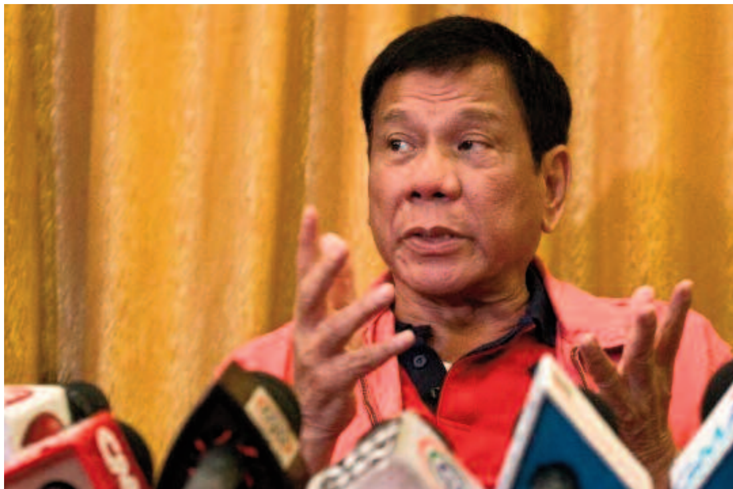
President-elect Rodrigo Duterte answering questions of the press

Philippines President-elect Rodrigo Duterte has named the members of his cabinet from his home town of Davao, a day after a joint session of Congress declared him the winner of the May 9 presidential elections.