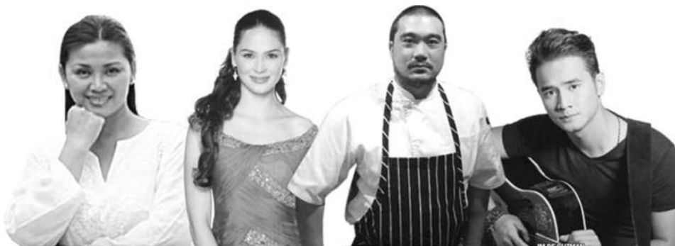
Princess Punzalan, Kristine Hermosa-Sotto, Victor Neri, JM De Guzman

They were the brightest stars with projects left and right – until they seemingly just vanished into thin air.