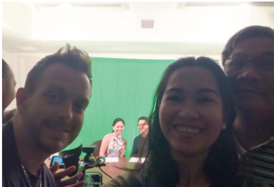
The MMTV crew on the foreground, smiling for the camera while the TV anchors look amused in the background.