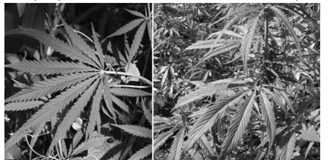
Legalizing pot (left-hand image), some say, would eliminate many negative environmental impacts associated with clandestine growing and illegal smuggling. It would also likely open the door for the legalization of hemp (right-hand image), a relative of the cannabis plant that can't get you high but could help us sustainably meet a good amount of our fiber and fuel needs. (Wikipedia)

It is well known that legalizing pot could have great economic benefits in California and elsewhere by allowing the government to tax it (like it now does on liquor and cigarettes), by ending expensive and ongoing operations to eradicate it, and by keeping millions of otherwise innocent and non-violent marijuana offenders out of already overburdened federal and state prisons.