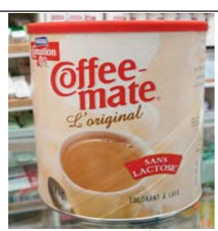
Coffeemate - $6.45 Regular - $7.99 Limit: One per customer Until quantities last.