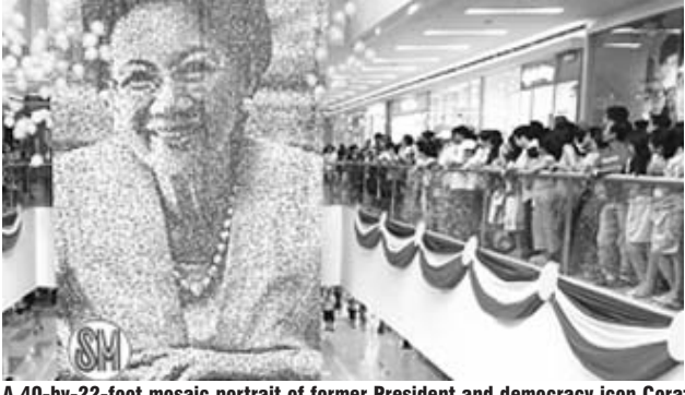
A 40-by-22-foot mosaic portrait of former President and democracy icon Corazon Cory' C. Aquino is rolled out at the center of the SM department store in Tarlac City on Sunday, May 22, 2011

There is no belated celebration of Mother's Day.