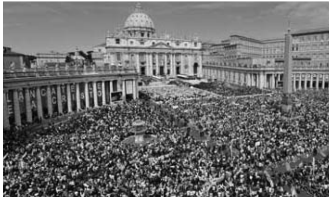
A huge crowd approximately 1.5 million people attended the beatification of Pope John Paul II on May 1. 2011

A total of 87 international delegations attended the ceremony, including 22 world leaders. Five European royal families were