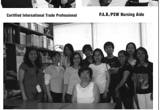
Sunday French Class