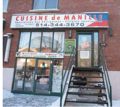
Entrance to the Marché Coop is to go up the stairs and enter the restaurant, then down the basement where the store is located.

<u>Members only</u> discount days - <u>Every</u> <u>Wednesday</u>, minimum cash purchase of $35, except on rice, will be entitled to a 2% discount. Not applicable on product specials and rice.