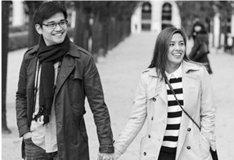
Nikki Gil is on vacation with her hubby in Paris, France.