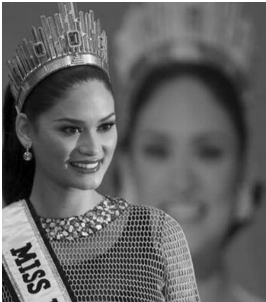
Miss Universe Pia Wurtzbach

In a Facebook live video aired on March at at 1 a.m. (Philippine time), Wurtzbach asked for suggestions from Miss Universe Facebook page subscribers.