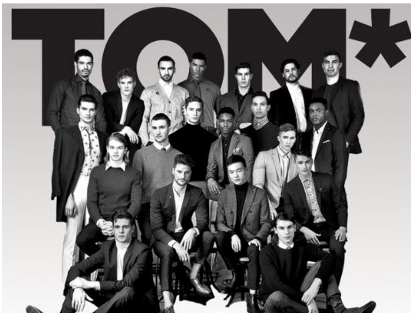
Toronto Men's Fashion Week (TOM*) MensFashion4Hope featuring 20 of Canada's top male models.