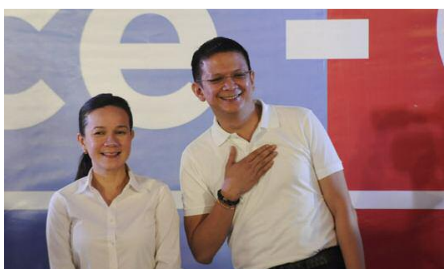
Senators Grace Poe and Francis Escudero announce their complete senatorial lineup on Thursday, October 29, 2015, at Club Filipino in San Juan City.

MANILA, Philippines (UPDATED) – The Commission on Elections (Comelec) on Tuesday, March 22, appealed the Supreme Court (SC) ruling that allowed Senator Grace Poe to run for president.