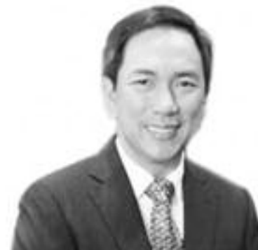
Former DOE Secretary Jericho Petilla

Many believe that if properly harnessed, movies could actually help propel the nation forward. Former Department Of Energy Secretary Carlos Jericho L. Petilla is among those who think so.