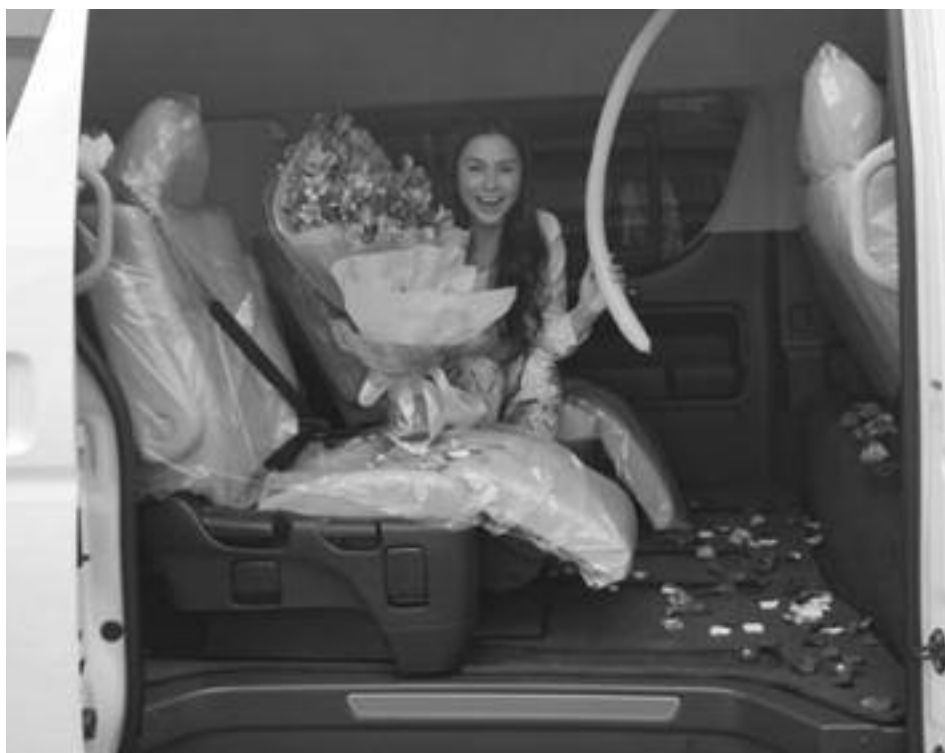
Mariel all smiles inside the van Robin gave her

Robin Padilla bought wife Mariel Rodriguez a van as surprise gift coinciding with the airing of his new show "Game Ng Bayan" on Monday.