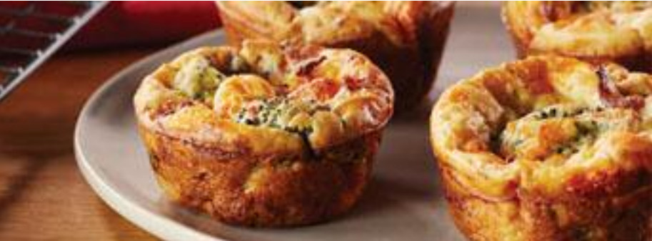
Mini cheddar, broccoli and bacon quiches

Recipe Tips 1. These adorable mini quiches are perfect for breakfast, brunch or served as an appetizer at your next party. Nutritional Information (Per Serving) 100 Calories, 5g Fat, 55mg Cholesterol, 320mg Sodium, 7g Carbohydrate, 1g Dietary Fibre, 6g Protein, 6% Daily Value Calcium SOURCE OF CALCIUM with Migneron De Charlevoix Cheese Potato and Mushroom Bake with Migneron De Charlevoix Cheese Prep/Cook Time: 15/90 min