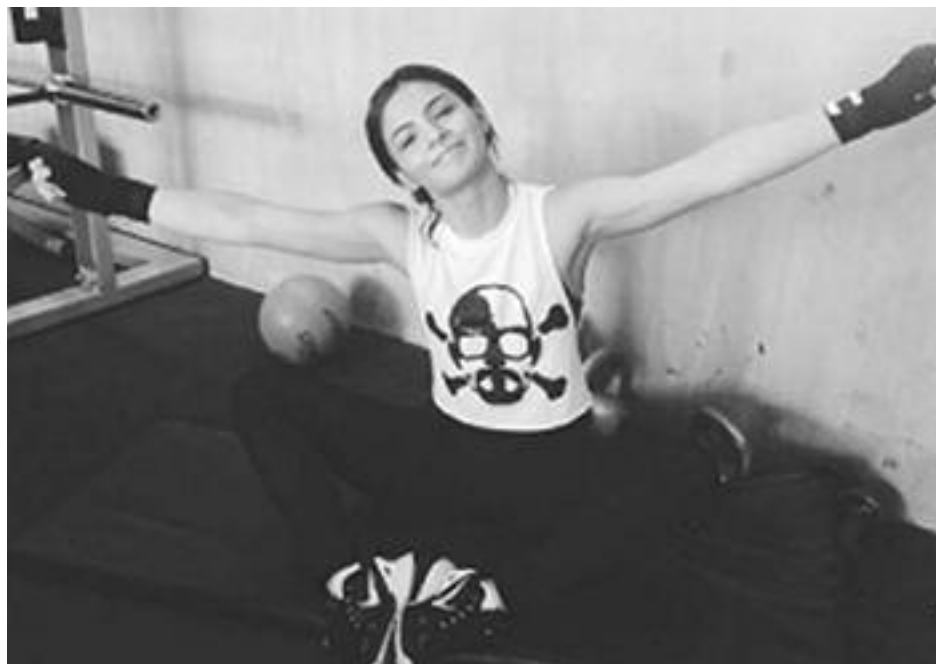
Lovi Poe (instagram)

After consulting a therapist, Lovi was surprised to learn she has knee strength of a 50-year-old.