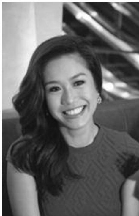
Rachelle Ann Go

She may have gotten good reviews over her essay of Fantine in the Manila run of "Les Misérables" but Rachelle Ann Go is not about to relax.