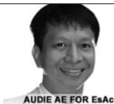
AUDIE AE FOR EsAc