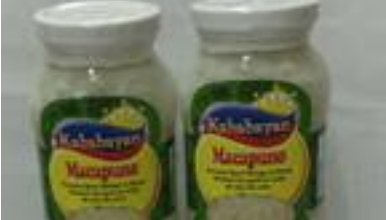
Kabayan Macapuno - 2/$5.00