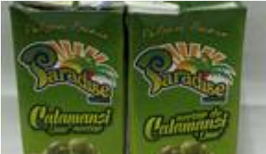
Paradise Calamansi Juice 1L - $1.99