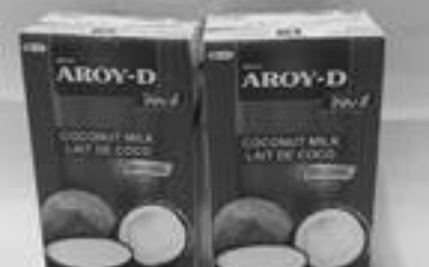
Aroy-D Coconut Milk - $1.69 box.