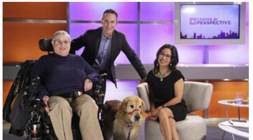
The first photo from the set of Anna Karina's show "Canada in Perspective" on AMI-TV

offered to international conferences on accessibility and employment. In addition, I will make parts of the film available to post-secondary schools to help inform future business leaders and hiring managers of the business value and social return on investment when you hire someone with a disability."