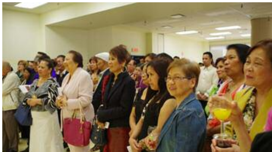
Filipino-Canadian guests extend a warm reception to the visiting Filipino artist whose works were exhibited at the Centre de Ressources Communautaire de Côte-des-Neiges in Montreal

From many-hued renditions of the iconic jeepney and the kalesa to young Filipino maidens and lively musicians, Images of the Homeland struck a nostalgic chord among the exhibit's Filipino-Canadian audience while eliciting high