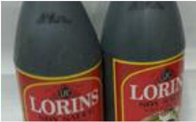
Lorins Soya Sauce 1L - $1.49 bottle