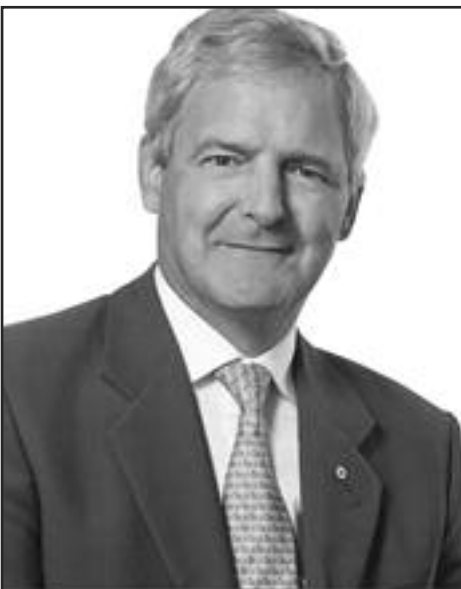
Hon. Marc Garneau, O.C. député, MP Westmount--Ville-Marie

Tél./Tel.: 514-285-2013 marc.garneau@parl.gc.ca www.marcgarneau.ca