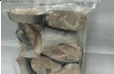
Basa Steak 2 lbs 2/$9.00