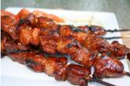
Pork Barbecue on the grill

Ingredients: pork shoulder or pork belly - 2 pounds, slice in 1-inch cuts, ready to skewer garlic - 1 teaspoon, finely minced soy sauce - 1/2 cup calamansi juice (the Filipino lime) - 1/4 cup, frozen calamansi concentrate, or use fresh (from Asian markets) or use fresh lemons banana catsup - 1/2 cup, from Asian markets (or use tomato catsup)