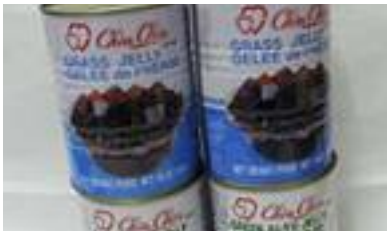
Chin Chin Grass Jelly - $1.29 can