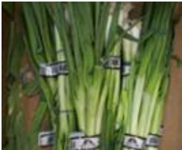
Green Onion - 3/$1.00