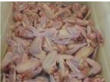
Chicken wings - $2.49 lb