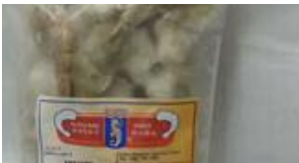
Shrimp headless 31-40, $13.99 pack 2 lbs