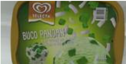
Selecta Ice Cream - $10.00 can