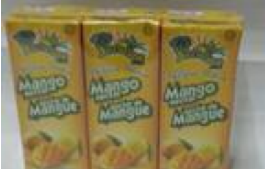
Paadise Mango Juice 3 x 325 mL - $1.99