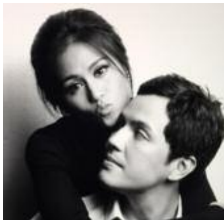
Toni Gonzaga & Paul Soriano

Days after tying the knot with Paul Soriano, actress Toni Gonzaga said she misses living with her family and that she's still getting used to seeing her name with a hyphen.