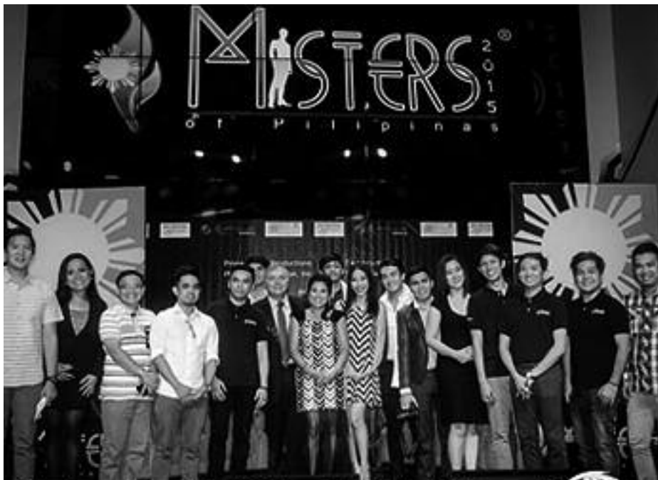
The Press Launch of Mistery 2015: The Mistery of Pilipinas with Prime Event Productions Philippines Foundation Inc. and co-presenter Teceruma Spa and Salon.

This year's finals will be held at Newport Performing Arts Theater Resorts World Manila on September 13, 2015. For more inquiries, contact 09172480939/09159085959