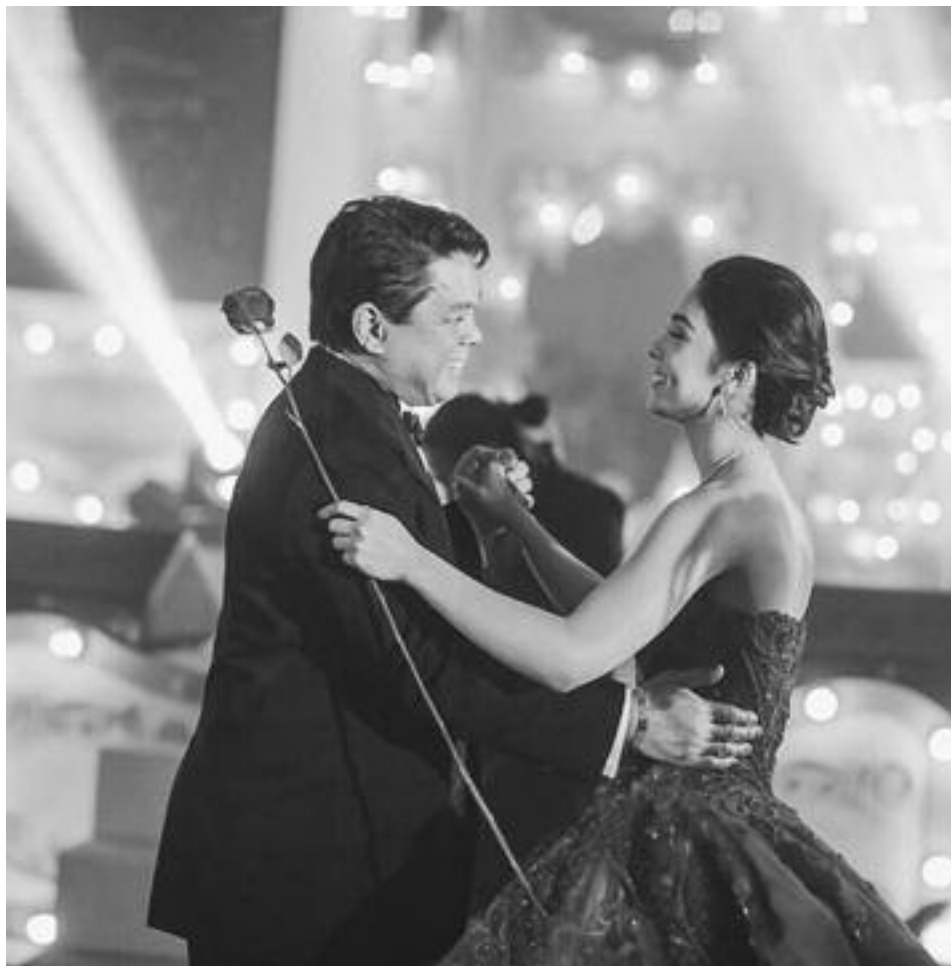
Dennis Padilla & Kris Aquino

In a candid moment, Dennis Padilla told Kris Aquino that he had ill feelings toward her at one point over a comment she made about his relationship with his daughter, teen star Julia Barretto.