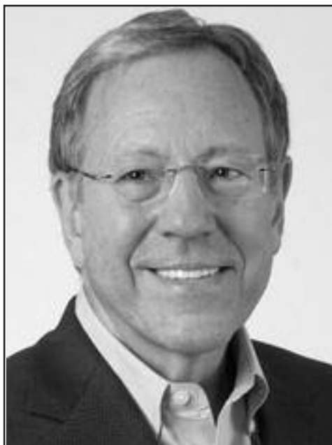
Hon. Irwin Cotler, P.C., O.C., c.p., o.c. député, MP Mont-Royal, Mount Royal

Tél./Tel. 514-283-0171 irwin.cotler@parl.gc.ca www.irwincotler.ca