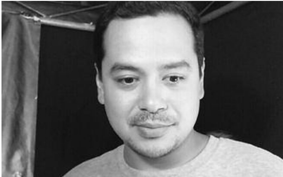
John Lloyd Cruz

Actor John Lloyd Cruz has finally spoken on the issue that he and actress Angelica Panganiban have ended their relationship.