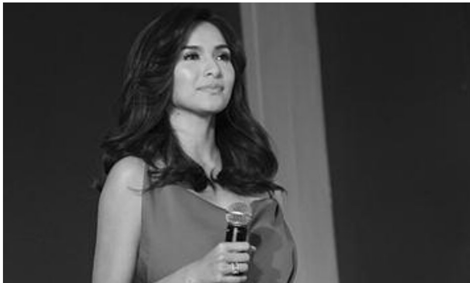
Jennylyn Mercado is the country's sexiest woman this year, according to men's magazine FHM Philippines.

Jennylyn Mercado is FHM Philippines' sexiest woman.