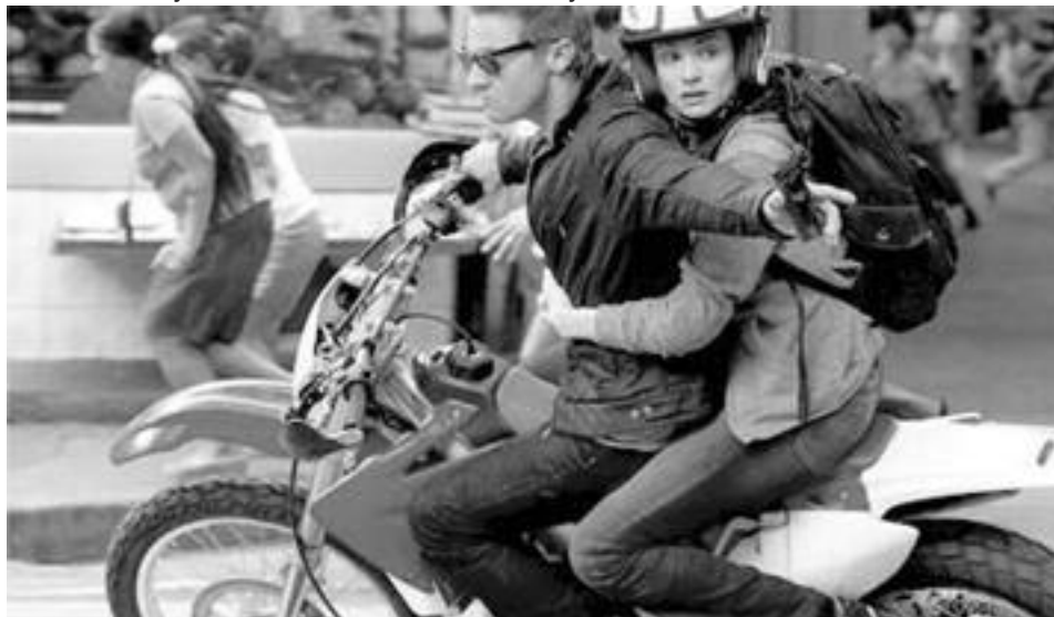
Jeremy Renner and Rachel Weisz ripping through the busy streets of Manila

Manila is historic as it is beautiful. Though quite removed today from the majesty that earned it the tag "Pearl of the Orient," cinematographers and movie directors still deem it interesting enough to be the backdrop of their films. To commemorate the founding anniversary of our dearest Manila, we look back at some of the films shot within the city: