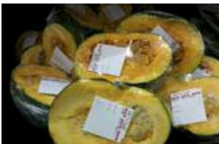
Butter cup - $0.79 lb