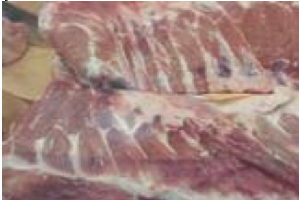
Pork Spare ribs - $2.49 lb