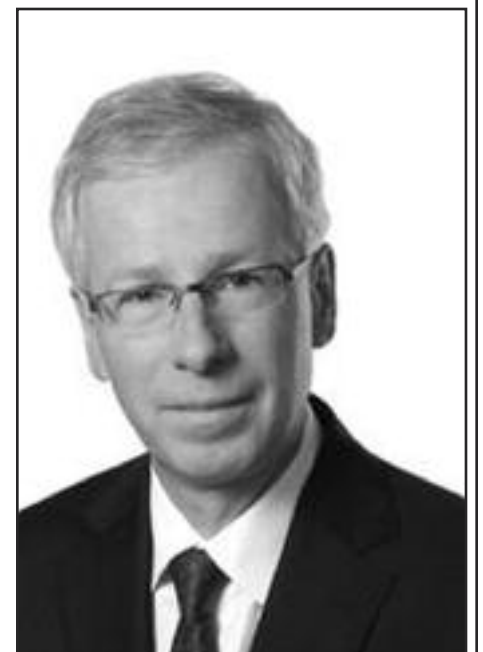
Hon. Stéphane Dion, C.P., P.C. député, MP Saint-Laurent--Cartierville

Tél./Tel. 514-333-6655 stephane.dion.c1@parl.gc.ca www.stephane.dion.liberal.ca