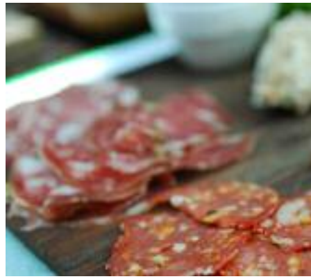
That salami on your plate might look scrumptious but Environmental Working Group warns it may contain nitrates linked to cancers of the stomach, esophagus, brain and thyroid.

Most of the potassium bromate added to foods converts to non-carcinogenic potassium bromide during the process of baking, but small