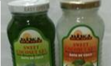
Diwa Coco Gel - $1.49 bottle