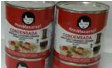
MMM Sarap Condensed Milk - $1.49 can