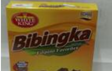
WK Bibingka Mix - 2/$3.00