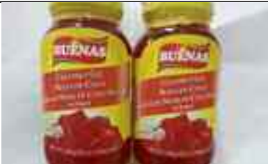
Buenas Coconut gel - 2/$3.00