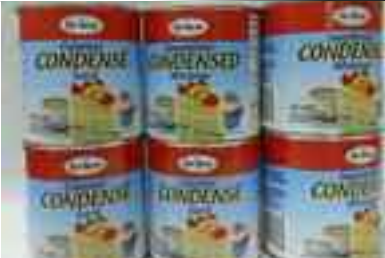
Grace Condensed Milk $1.59 can