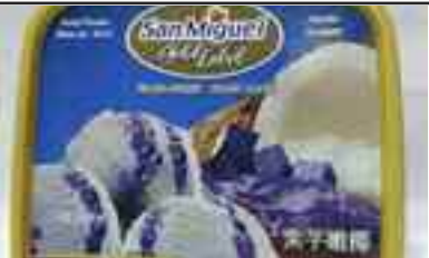
San Miguel Ice Cream $6.99 ea.