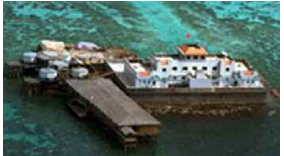
Miscief Bay Reef of the Chinese installation

"But the nationalists backed off when China took possession of Panatag Shoal (Scarborough Shoal) in August 2012. China then roped off the narrow and only opening to the shoal's lagoon; thus, preventing Filipino