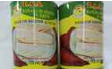
T.A.S. Banana blossom $1.19 can