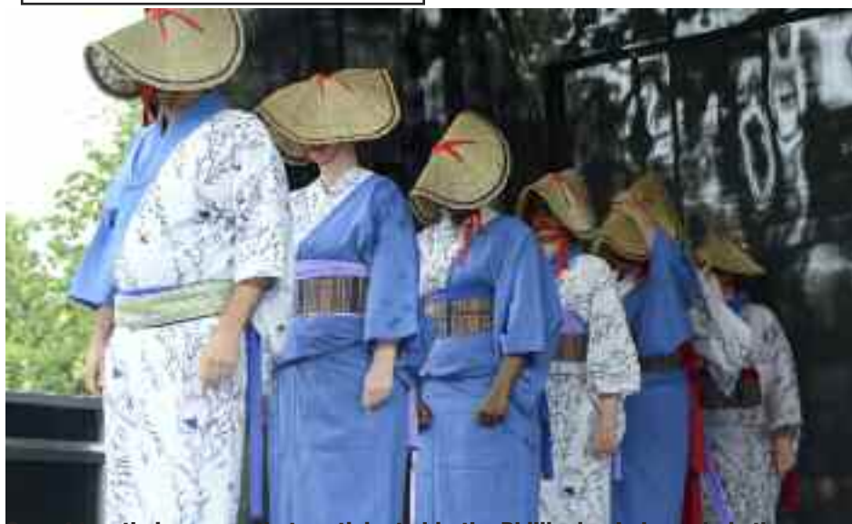
One of the ethnic groups that participated in the Philippine Independence is the Japanese folk dance troupe who always participates every year.

Please bring identification like social security, medicare card, last membership card and driver's license.