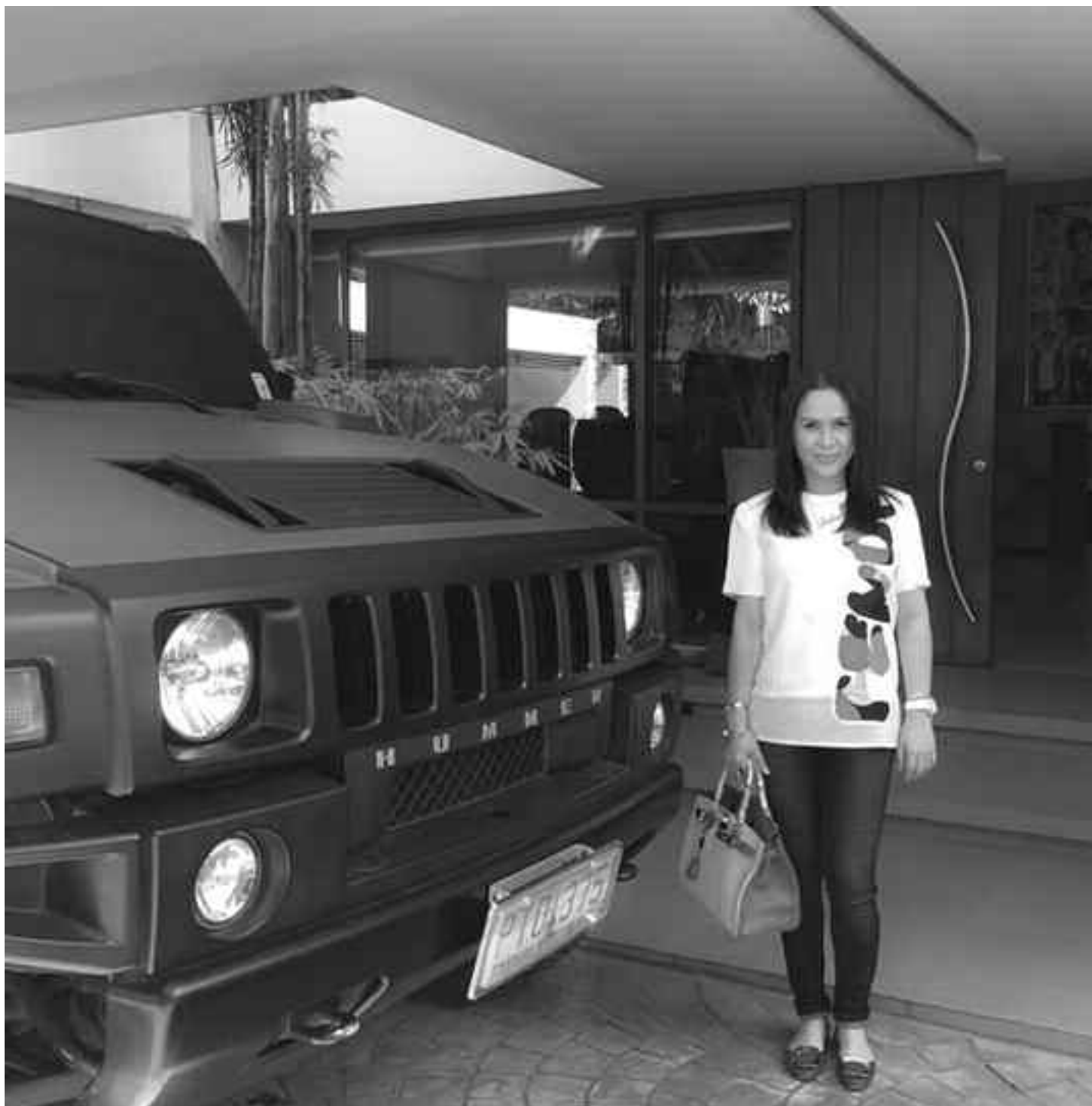
The picture came with the caption: "When you soak in His presence and in the Love of God you will be refreshed. Have a blessed and lovely morning!"

Some netizens singled out that Jinkee's post seemingly goes against what she was preaching with her photos' captions. A check on Jinkee's Instagram would show that Manny Pacquiao's wife is fond of quoting bible verses.