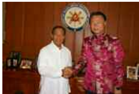
Vice-President Binay and the Chinese Ambassador to the Philippines, Zhao Jianhua

Vice President Binay and Chinese ambassador to the Philippines. Vice President Binay and Chinese ambassador to the Philippines. But what is really strange is that these vocal nationalist and leftist politicians have seemingly adopted a certain “code of silence” when the question of