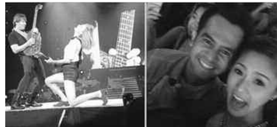
Kim snapped these pictures herself at Taylor Swift's concert

Chiu is a self-confessed Taylor Swift fan. In fact, during the pop star's most recent concert in the Philippines, Chiu secured a VIP ticket just so she could watch Swift perform up close.