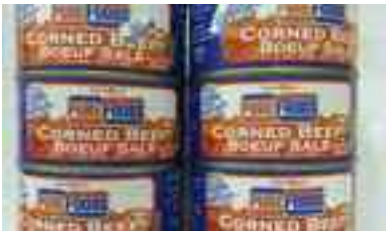
San Miguel Purefood Corned Beef $4.49 ea