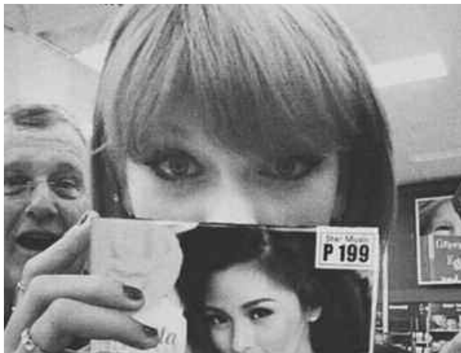
Taylor Swift holding Kim Chiu's CD, real?