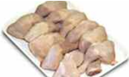
Chicken leg- $0.99 lb