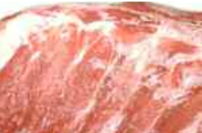
Pork Spare Ribs -$2.49 lb