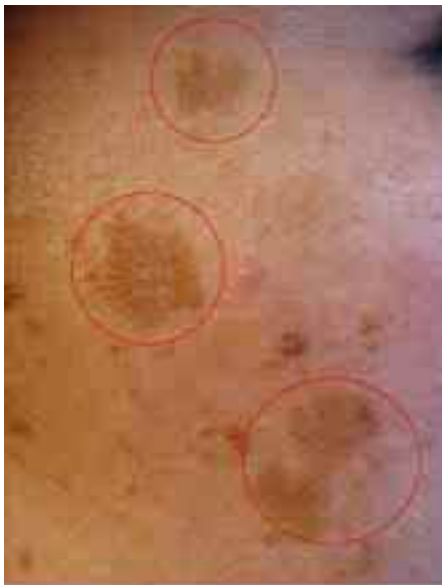
Melasma from Wikipedia

Many types and strengths of chemical peels are available for different skin types. The type of peel should be tailored for each individual and selected by the physician. In treating melasma, 30%-70% glycolic acid peels are very common. Various combinations, including a mix of 10% glycolic acid and 2% HQ, can be used to treat melasma.