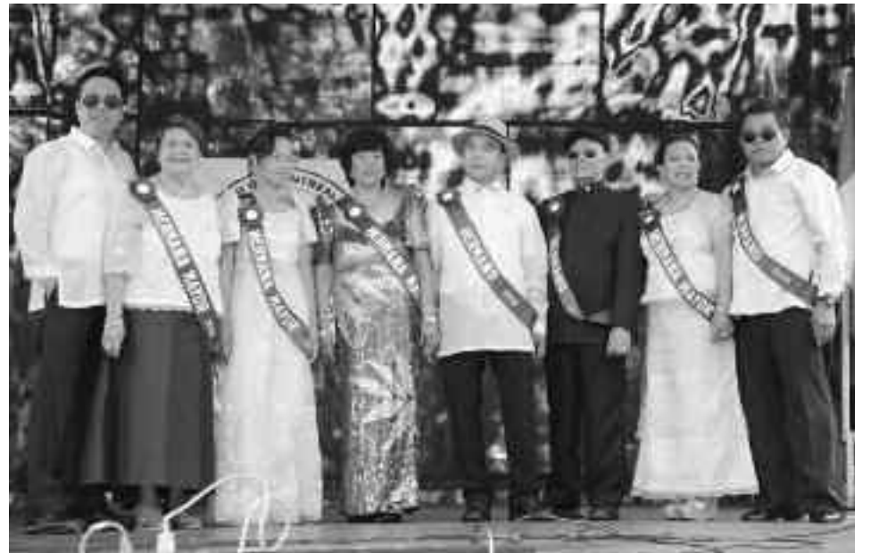
The Hermano Mayors of the Pista sa Nasyon

Pista sa Nasyon, one of the most anticipated events in the Filipino community in summer, was held last July 19 at the Mackenzie King Park. About 800 people, Filipinos and non-Filipinos, gathered at the park to meet friends and acquaintances and simply have fun. Camaraderie was felt everywhere while revellers enjoyed the sumptuous food. More than 50 tents, representing associations, business establishments promoting their products from insurance and crafts and food vendors, were assembled for the occasion.