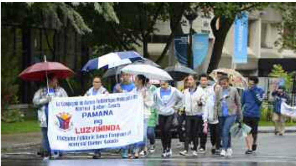
The Pamana ng Luzviminda dance troupe represented by many of its members marching along in the rain