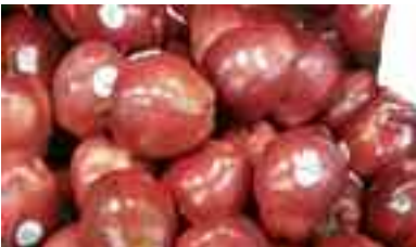
Red Delicious Apple $0.99 lb