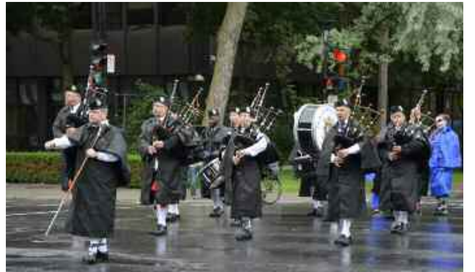
The Black Watch Bugle Corps and Bag Pipes, first time in the Philippine Independence Day celebration, are marching in the rain