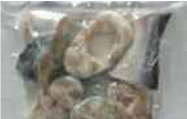
B.S. Steak 2/$9.00 (2 lbs/pack)