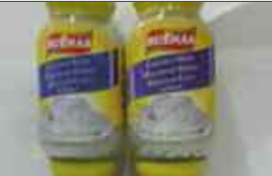
Buenas Coco strings - 2/$5.00