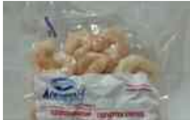
Aquaworld Cooked Shrimp $2.99 pack