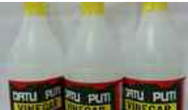
Datu Puti vinegar $1.19 bottle