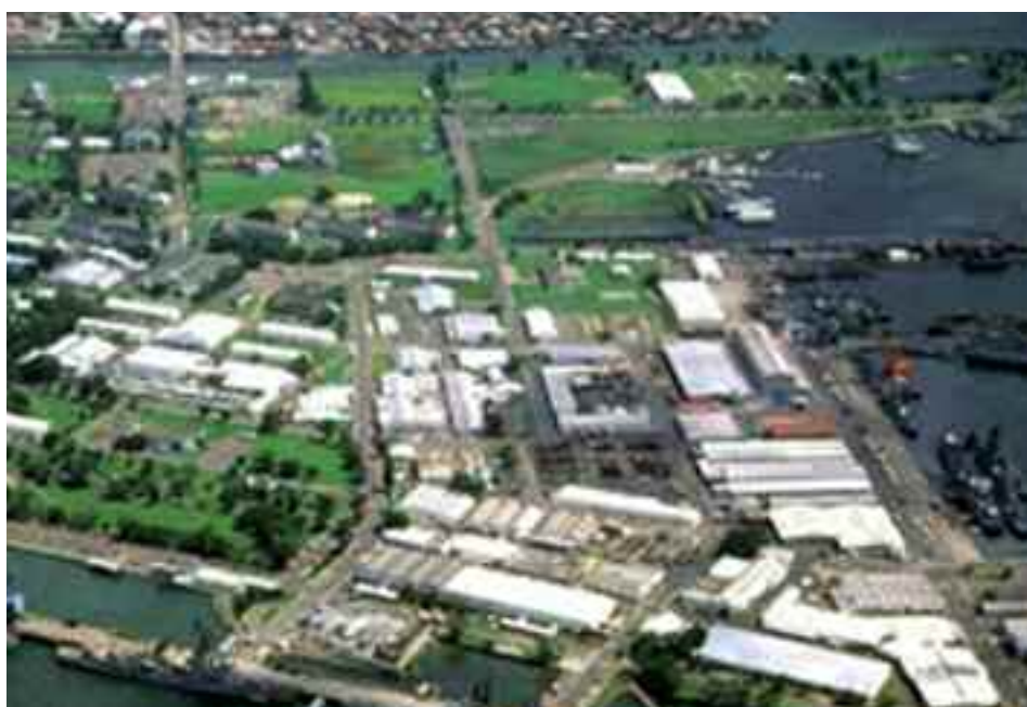
Subic Naval Base

Aquino-and-Obama-presscon-4-28-14 In my article, “Sovereignty or security?” (April 13, 2015), I wrote: “On April 28, 2014, the U.S. and the Philippines signed the Enhanced Defense Cooperation Agreement (EDCA). The purpose of EDCA is to strengthen the U.S.-Philippines security relationship by allowing the U.S. to station troops and operations