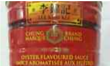
Oyster sauce in a can- 5.49 can