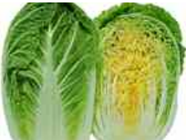
Nappa - $0.49 lb