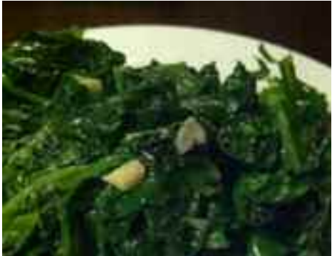
Kale with garlic

Cooking Procedures : In a large pan, heat oil. Fry the potatoes and carrots until color turns light brown. Remove and set aside. Add beef to the pan; stir-fry for a few minutes until lightly brown. Remove and set aside. In the same pan, sauté the garlic and onions until translucent. Add chili flakes. Return beef and accumulated juices to pan. Stir-fry for a few minutes. Add water, tomato sauce, liver spread and bay leaf; stir to combine. Bring to a boil then simmer, about an hour or until meat tender. Add potatoes, carrots and green olives; simmer for another 6 to 8 minutes. Season salt and pepper to taste. Add bell peppers, cook for additional 2 minutes. Transfer to a platter. Serve hot and Enjoy your Kaldereta.