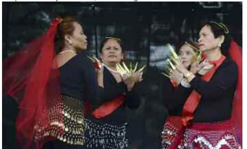
This looks like a group from Thailand showing a typical dance from this country. These dancers performed on stage while the rain continued to pour.