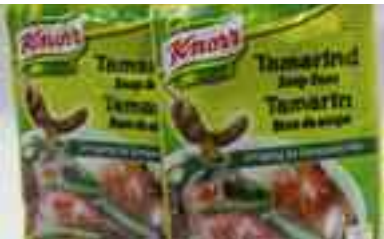
Knorr tamarind - 2/$1.00