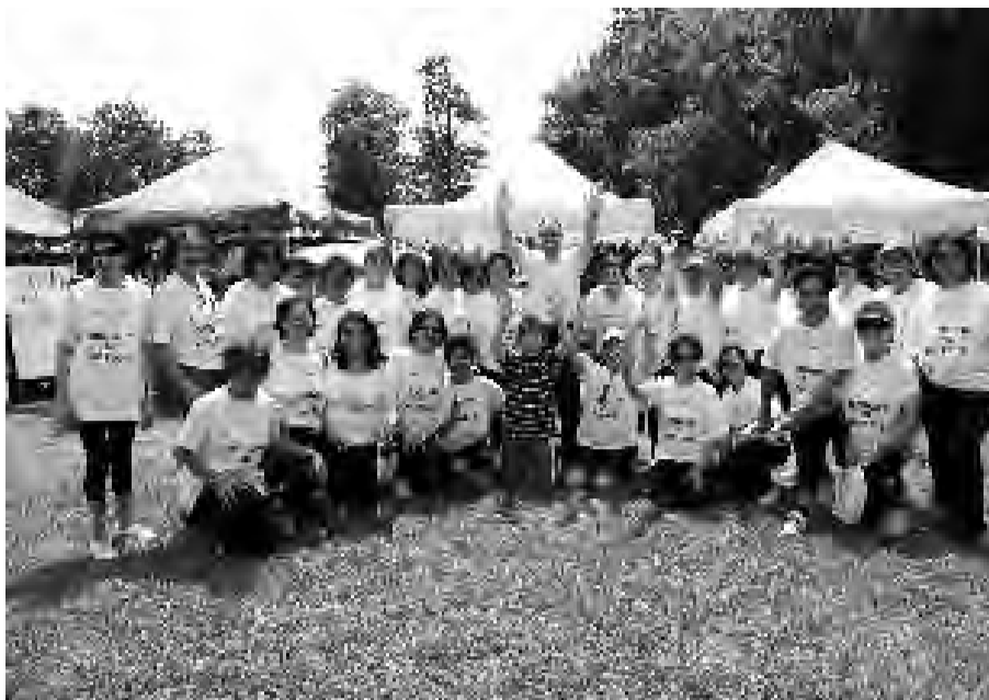
Seniors in Motion pose for souvenir of the Pista sa Nayon at MacKenzie King Park on Sunday, July 17, 2011