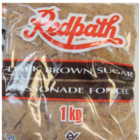
Brown Sugar - $2.99 /kg

who can spare 3 hours a week to be trained as cashiers during business hours.