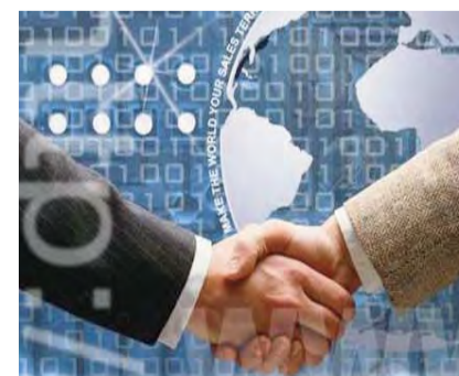
International Trade (C.I.T.P.)