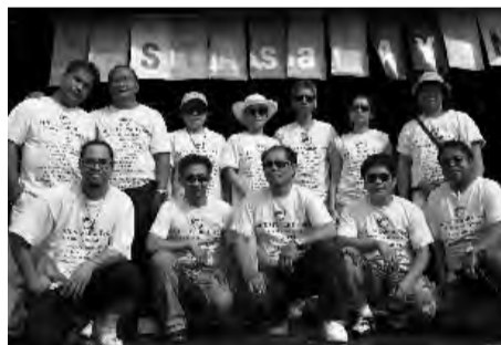
Samahang Makabayan