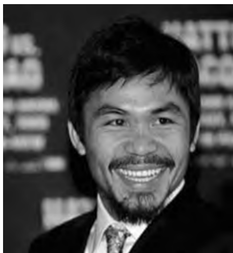
'Masaya ako na tumulong sa mga tao,' says Manny Pacquiao

Boxer-congressman Manny Pacquiao has taken his inner philanthropist to another level by donating three hectares of his land in Sarangani for a housing project to benefit the less fortunate.