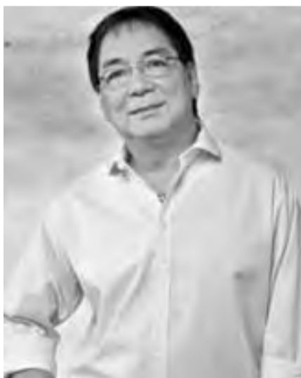
Sayang, pero ganun talaga eh."

This is what veteran TV host and comedian Joey de Leon said about his just-defunct show with broadcast journalist Mel Tiangco, "Mel & Joey," which aired its final episode last July 17 after seven years.