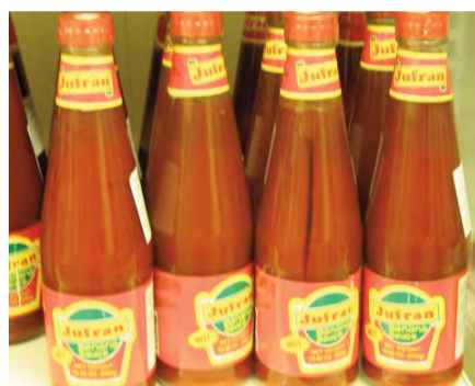
Juffran Sauce - $1.19 bottle