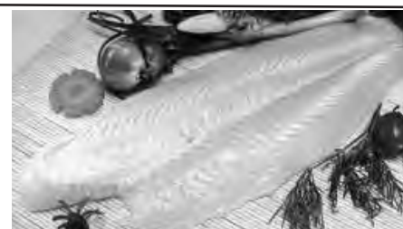
Frozen Basa fillet sold at Marché Coop at $2.60 lb.

To make coconut rice, use this proportion: For every cup of uncooked white rice, use 1/4 cup coconut milk (canned is perfectly fine) and 3/4 cups water.