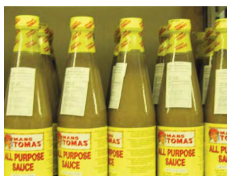
Mang Tomas - $1.69 bottle