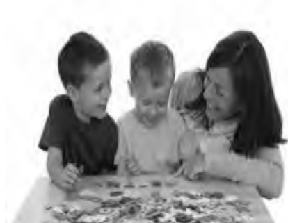
Early Childhood Education Assistant