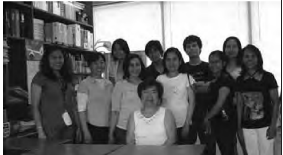
Sunday French Class