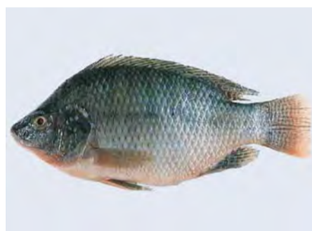
Tilapia, cleaned - $1.69 lb Size 350/550