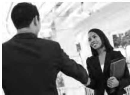
Certified International Trade Professional