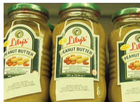
Lily's Peanut Butter- $3.99 jar