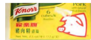
Clearance - 99¢ each Chicken or Pork Cubes