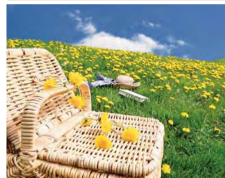
Community Picnic see pages 3, 7