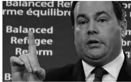
Immigration Minister Kenny

Ottawa, June 28, 2011 — Legislation cracking down on crooked immigration consultants will come into force on June 30, 2011, Citizenship, Immigration and Multiculturalism Minister Jason Kenney announced today.