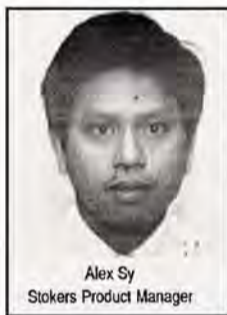
Manager at Kone Wood