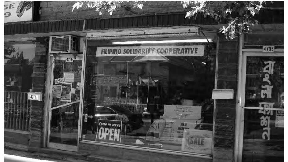
The former location of the Filipino Solidarity Cooperative's store on 4711 Van Horne which is a store front high rent space. Another store occupied it but only lasted for a few months and closed down but the Coop had rented it for a few years, July 2005 to January 2010.

August 21, 2011 at Beaver Lake Park. It is set up as a community pot luck picnic where everyone is invited, members and prospective members alike. Lunch will be from 11:00 a.m. to 2:00 p.m. after which the general assembly of the Coop will start officially to discuss the financial reports for 2009 and 2010 and also to nominate and elect five directors. Any