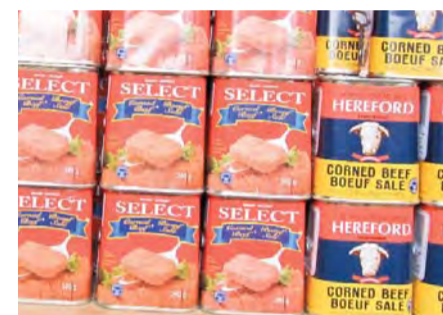
Corned Beef, Hereford or Select - $2.99 each