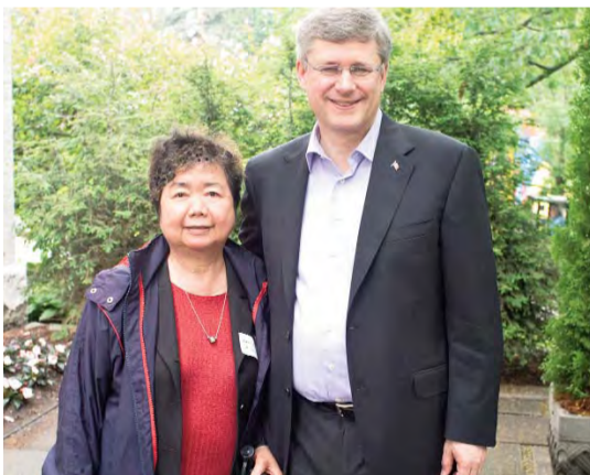
A souvenir photo with Prime Minister Stephen Harper at his garden party at 24 Sussex Drive on Saturday, June 25, 2011