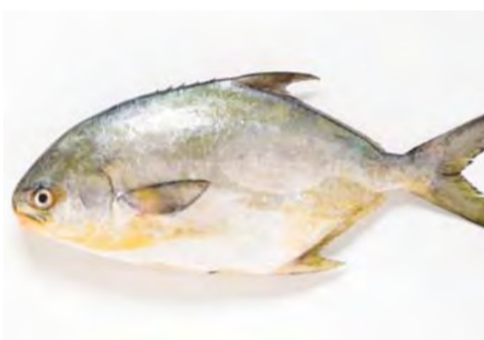
Pompano - $4.99 lb Big size over 1.5 to 2.5 lbs each.