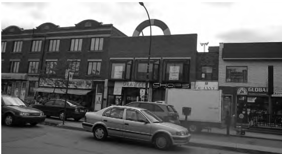
The two-storey building in the center is the new site of Gilmore College International on the second floor measuring 1500 square feet and has three big bay windows, four rooms and a big hallway in the middle of the rooms. Gilmore's new address is: 5320-A Queen Mary Road which is accessible from the Snowdon Metro, and Busses 17, 166, 151.

The staff and administration of Gilmore College International are pleased to announce the new headquarters to be located on a very nice area with a lot of pedestrian traffic which will make the school more visible and accessible. Snowdon Metro is just a block away, and the bus stop for three bus lines are just a few feet away. Being on a two-storey building is an advantage for this allows the putting up of a sign outside the building that will make people aware of the existence of a school that can service their needs. A new park will be built on the corner of Coolbrook and Queen Mary which is just opposite this building. With all the amenities available, students and teachers will find this location ideal and convenient.