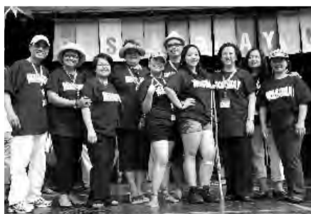
Mabuhay Team