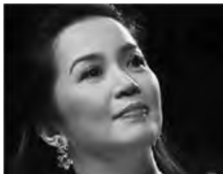
Kris Aquino - still number one

Controversial actress-TV host Kris Aquino is number one in Yes! Magazine's list of Top 20 Endorsers for 2011.