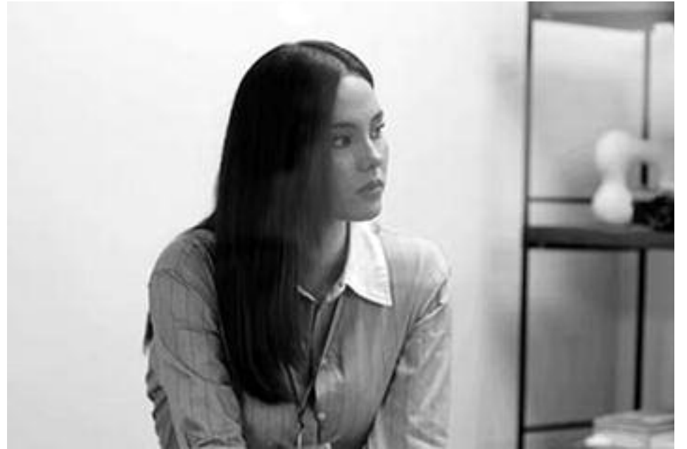
Catriona Gray in a scene from "The Loved One."

"The Loved One" marks Catriona Gray's highly anticipated acting debut, adding to her impressive list of accomplishments. Since her Miss Universe 2018 win, Catriona has consistently proven herself as a multi-talented artist. With the trailer keeping details under wraps, fans are eagerly speculating about how Catriona will portray her character and how she will fit into