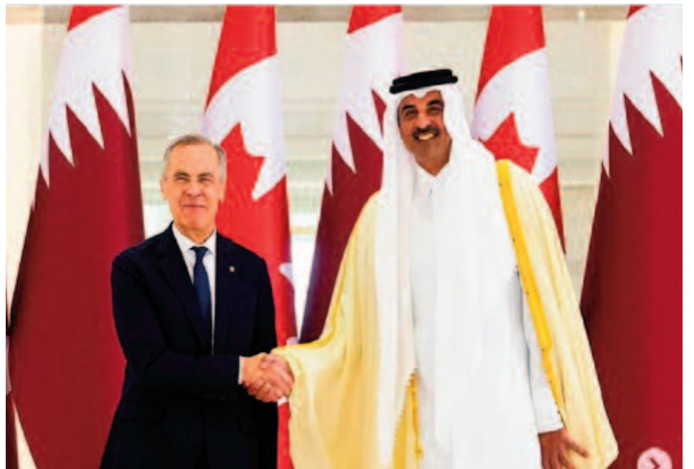
Carney met with Qatar's Amir Sheikh Tamim bin Hamad Al Thani to boost trade, investment, defence, and energy cooperation, with talks also focusing on AI, aerospace, and major infrastructure investments in Canada. (Canadian Press)