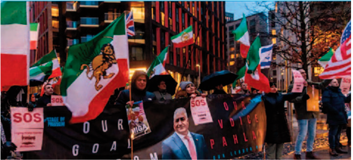
Thousands of Iranians took to the streets across Europe over the weekend, showing their disdain for the Iranian regime, whose violent crackdown on anti-government protests in the country has reportedly killed thousands in recent weeks.

resigned this week in protest of the DOJ's push to investigate activists while declining to investigate the agent that killed the woman.