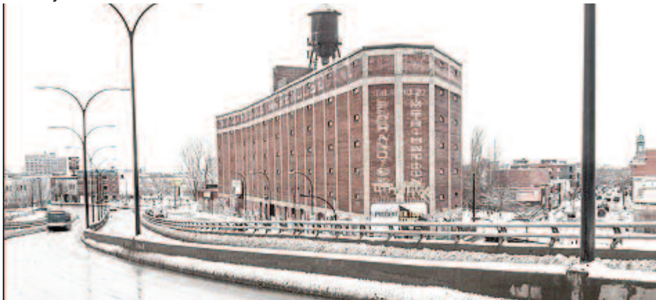
L'entrepôt Van Horne located on 1, ave Van Horne

Montreal, QC — An updated revitalization plan for the historic Entrepôt Van Horne in the Mile End neighbourhood has won broad public approval following a city-led consultation process, signaling strong community support for the proposed mixed-use redevelopment of the century-old industrial landmark.