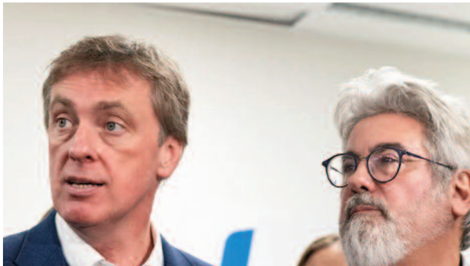
Marc Tanguay, left, will once again become the interim leader of the Quebec Liberal Party following the resignation of Pablo Rodriguez, who is standing to his right in this photo.

Christine Fréchette - Energy Minister, will announce her decision soon. Fréchette entered provincial politics with the CAQ, winning the riding of Sanguinet during the October 2022 provincial election. Considered a high-profile candidate, she was immediately named immigration and French-language minister by Legault. On Sept. 5, 2024, Fréchette was