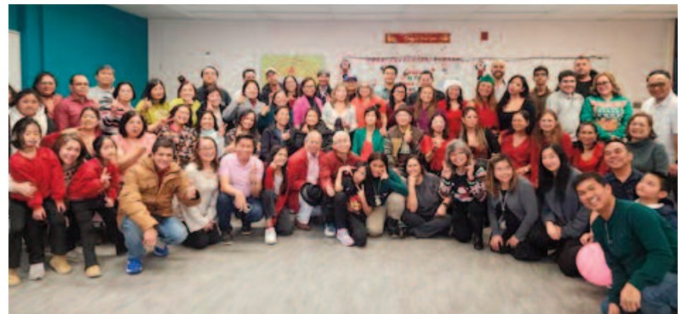
Executive Officers, Directors and members pose for souvenir of the induction and Christmas party held on Dec. 21, 2025.

December 21, 2025 at Edithvale Community Centre in North York, Toronto, Ontario. PTAC, established in May 2006, is mainly composed of former teachers and educators from the Philippines who are professionally certified by the Ontario College of Teachers (OCT), and are currently engaged as practicing teachers in various English school boards and educational institutions in Ontario.