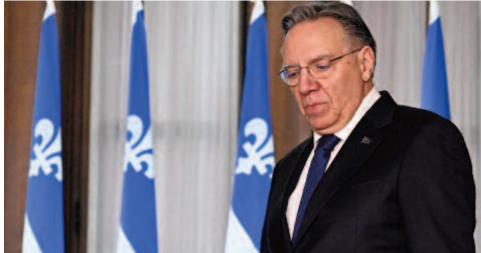
At the press conference in the hall of the National Assembly, January 14, 2026, François Legault announced he is stepping down as premier of Quebec.

premier lost both Lionel Carmant as social services minister, and Christian Dubé, as health minister, over disagreements with the way the government had handled changes in the remuneration of specialists and family doctors.