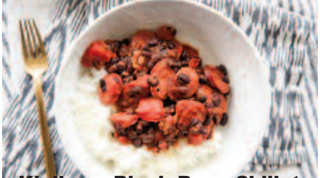
Kielbasa Black Bean Skillet

pieces and fry until golden brown and cooked through, about 5-7 minutes. Remove from the pan and set aside. Make the Sauce: In the same pan, add the orange juice, sugar, and soy sauce. Stir and bring to a simmer. Thicken the Sauce: Mix the cornstarch and water to create a slurry, then add it to the sauce. Stir until it thickens to your desired consistency. Coat the Chicken: Return the chicken to the pan, tossing it in the sauce until well coated. Add the orange zest for that extra zing! Serve: Dish it out over rice or your favorite grain, and enjoy this delicious homemade meal!