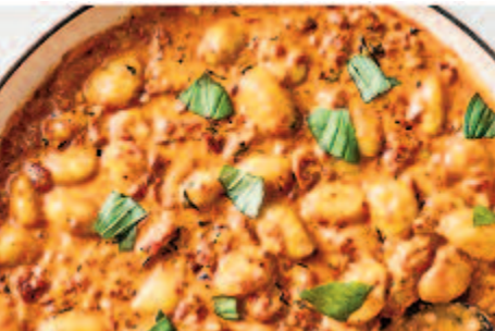
Marry Me Gnocchi

Ingredients: 2 Tbsp. extra-virgin olive oil, divided 3/4 cup finely chopped sun-dried tomatoes in oil