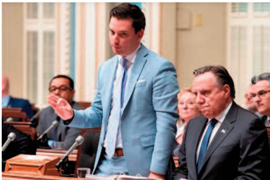
Quebec government House Leader Simon Jolin-Barrette responds to the Opposition during question period Friday, June 14, 2019 at the legislature in Quebec City. Francois Legault, right, looks on.

François Bonnardel - Member for the riding of Granby, in the Eastern Townships. After winning in 2018, he was named transport minister under Legault's first government. In 2022,