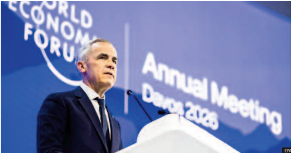
Prime Minister Mark Carney affirmed Canada's commitment to Greenland and urged world leaders to reject economic coercion from "great powers"

When Trump returned to office, he frequently referred to Canada as the "51st state" and threatened to join Canada and the US through "economic force." The US then hit its northern neighbour and major trading partner with steep tariffs.