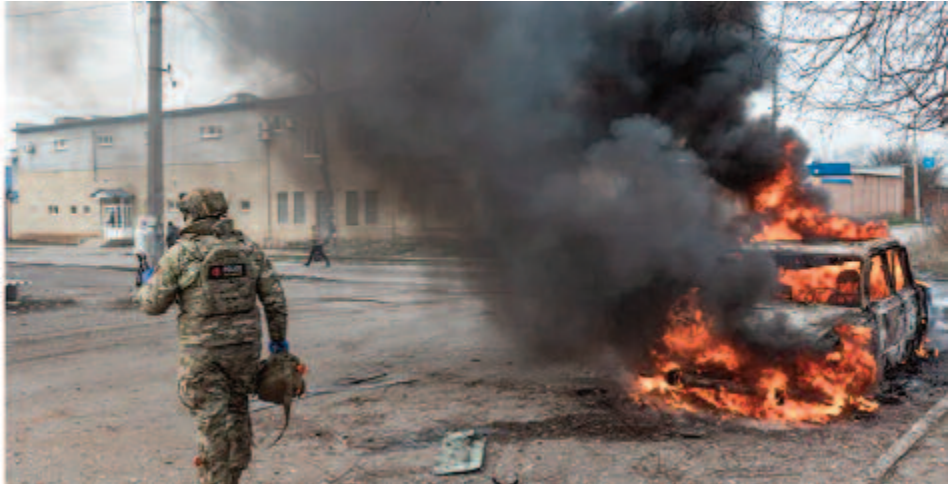
Ukrainian paramedics rush to the scene as smoke and flames rise from a car after being hit by a Russian drone in Druzhkivka, Ukraine, on January 13, 2026

•Internal Governance: In a major leadership reshuffle, Zelenskyy appointed Kyrylo Budanov as the new Head of the Presidential Administration