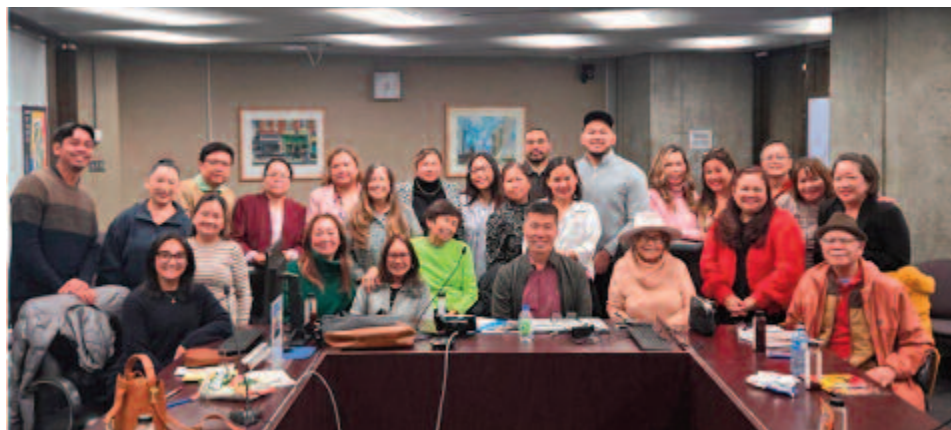
The 2026-2028 PIDC Executive Officers and Board Directors