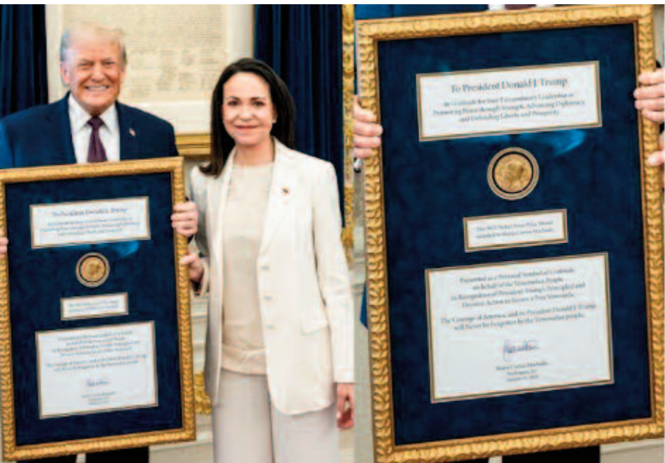
Venezuela's Corina Maria Machado presents Nobel Peace prize to Trump, who calls it a 'Great Honor.' Trump confirmed later on social media that Machado had left the medal for him to keep, and he said it was an honor to meet her. Machado said she had done so "as a recognition for his unique commitment with our freedom." Source: Ahmedabad Mirror