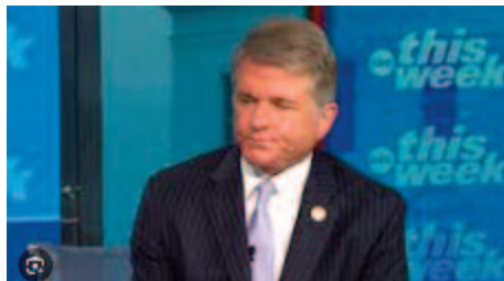
GOP Rep. Michael McCaul (Texas) Week."

"The fact is, the president has full military access to Greenland to protect us from any threat. So if he wants to purchase Greenland, that's one thing," McCaul said during a Sunday appearance on ABC's "This