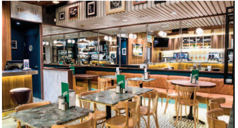
Photo shows the interior look of Café Gentile

Local officials and business community members have welcomed the opening, noting that the arrival of a well-established Montreal brand strengthens the city's commercial landscape and adds to the diversity of