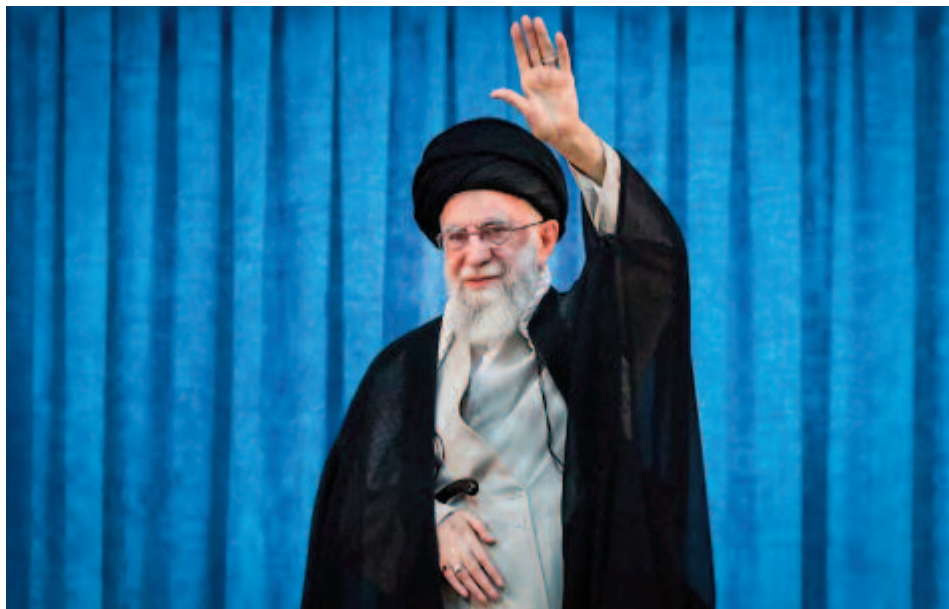
Iran's Supreme Leader Ayatollah Ali Khamenei waves during the 36th anniversary of the death of the leader of Iran's 1979 Islamic Revolution, Ayatollah Ruhollah Khomeini, at Khomeini's shrine in southern Tehran, Iran, June 4, 2025.

Military Involvement: Military convoys and armored vehicles have been deployed in multiple cities. There are reports of snipers targeting civilians and the use of heavy machine