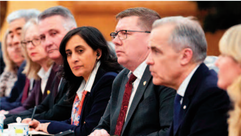
Saskatchewan Premier Scott Moe, third from right, sits beside Prime Minister Mark Carney, as they take part in a bilateral meeting with Chinese Premier Li Qiang at the Great Hall of the People in Beijing, China, on Thursday, Jan. 15, 2026