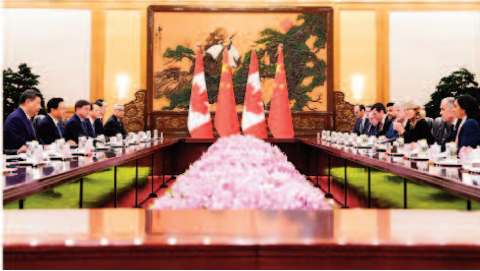
Prime Minister Mark Carney, second from right, and his delegation meets with Chinese President Xi Jinping, far left, and his delegation in the Great Hall of the People in Beijing, China, on Friday, Jan. 16, 2025