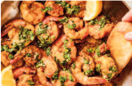
One-Pan Chimichurri Shrimp

Ingredients 2 Tbsp. extra-virgin olive oil 2 (8-oz.) boneless, skinless chicken breasts, cut into 1" pieces Kosher salt 4 garlic cloves, finely chopped 1/4 tsp. crushed red pepper flakes 1 3/4 cups water 3/4 cup heavy cream 8 oz. penne 1 oz. Parmesan, finely grated (about 1/2 cup) 2/3 cup store-bought or homemade pesto Fresh basil, for serving (optional) Directions Step 1 In a medium skillet over medium heat, heat oil. Add chicken; season with 3/4 tsp. salt. Cook, stirring occasionally, until browned and an instant-read thermometer registers 160°, 4 to 5 minutes total. Transfer to a plate. Step 2 In same skillet over medium heat, cook garlic and red pepper flakes, stirring, until fragrant, about 30 seconds. Add water, cream, and 1/2 tsp. salt and bring to a simmer. Add penne and cook, stirring occasionally, until pasta is al dente and liquid is reduced to a sauce that coats the pasta, 8 to 10 minutes. Step 3 Stir in Parmesan and chicken and toss until cheese is melted and chicken is warmed through, about 2 minutes. Remove from heat and fold in pesto; if sauce feels dry, add water, 1 Tbsp. at a time, until a creamy sauce forms. Season with more salt, if needed. Top with basil (if using).