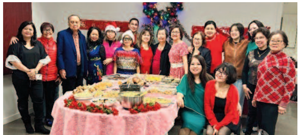
A souvenir photo of Gilmore's Christmas potluck & fellowship party, 12/13/25.

SAAQ Certified MOON DRIVING SCHOOL 5775 Av. Victoria, Suite- 218, Mtl. Complete Course. Price - call for Winter super special. Payable in six installments. One FREE Book. Website- moondrivingschool.com Tel- 514-965-0903. 514-340-1323.