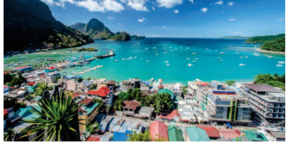
Panoramic view of El Nido Bay from Tataw Cliff

research a potential location with laser focus. Some areas in the Philippines lack sufficient infrastructure. This means power outages and water stoppages can become the norm in some places. You're also going to want to have easy access to healthcare, banks and entertainment.