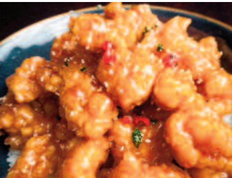
Easy Orange Chicken

4 garlic cloves, finely chopped 1 Tbsp. fresh thyme 1/2 tsp. crushed red pepper flakes 1 (17-oz.) pkg. gnocchi 1 1/4 cups low-sodium chicken or vegetable broth 1/2 cup heavy cream 1/2 cup shredded Parmesan 2 Tbsp. fresh torn basil Directions bookmarks Step 1 In a large skillet over medium heat, heat 1 Tbsp. oil. Add tomatoes and cook, stirring occasionally, until just starting to brown, 2 to 3 minutes. Add garlic, thyme, and red pepper flakes and cook, stirring, until fragrant, 1 to 2 minutes more. Step 2 Push tomato mixture to edges of skillet and pour remaining 1 Tbsp. oil into the center. Add gnocchi and toss to coat in oil. Cook, undisturbed, 2 minutes, then stir in broth and cream to combine with tomato mixture. Bring to a simmer and cook, stirring occasionally, until gnocchi is tender and sauce is slightly reduced, 4 to 5 minutes. Step 3 Stir in Parmesan. Top with basil.