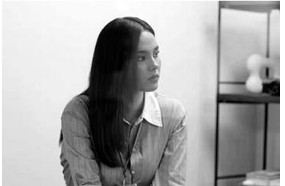
Catriona Gray in a scene from "The Loved One."

"The Loved One" marks Catriona Gray's highly anticipated acting debut, adding to her impressive list of accomplishments. Since her Miss Universe 2018 win, Catriona has consistently proven herself as a multi-talented artist. With the trailer keeping details under wraps, fans are eagerly speculating about how Catriona will portray her character and how she will fit into