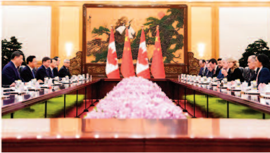
Prime Minister Mark Carney, second from right, and his delegation meets with Chinese President Xi Jinping, far left, and his delegation in the Great Hall of the People in Beijing, China, on Friday, Jan. 16, 2025