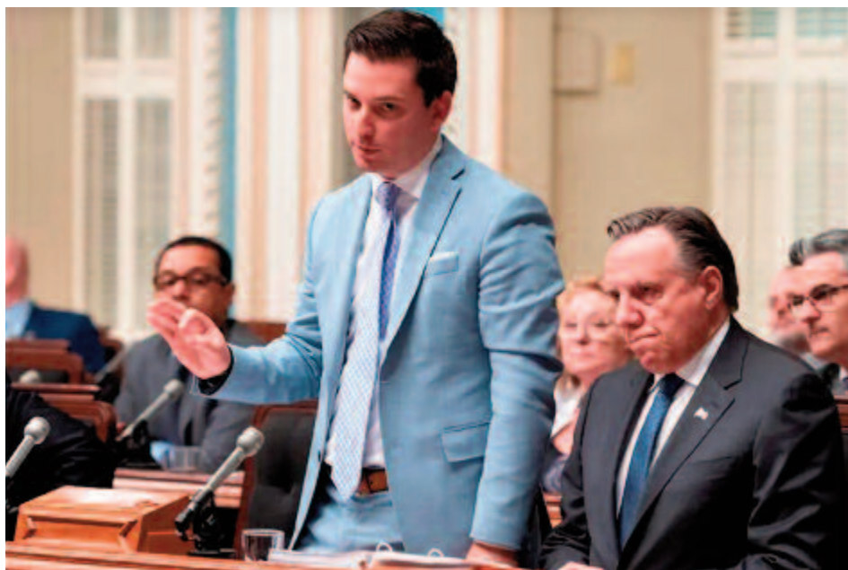
Quebec government House Leader Simon Jolin-Barrette responds to the Opposition during question period Friday, June 14, 2019 at the legislature in Quebec City. Francois Legault, right, looks on.

François Bonnardel - Member for the riding of Granby, in the Eastern Townships. After winning in 2018, he was named transport minister under Legault's first government. In 2022,