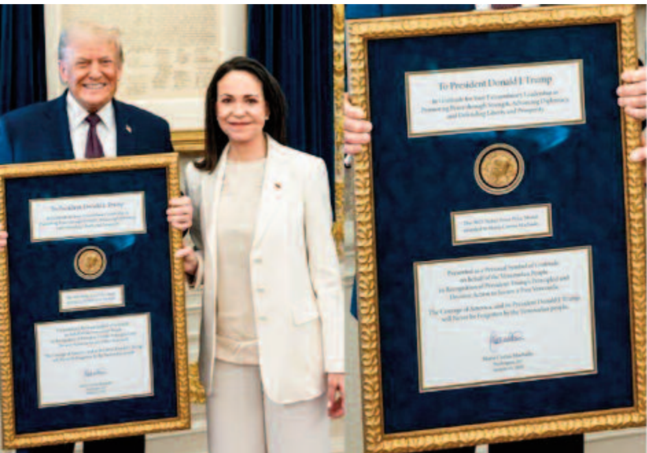
Venezuela's Corina Maria Machado presents Nobel Peace prize to Trump, who calls it a 'Great Honor.' Trump confirmed later on social media that Machado had left the medal for him to keep, and he said it was an honor to meet her. Machado said she had done so "as a recognition for his unique commitment with our freedom."