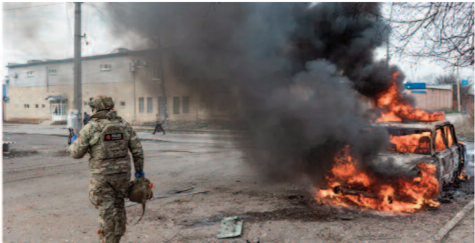
Ukrainian paramedics rush to the scene as smoke and flames rise from a car after being hit by a Russian drone in Druzhkivka, Ukraine, on January 13, 2026

•Internal Governance: In a major leadership reshuffle, Zelenskyy appointed Kyrylo Budanov as the new Head of the Presidential Administration