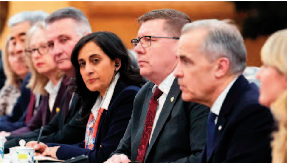
Saskatchewan Premier Scott Moe, third from right, sits beside Prime Minister Mark Carney, as they take part in a bilateral meeting with Chinese Premier Li Qiang at the Great Hall of the People in Beijing, China, on Thursday, Jan. 15, 2026