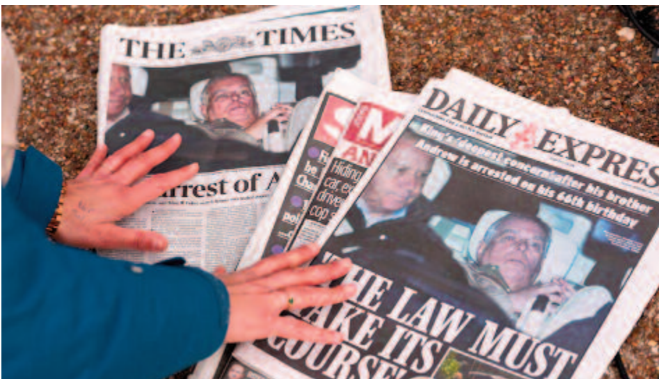
A journalist looks at newspaper front pages in London on Friday, after Andrew Mountbatten-Windsor was arrested and held for hours by British police on suspicion of misconduct in public office related to his links to Jeffrey Epstein.