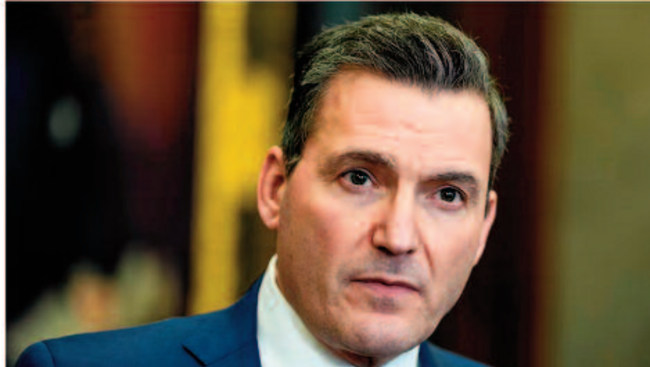
Minister of Artificial Intelligence and Digital Innovation Evan Solomon speaks about interactions with OpenAI regarding the use of ChatGPT by the shooter in the Tumbler Ridge, B.C., mass shooting on Monday.

The Conservative amendments create a mandatory 30-day public consultation prior to making