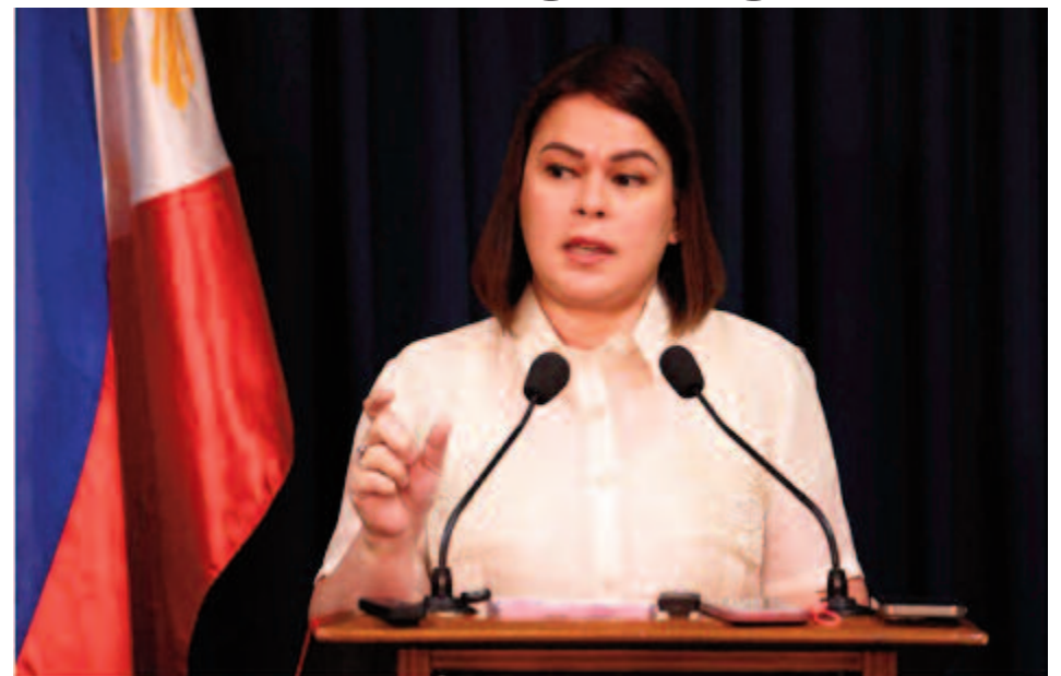
The referral triggered the one-year bar period, which means that the next impeachment proceedings against VP Duterte can only be initiated a year after.

MANILA, Philippines - Ang impeachment proceedings laban kay Vice President Sara Duterte ay inumpisahan ng komite ng House of Representatives nitong Lunes, 23 Pebrero na tungkol sa apat na reklamo (raps) laban sa kanya.