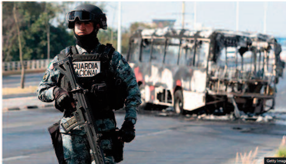
A member of Mexico's National Guard stands near the charred wreckage of a bus that appears to have been set on fire by organised crime groups in Jalisco state on Sunday

At least six of El Mencho's security guards were also killed in the operation, while three members of the