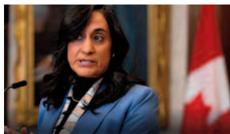
During a press conference Monday to address the security situation in Mexico where Puerto Vallarta, in the state of Jalisco, is under a shelter in place order, Minister of Foreign Affairs Anita Anand said that as of 7 a.m. this morning, 26,305 Canadians in Mexico registered with Global Affairs Canada, but the actual number is likely much higher.

GAC notes there are shelter-in-place orders in Jalisco (including