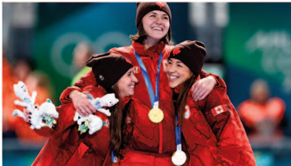
Canada's speed skating "Madames" thrilled us with another gold-medal victory in the women's team pursuit.

Sidney Crosby, Canada outshot the U.S. 42-28 and had several golden opportunities to pot the go-ahead goal in the third period after American Matt Boldy opened the scoring in the first and Cale Makar tied it late in the second. But U.S. goalie Connor Hellebuyck absolutely robbed Devon Toews in front of a wide-open net with a desperate paddle save and, later,