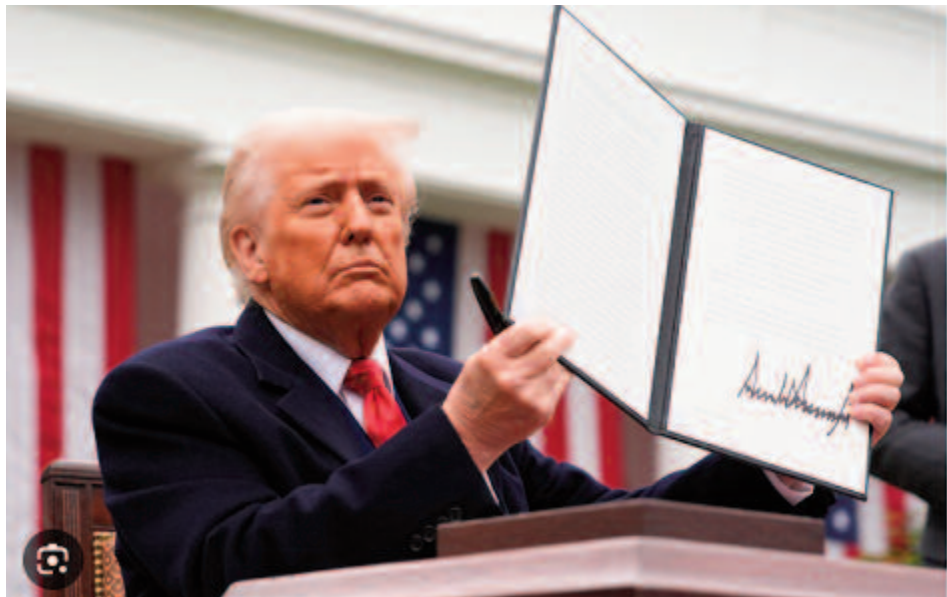
U.S. President Donald Trump holds a signed executive order on tariffs, in the Rose Garden at the White House in Washington, D.C., U.S.

On February 20, 2026, the U.S. Supreme Court delivered a major rebuke to the Trump administration by striking down its broad global tariffs in a 6-3 decision. The ruling effectively invalidated the "reciprocal" tariffs and "fentanyl" duties that had been a cornerstone of the president's second-term economic agenda.