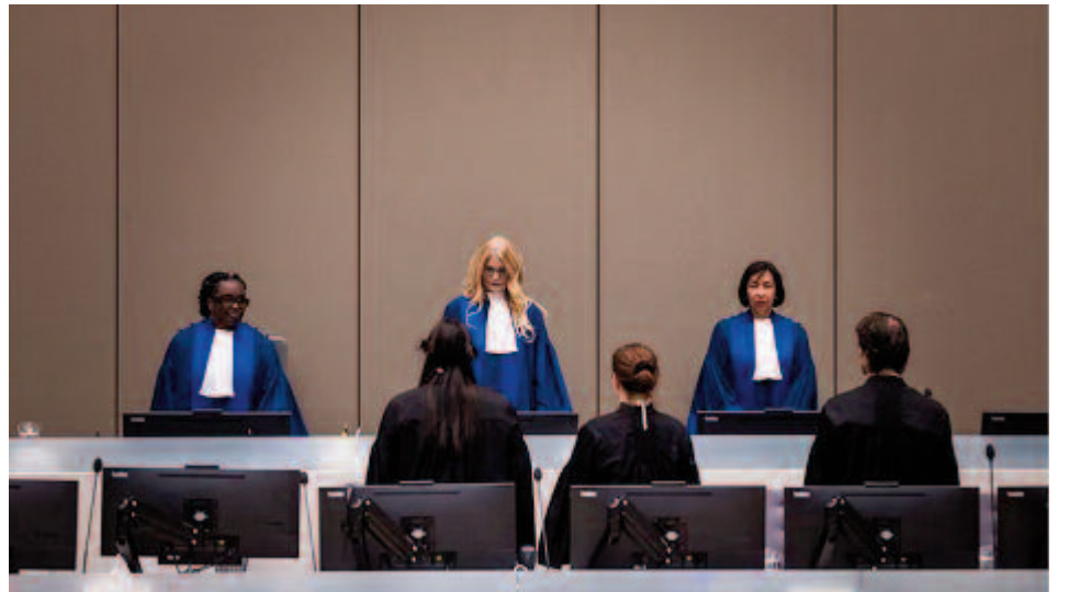
The International Criminal Court Pre-Trial Chamber I judges. The International Criminal Court Pre-Trial Chamber I on Monday (Feb. 23, 2026) concluded the first day of the pre-trial or confirmation of charges hearings into the crimes against humanity case of former President Rodrigo Duterte. The four-day proceedings will determine whether Duterte's case will be brought to a full trial. published Feb. 24, 2026.