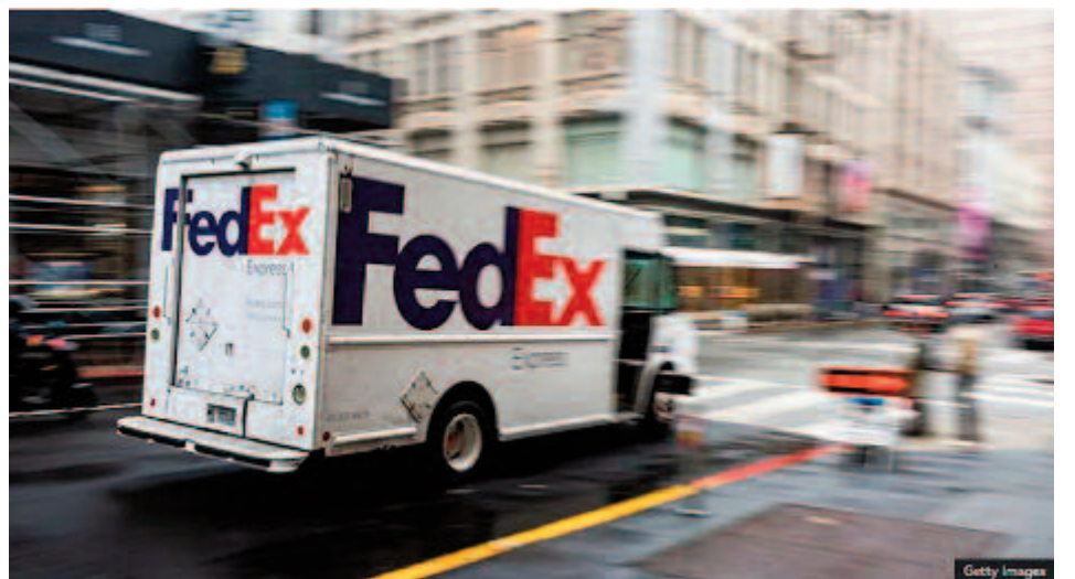
The global transportation and postal company FedEx has filed a lawsuit for a "full refund" for US President Donald Trump's emergency tariffs. FedEx did not say in its suit what value of a refund it was seeking. It named US Customs and Border Protection (CBP), the agency's commissioner Rodney Scott, and the US as defendants.