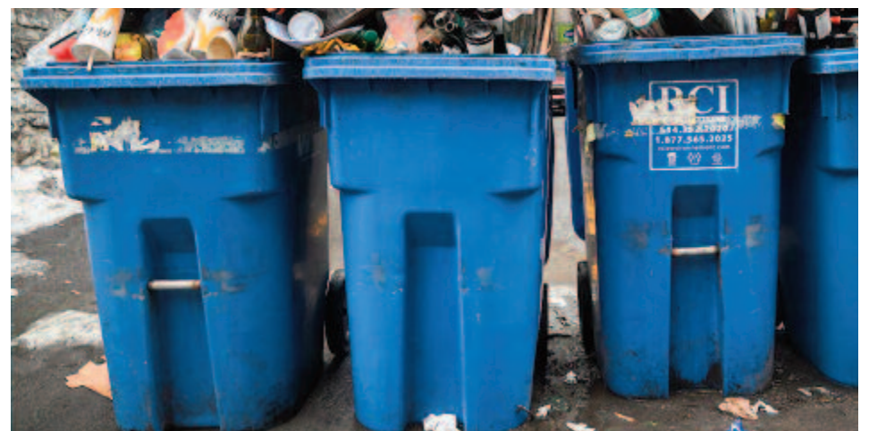
Overflowing recycling bins are shown in Montreal, Wednesday, Jan. 1, 2025, on the day when new recycling rules are implemented by the province.

Eight associations joined forces to make this announcement on Monday. They include the Conseil de la transformation alimentaire du Québec (CTAQ), the Retail Council of Canada (RCC) and the Union des producteurs