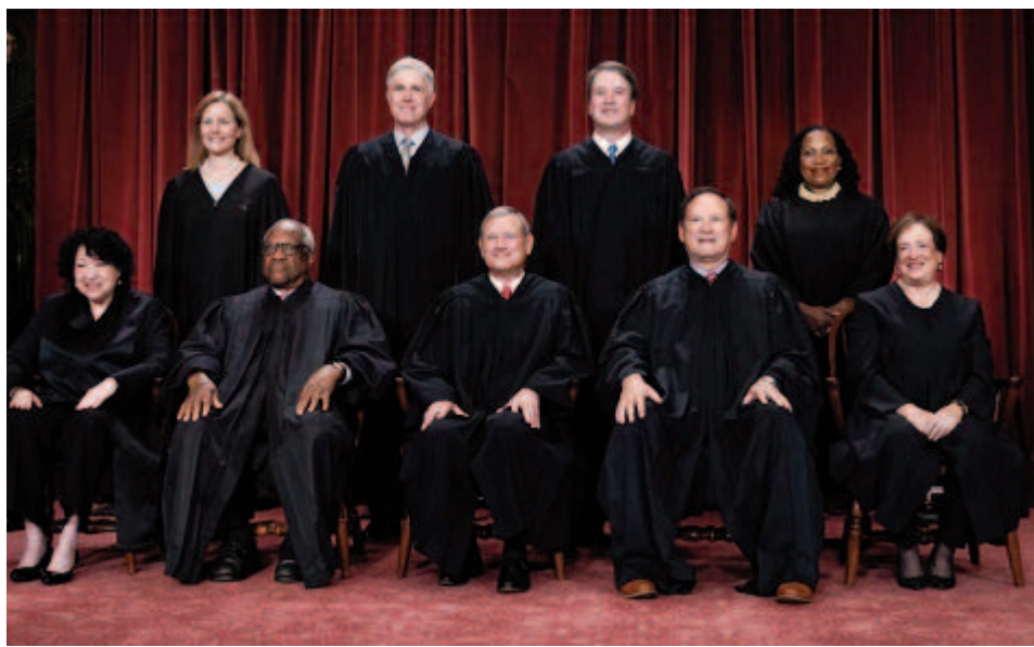
Members of the U.S. Supreme Court sit for a new group portrait following the addition of Justice Ketanji Brown Jackson, at the court building in Washington, Oct. 7, 2022. On Feb. 20, 2026, the court ruled 6-3 to strike down President Donald Trump's broad tariff policies, ruling that they were not authorized by the federal statute that he cited for them.

Justices Thomas, Kavanaugh, and Alito dissented, arguing that the