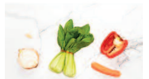
Vegetables for Stir Fry

LEFTOVERS will keep for 3 to 4 days, however, the sauce does get thinner when reheated (this is what happens with cornflour thickened sauces). If intentionally making ahead (fridge or freezing), substitute cornflour with arrowroot which won't go thin when reheated.