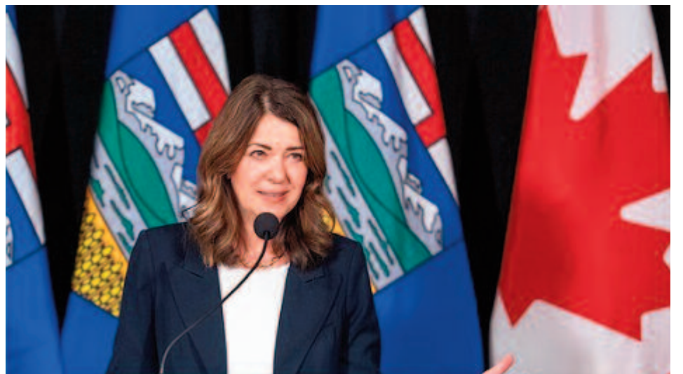
Premier Danielle Smith speaks at a news conference in Edmonton on Nov. 27, 2025, after Alberta and the federal government signed a bilateral energy agreement. She announced that Alberta will release the budget on February 26, 2026 as well as a referendum on immigration in October 2026.