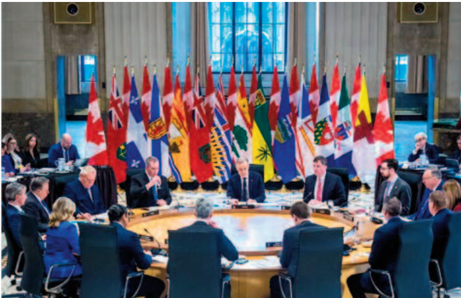
Mark Carney has convened a meeting with Canada's premiers in Ottawa this week (Jan.30, 2026) to discuss the economy, affordability, and trade ahead of upcoming CUSMA discussions. At a moment of renewed trade pressure, Canadians expect governments to work together and deliver results — and that's exactly what we're focused on. Source: FB post of MP Anthony Housefather