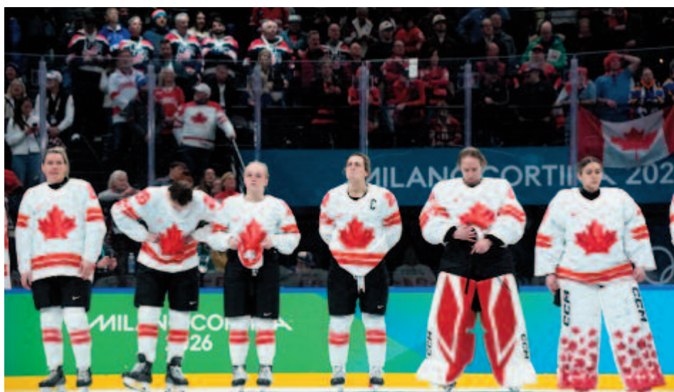
Team Canada reacts after losing to the United States during overtime of the women's gold medal hockey game at the 2026 Winter Olympics, in Milan, Thursday, Feb. 19, 2026.

(February 22, 2026) - The XXV Winter Olympic Games, held from February 6 to February 22, 2026, concluded today in Italy. Norway finished at the top of the medal table for the fourth consecutive Winter Olympics, setting a new record with 18 gold medals and 41 total medals. The