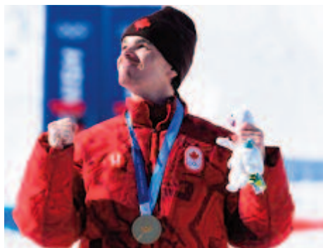
Canada's Mikael Kingsbury celebrates his gold medal in the men's freestyle skiing dual moguls at the 2026 Winter Olympics, in Livigno, Italy, Sunday, Feb. 15, 2026.

Sidney Crosby, Canada outshot the U.S. 42-28 and had several golden opportunities to pot the go-ahead goal in the third period after American Matt Boldy opened the scoring in the first and Cale Makar tied it late in the second. But U.S. goalie Connor Hellebuyck absolutely robbed Devon Toews in front of a wide-open net with a desperate paddle save and, later,