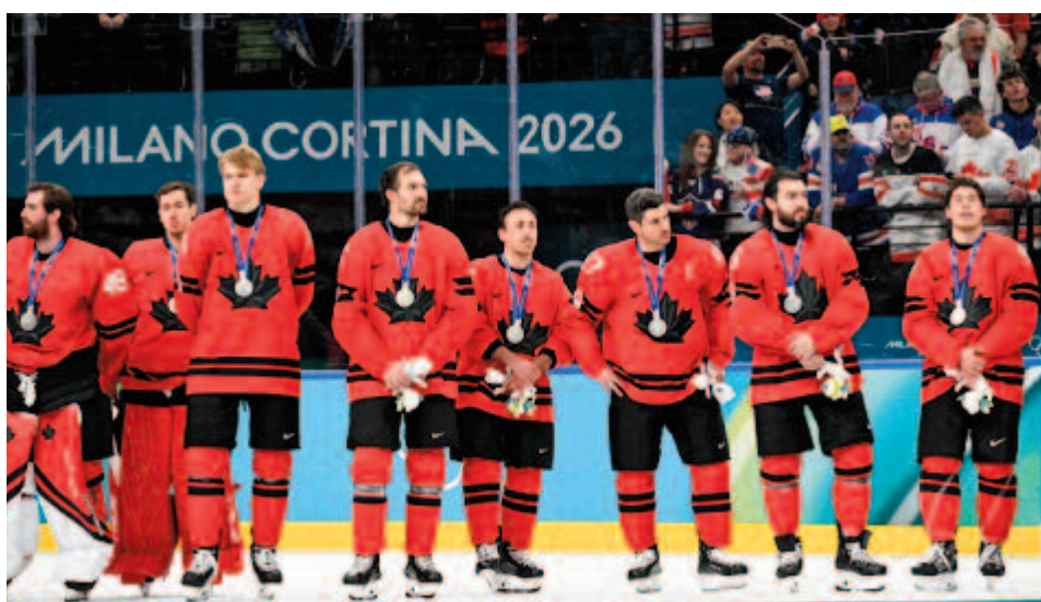
Players with team Canada react after losing to the United States in the men's ice hockey gold medal game at the 2026 Winter Olympics, in Milan, Italy, Sunday, Feb. 22, 2026.

The 2026 Milano Cortina Winter Olympics concluded with a