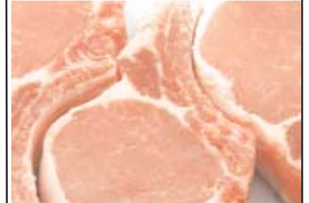
Pork Chops $2.49 lb.