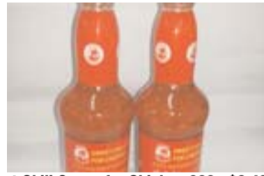
Sweet Chili Sauce for Chicken 800g $2.49 ea.