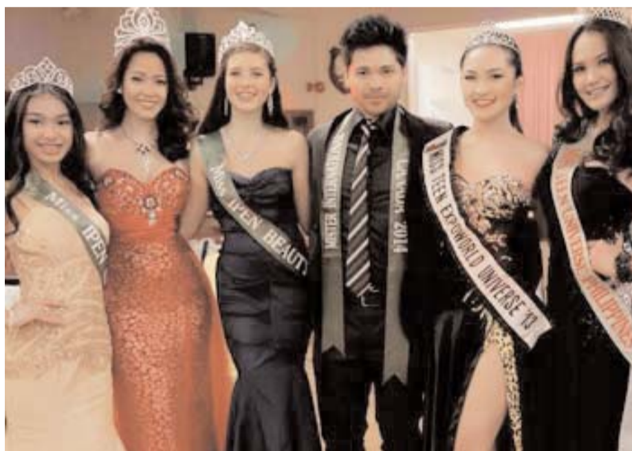
Beauty queens posing with the only male title holder, the reigning Mr. International