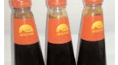
Panda Oyster Sauce 510g $1.99 bottle