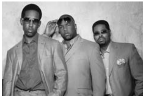
Boyz II Men

The immensely talented group is composed of baritone Nathan Morris with tenors Shawn Stockman and Wanya Morris.