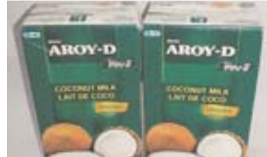
Aroy-D Coconut Milk 500 mL $1.99 box