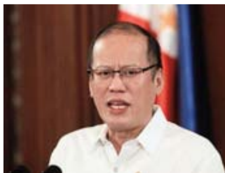
President Benigno Aquino III

Aquino has promised the largest Muslim rebel group in the predominantly Christian country autonomy in the southern region known as Bangsamoro in exchange for peace.