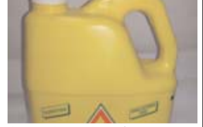
Spectra Canola Oil 4L $4.99 each