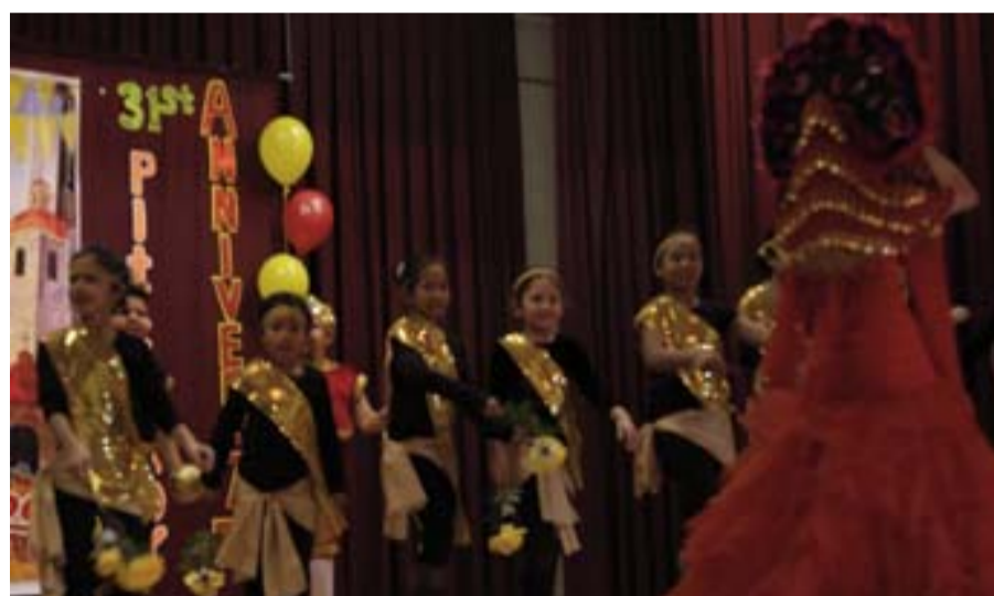
Youth Sinulog dancers