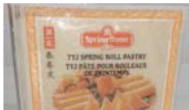
TYJ Spring Roll 8.5" $1.29 ea.