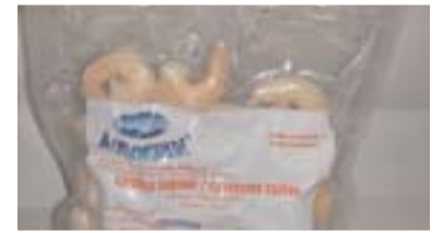
Aquaworld Cooked Shrimp 200g $3.49 ea