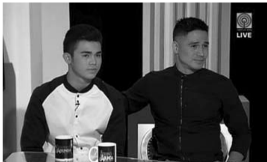
Piolo Pascual (right) with son Inigo

Piolo Pascual critiqued his son Inigo's acting in the just-released film "Crazy Beautiful You," where the younger Pascual co-stars with teen sensations Daniel Padilla and Kathryn Bernardo.