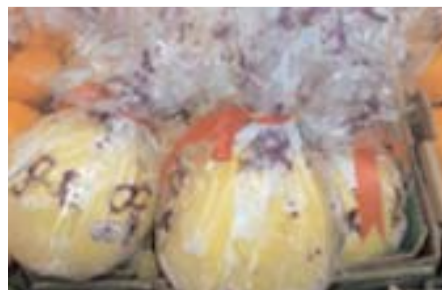
Sweet Pomelo $3.49 ea.