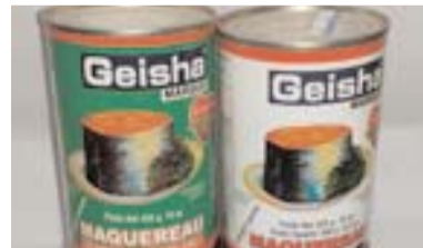
Geisha Mackerel Fish $2.49 can