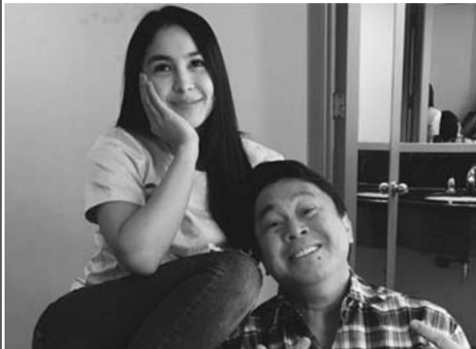
A photo posted by Julia Barretto (@juliabarretto) on Feb 25, 2015

It appears that teen actress Julia Barretto and father, comedian Dennis Padilla, have patched things up.