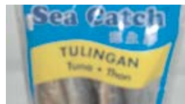
Seacatch Tuna $2.99 pack