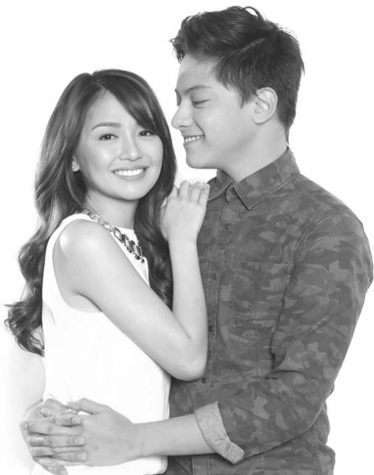
Kathryn Bernardo and Daniel Padilla

The power of social media can make or break relations, from mere friendships to those within professions. Over the years, despite its reach and popularity, some people still don't seem to realize that every click of that 'Tweet' button brings their issues out in the open. Celebrities are not spared from this misconception. Then again, maybe that's the whole idea — that every 140-character message is really meant for public consumption, and netizens, a part of a new public forum.