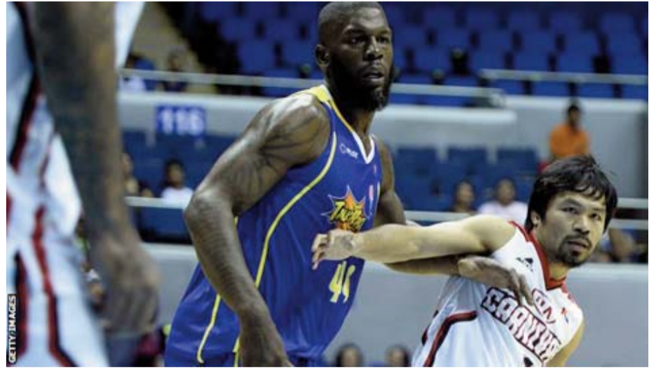
Manny Pacquiao showing his basketball moves against a big player

Pacquiao, 36, faces unbeaten Mayweather in Las Vegas on 2 May in what is set to be the richest bout in boxing history.