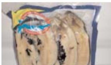
Marinated Milk Fish $4.99 each