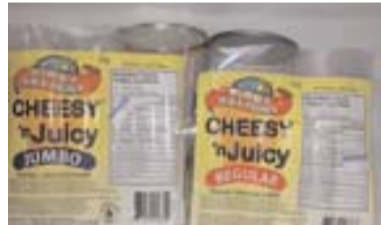
Hot Dog $4.49 each