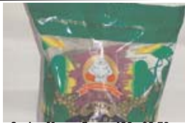
Sunlee Mongo Beans 400g $0.79 ea.