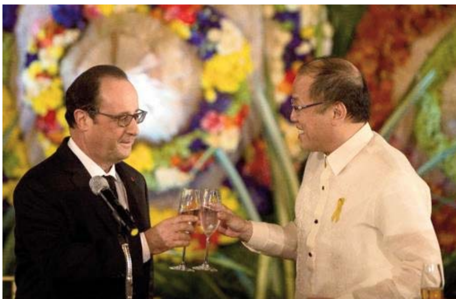
Philippine President Benigno Aquino (R) shares a toast with French President Francois Hollande (L) during a state dinner at the Malacanang Palace in Manila on February 26, 2015

French President Francois Hollande and Philippine leader Benigno Aquino appealed Thursday for urgent global action on climate change, seeking to On the first day of Hollande's visit to the Philippines, the leaders offered a show of unity they said could serve as a model for rich and poor nations who have long been divided over how to tackle climate change.