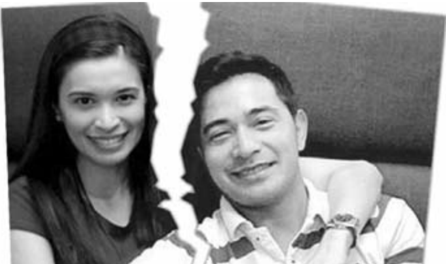
Sunshine Cruz and estranged husband Cesar Montano

Sunshine Cruz has accused her estranged husband Cesar Montano of committing a scandalous act in front of their daughters (whose names we are withholding to protect their privacy). Even before she filed a case against Cesar in court, Sunshine has reportedly been feeding the tabloids similar stories.