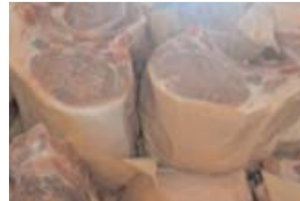
Pork Bone $0.99 lb