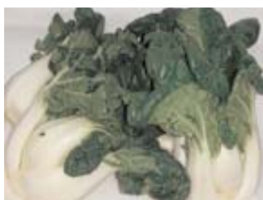
Baby Choy Sum $0.89 lb