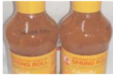
Sweet Chili Sauce for Spring Roll 800g $2.49 ea.