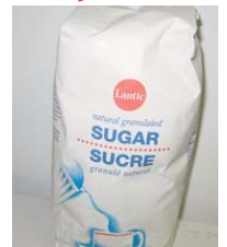
White Sugar, 2 kgs $2.99