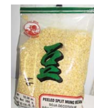
Split mung bean 79¢