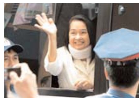
See Page 3 - Arroyo pleads not guilty to electoral fraud