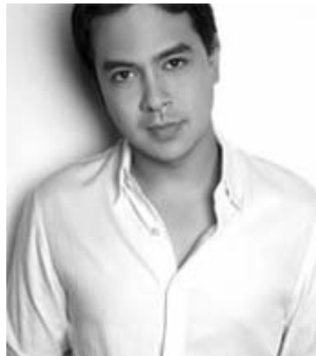
John Lloyd Cruz says he's perfectly happy right now

While other celebrities seem to brush off fame in order to remain grounded, John Lloyd Cruz welcomes the concept of popularity in a relatively fresh perspective.