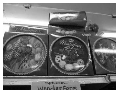
Wonderfarm assorted biscuits 454g - $2.99 each