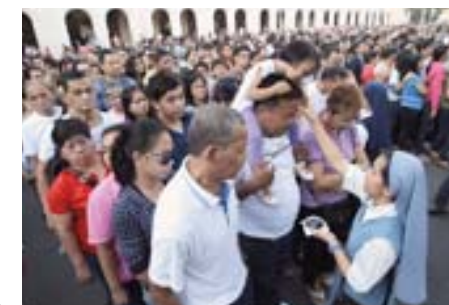
See Page 3 - Ash Wednesday Ritual