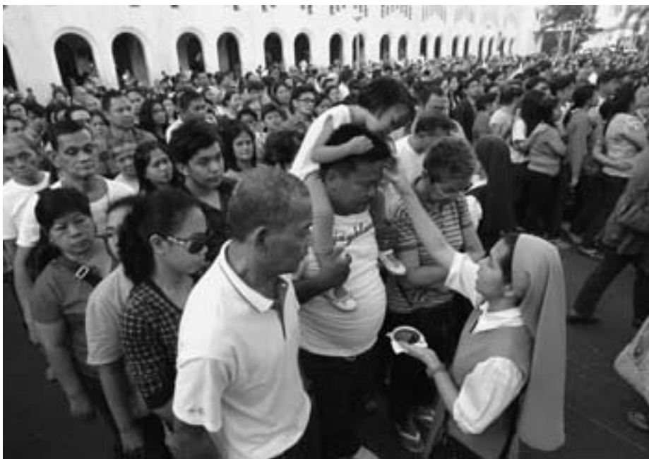
PHOTO - A Roman Catholic nun uses ash to mark a cross on the forehead of a believer during Ash Wednesday in front of a Catholic church in Paranaque city Feb. 22, 2012. Ash Wednesday marks the beginning of the season of Lent. It is a season of penance, reflection and fasting which prepares believers for Jesus Christ's resurrection on Easter Sunday.

MANILA, FEBRUARY 23, 2012 (ABS-CBN) Millions of Roman Catholic Filipinos trooped to churches today for Ash Wednesday, signalling the start of the Lenten season.