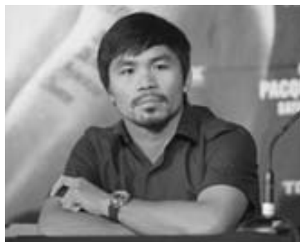
'Faith' changed Pacman for the better

Eight-division world champion Manny Pacquiao is pondering retiring next year.