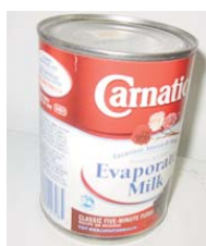
Carnation Milk $1.49