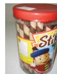
Stiko - $1.50