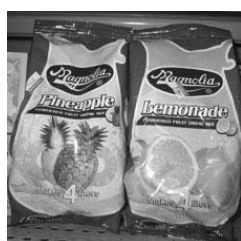
Magnolia Powdered Drink All flavors - $1.99 pack

Sale Prices Valid from February 25 to March 5, 2012