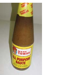
Mang Tomas 79¢