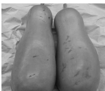
Opo - $1.29 lb