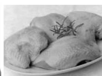
Chicken breast - $3.29 lb