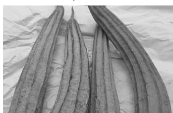
Chinese Okra - $1.29 lb