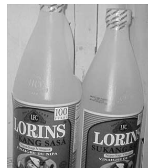
Lorins Vinegar 1L 99¢ bottle