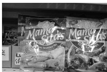
Mama Sita mix All flavors - 3/$2.49, 79¢ each