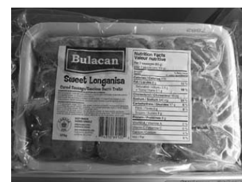
Bulacan sweet & hot longganisa - $1.99 each