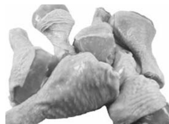
Chicken drumsticks - $1.09 lb