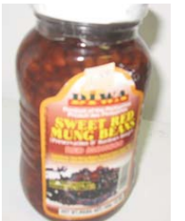
Diwa Sweet Mongo $1.49