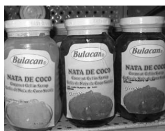
Bulacan coconut gel all flavors 2/$3.00