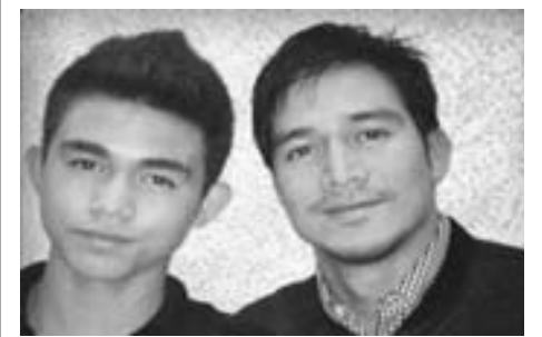
Iñigo says he is closer than ever to his dad, Piolo

Iñigo Pascual, son of actor Piolo Pascual, admitted that he got hurt over insinuations hurled against his father amid the latter's highly publicized breakup with actress KC Concepcion last year.