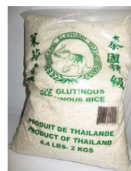
Glutinous Rice 2 kgs $3.99