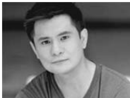
Ogie Alcasid revealed he let go off his pride just so Regine Velasquez can get over her postpartum depression