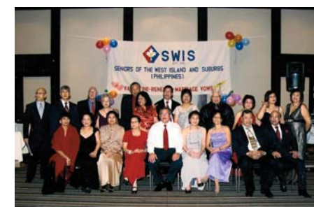
SWIS (Seniors of the West Island) is born By Fely Rosales-Carino - See Page 8