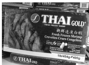
Thai Gold, head on, 70-80 2/$8.49