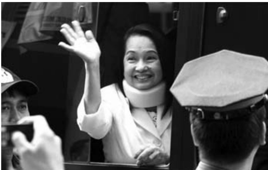
Former president Gloria Macapagal-Arroyo leaves the Pasay City court escorted by policemen after attending her arraignment on Thursday and pleading not guilty to charges of electoral fraud.