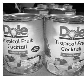
Dole fruit cocktail 3062 g - $5.99 can