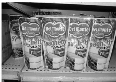
Del Monte Spaghetti Sauce 250 g - 99¢, 560g - $1.99