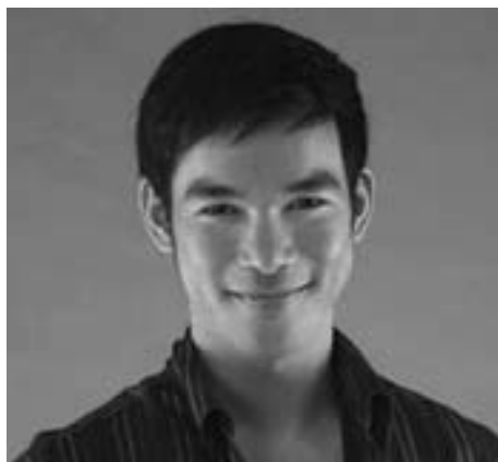
Mark Bautista: Immune to intrigues

Singer-actor Mark Bautista has already put behind him the malicious rumors that dragged him in the middle of the high-profile breakup of his good friend Piolo Pascual and KC Concepcion last year.