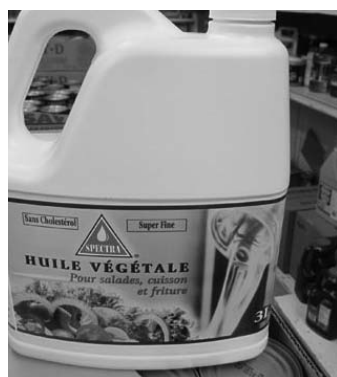
Spectra vegetable oil 3L - $4.99 each