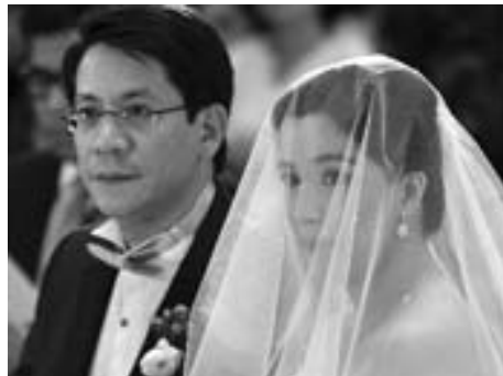
Newlyweds Roman Romulo and Shalani Soledad

"I wouldn't know the schedule of the President over the weekend..." he was quoted to have said.