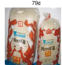
Vermicelli 500g - $1.49, 250g 79¢