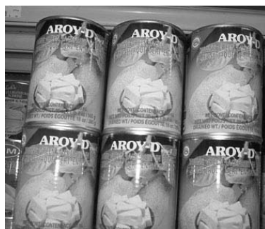
Arroy-D green jackfruit 99¢