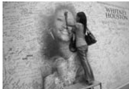
A fan of US pop diva Whitney Houston signs a giant mural with a portrait of her idol displayed at a mall in Manila

"Gusto ko pong maging special siya talaga. Pero siyempre, talagang gusto kong gumawa ng something para po sa kanya. Maybe magiging emotional talaga. Ang hirap pa rin tanggapin kasi parang nawalan ka ng kamag-anak. I mean na-discover po kasi ako kasi siyempre dahil kinanta ko 'yung mga songs niya," Charice said in the same ABS-CBN