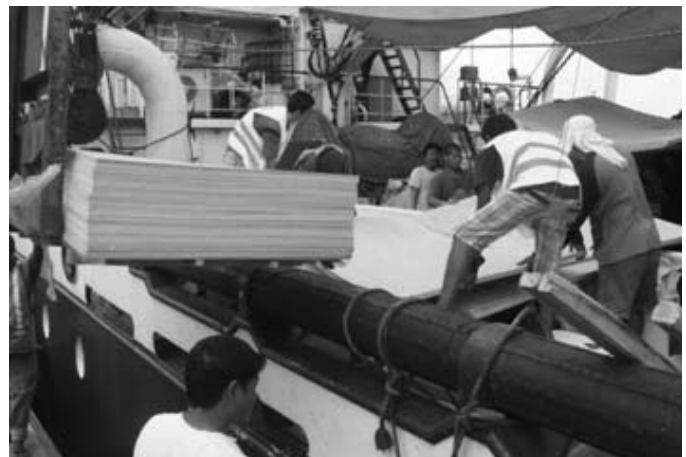
Constructing the fishermen's boats as part of the rehabilitation project

Watch the second episode of Mabuhay Montreal TV Friday, December 27, 2013 at 7 P.M. on Videotron Channels 16, 616 HD, Bell Fibe 216/1216HD