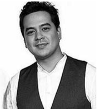
Anne Curtis (left) and John Lloyd Cruz (file photos)

Baranda has not commented on eyewitness accounts that Curtis told her, "I can buy you, your friends and this club!"