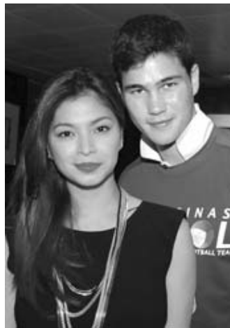
Angel Locsin & Phil Younghusband