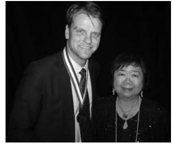
A souvenir photo with Canadian Minister of Immigration & Citizenship during the gala night, December 7, 2013.

Chinese community newspaper that informed the government authorities about racism that a group of Chinese fishermen experienced, leading to legislative measures to correct the situation. She said that examples of reporting like this can usually be carried only in local community newspapers which have a positive impact on making a difference in our society. ■