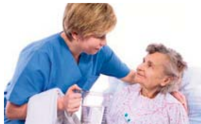
PAB/PSW Nursing Aide