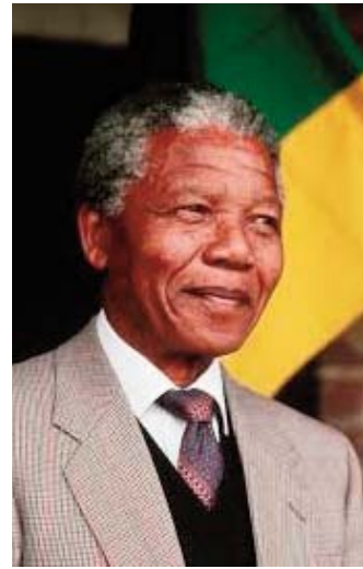
Nelson Mandela July 18, 1918-December 5, 2013