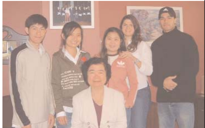
Foreign students from Cambodia, Venezuela and Tunisia taking English and French as a second language.

Education raises the bar but lowers the barriers to a rewarding career.