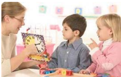
Early Childhood Education Assistant