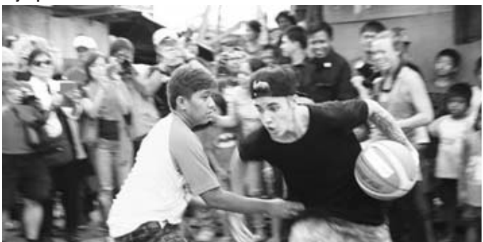
Canadian pop megastar Justin Bieber plays basketball with a young survivor of super typhoon "Yolanda" in Palo, Leyte, on Dec. 10. He described Filipinos as "the strongest people I know" and his experience with the kids as "true happiness".

grandchildren over and over again about that amazing day, way back in 2013, when they swirled the spheroid for a few beautiful minutes with this hotshot star from Hollywood!