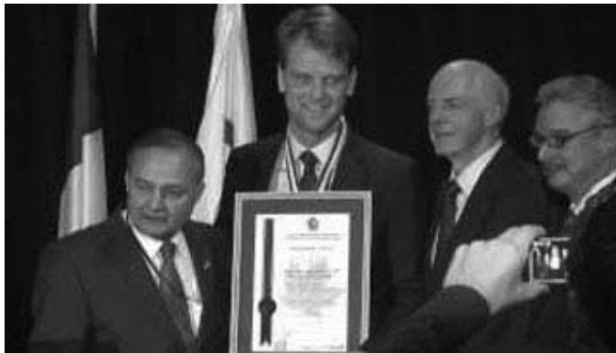
Canadian Immigration Minister Chris Alexander receiving a certificate of appreciation