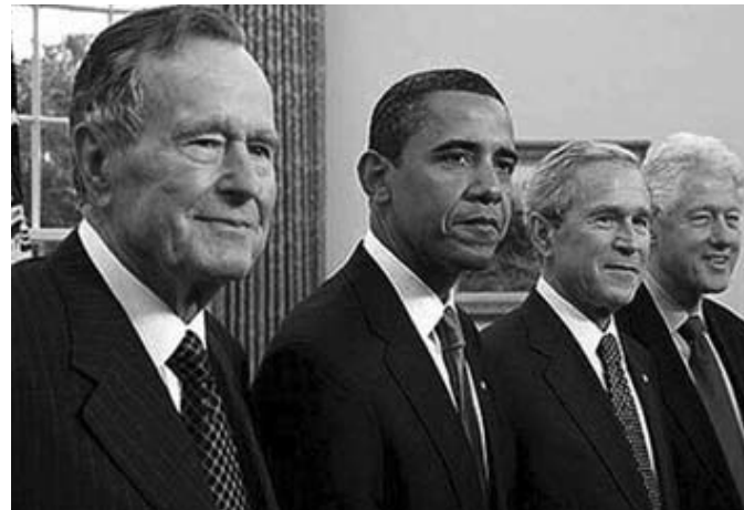
A delegation of U.S. presidents, George Bush, Sr., Barack Obama, George Bush, and Bill Clinton at the memorial service for Nelson Mandela, December 15, 2013,

"I'm not sure that I would say that I enjoyed being here – for me it was a