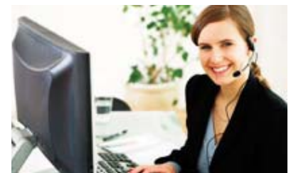
Office Assistant or Receptionist

Are you planning to upgrade your skills? find a new job? change your career? Find out how you can achieve your personal and professional goals. Call us at 514-485-7861 for information or registration. Classes will start in January 2014.