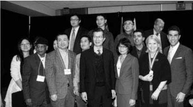
Olivia Chow, (4th from the right) the widow of Jack Layton, NDP leader who passed away on Aug. 22, 2011, is flanked by several ethnic press members.