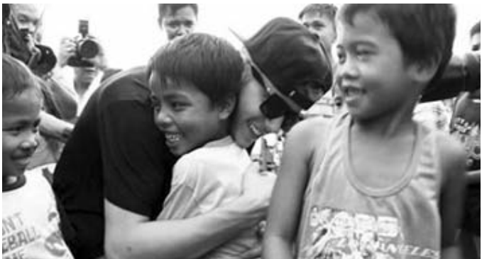
BIEBER FEVER International pop singing sensation Justin Bieber hugs a young survivor of Supertyphoon "Yolanda" during his visit to an evacuation center in Palo, Leyte province.

Bieber's most inspired move was to play basketball with some startled Tacloban youths—who will probably henceforth tell their great-