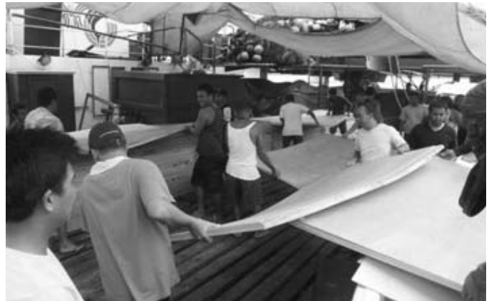
Photo shows men carrying building materials for the fishermen's boats

fisherfolk families in severely hit provinces of Regions 6,7,8, and 4B. Twenty-one provinces with fishing communities were severely devastated by typhoon Yolanda – affecting an estimated 146,748 fishermen. 10,000 fishing boats would save the livelihood of 20,000 fishermen families. To build a boat with motor engine would cost approximately P15T and P6T without engine. The selection of beneficiaries will be done in consultation with the local government units, based on their list of