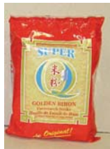
Super Q bihon/palabok 99¢/package