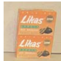
Likas Papaya soap $2.99 tax incl.