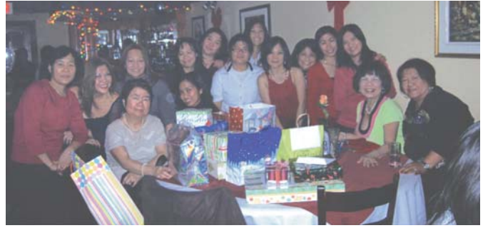
Gilmore College International annual students and teaches Christmas Party held at the Fireside Restaurant, on Van Horne Ave., December 13, 2009