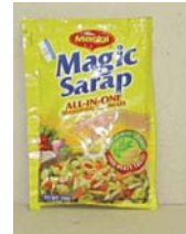
Maggi Magic Sarap 99¢ each