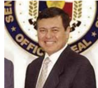
Sen. Manny Villar

pwede ba akong magpadala ng regalong pera online saan man sa mundo?