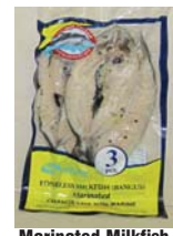
Marinated Milkfish 1, 2, 3 pcs $3.99