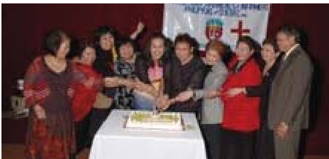
Birthday celebrants of the FNAQ cutting their cake together at the Ruby Rouge Restaurant during their Christmas Party, December 12, 2009.