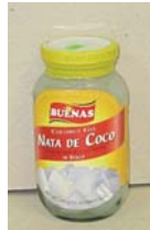
Buenas coconut gel $1.39 jar