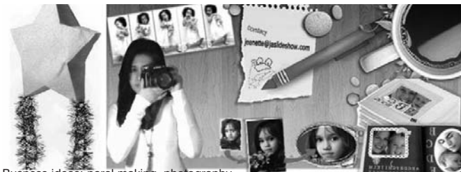
Business ideas: parol making, photography,

Mosaic Tile Creations : Creating home decoration items featuring mosaic tile designs is an exceptional business venture to set in motion. Not only can this enterprise be started and run from a home