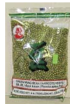
Mango beans 3/$1.99