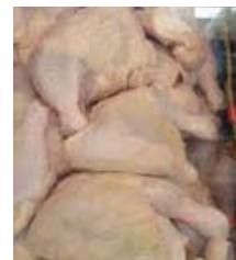
Chicken legs $1.09/lb