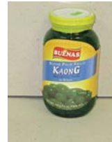
Buenas Kaong $1.39 jar