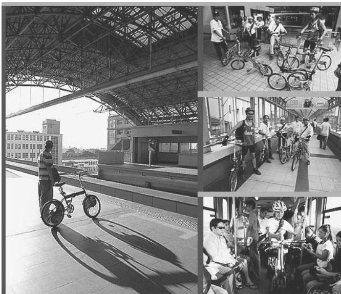
Cyclists are enthused that the LRT Yellow and Purple lines have gone "green" by allowing them to hop onto the trains with their folding bikes in tow.

Businessman-cyclist Pio Fortuno also waxes enthusiasm about the new opportunity. "If we can convince one