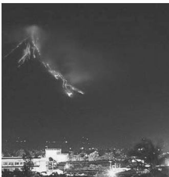
Lava continues to flow down the slopes of the Mayon volcano, seen from Legazpi city in Albay province