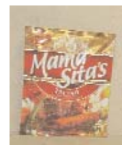
Mama Sita's mix all kinds -3/$1.99