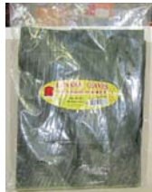
Banana leaves 454 g - 89¢