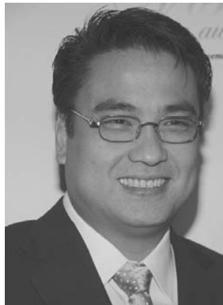
Senator Ramon Revilla

Sen. Ramon "Bong" Revilla Jr. clarified that there's nothing personal about his determination to make Hayden Kho Jr. face the consequences of his sex video scandal.