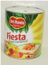
Del Monte Fruit Cocktail $5.99 can

Sale Prices valid from Dec. 18, 2009 -Jan. 08, 2010