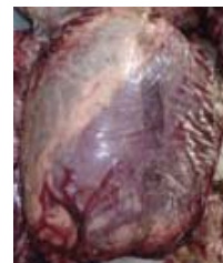
Beef Point Surlon $1.79/lb