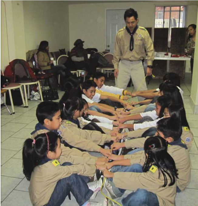
Cubs and Scouts of Laging Handa 0592 play the game of the unity rope - they have to be in synchronized move to stand up together holding on to the rope.