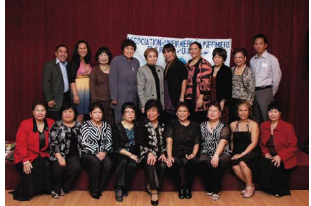
The executive board of the FNAQ during their Christmas Party at Ruby Rouge, Dec. 12, 2009