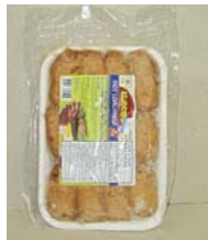
Ilocos Longanisa Hot or Sweet - 2/$3.00