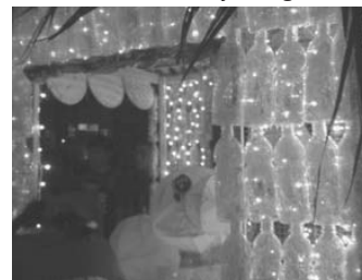
Recycled Art. This gingerbread house is made up of plastic bottles

activist flair until the 1960s, when it became an alternative venue for protests. The lanterns are not just lanterns, they're statements. This is what makes the UP Lantern Parade different from other holiday spectacles—it's committed to injecting social