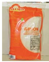
Diwa rice stick 454 g - $1.99