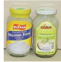
Macapuno string Buenas, Diwa - $1.69 ea.