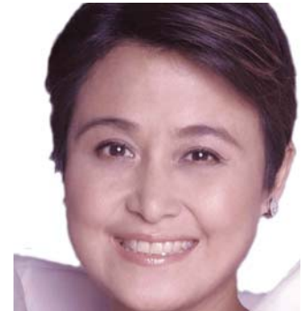
Sen. Jamby Madrigal (Independent)