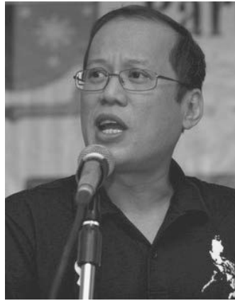
Senator Benigno 'Noy' Aquino speaks during a Liberal Party (LP) joint meeting with the LP National Executive Council and National Directorate in Manila last month.