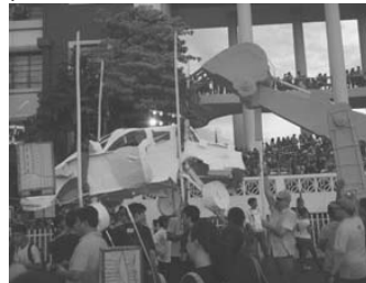
In your face. Despite the festive vibe, the UP community retains its activist flair with startling creations.

renditions of the newsmakers of 2009, such as boxer Manny Pacquiao, were also incorporated in the floats' design. Even the ghastly symbol of the Ampatuan massacre was highlighted in the parade. Indeed, a number of