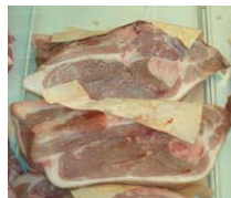
Pork Picnic 79¢/lb