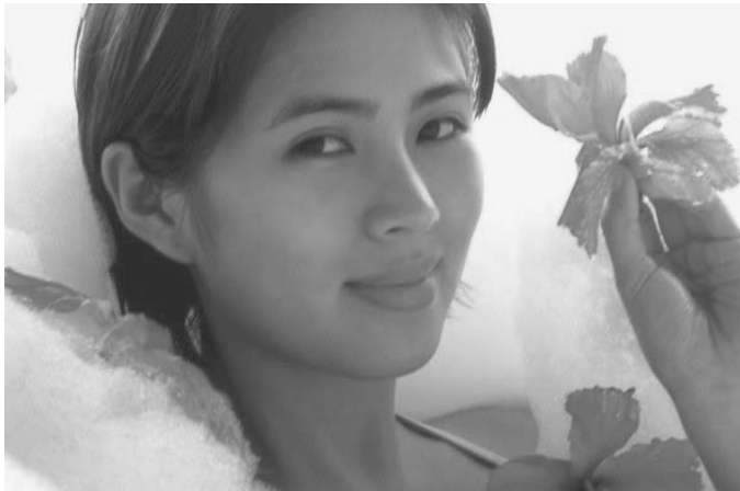
Krista Ranillo in an exclusive interview with Korina Sanchez

The elusive Krista Ranillo has sat down with "Rated K" host Korina Sanchez, but her first television interview since returning home did not discuss her rumored affair with boxing icon Manny Pacquiao.