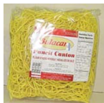
Bulacan pancit canton 227 g - 0.99 454 g - $1.99