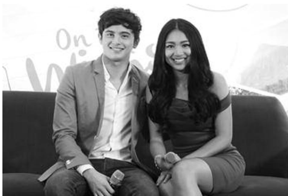
James Reid with Nadine Lustre

James Reid said that he is glad to be doing a movie again after starring in the hit Kapamilya teleserye On the Wings of Love . The actor is set to topbill the upcoming movie This Time opposite his girlfriend Nadine Lustre.