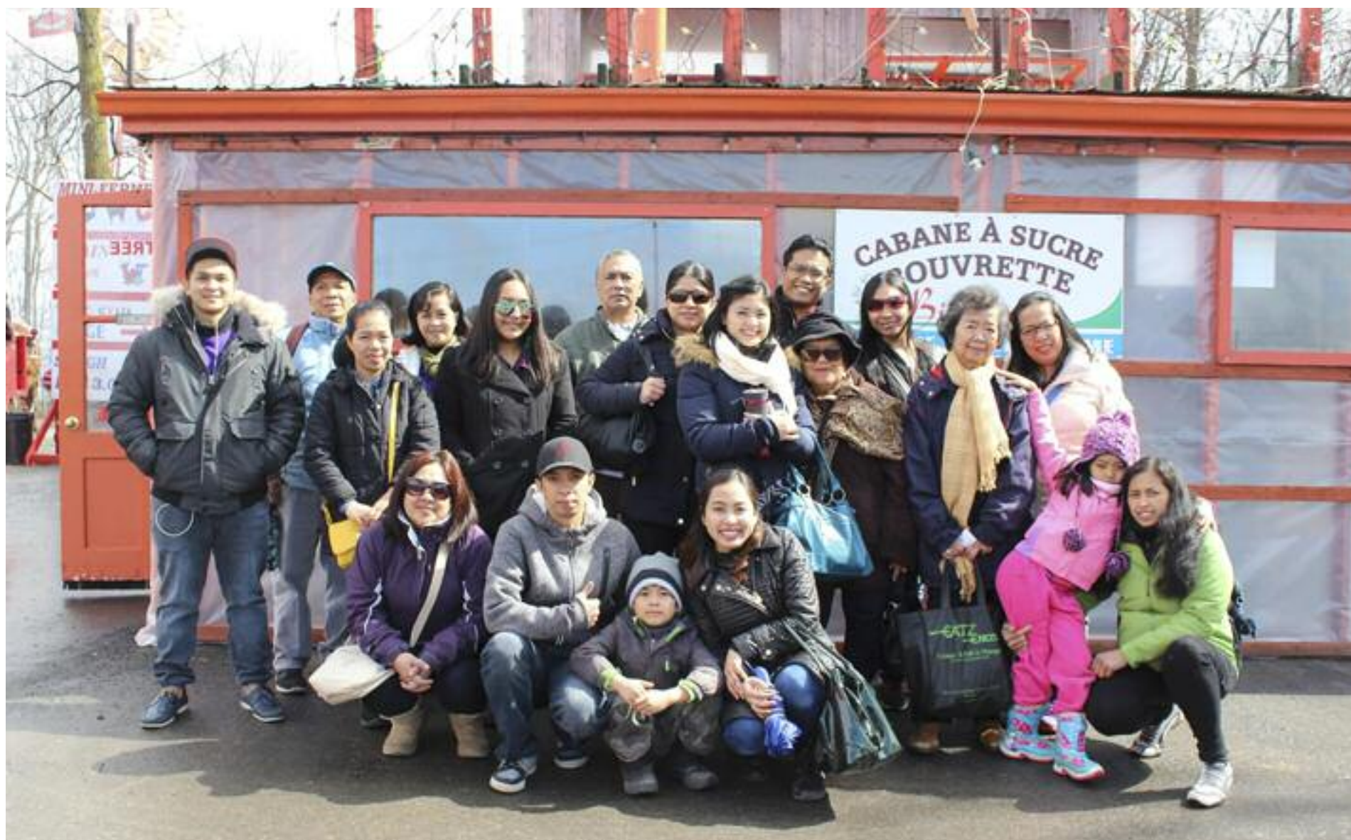
Photo shows part of the group who joined Gilmore College International annual sugaring trip. This year, they tried a new place in St. Jerome, Cabane à sucre Bouvrette. In spite of the rain, the students and their friends still enjoyed the outing. (April 2, 2016)

There are many good reasons to plan your funeral in advance... there are no good reasons not to!