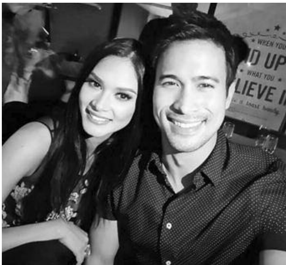
Miss Universe Pia Wurtzbach with Sam Milby

Sam Milby is a lot happier nowadays what with his challenging role on the hit afternoon TV series "Doble Kara." The ABS-CBN show sees the actor play Sebastian, the husband of Kara played by Julia Montes.