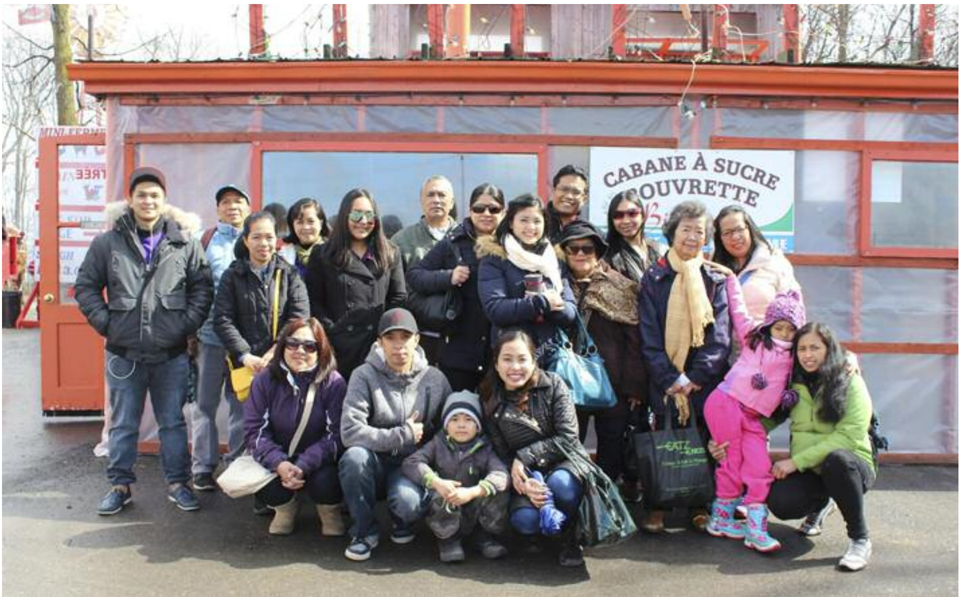
Photo shows part of the group who joined Gilmore College International annual sugaring trip. This year, they tried a new place in St. Jerome, Cabane à sucre Bouvrette. In spite of the rain, the students and their friends still enjoyed the outing. (April 2, 2016)