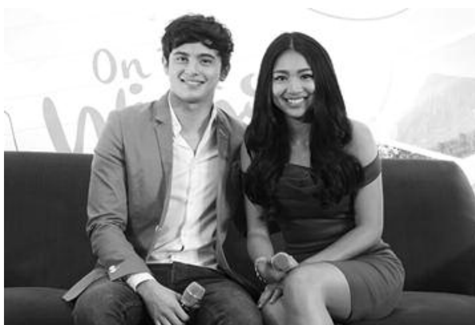
James Reid with Nadine Lustre

James Reid said that he is glad to be doing a movie again after starring in the hit Kapamilya teleserye On the Wings of Love . The actor is set to topbill the upcoming movie This Time opposite his girlfriend Nadine Lustre.