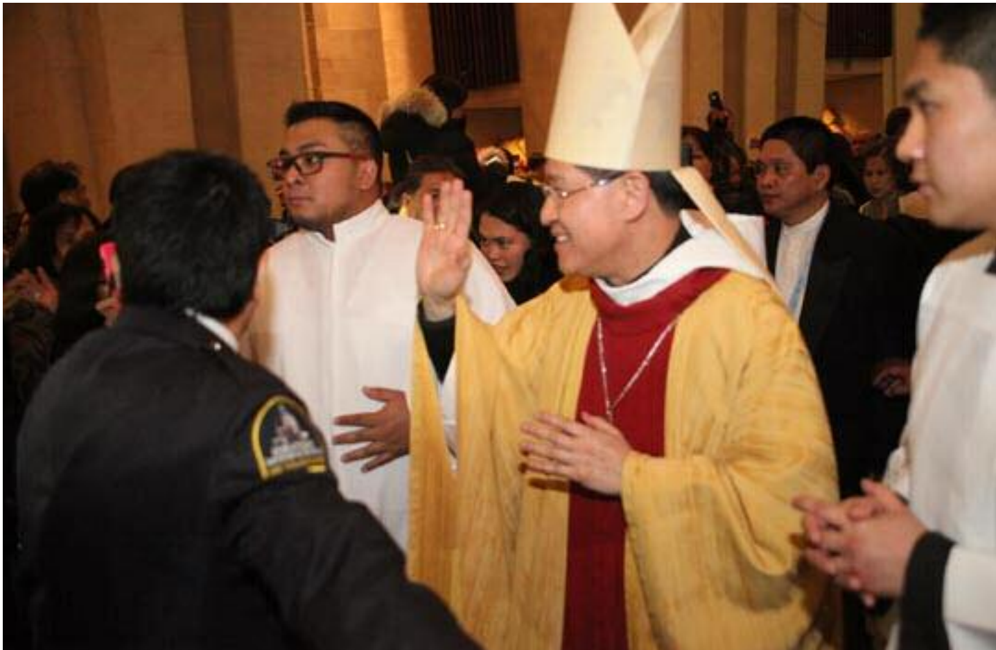
After the Eucharistic Mass, Cardinal Tagle mingled with the crowd who were eager to shake hands with him.