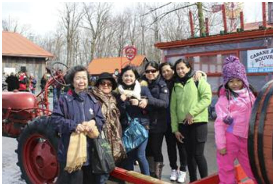
Souvenir photo of sugaring at Bouvrette in St. Jerome, Quebec.