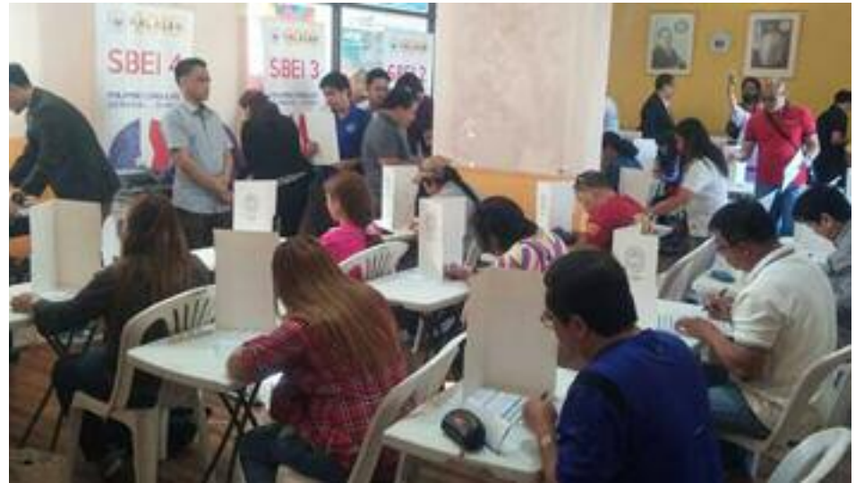
Filipinos cast their vote for the national elections at the Philippine consulate in Dubai on April 9, 2016.

As Filipinos who have seen how democracy works in their adopted countries, especially in the US and other developed nations, and have a more objective view of what is happening and what is good for the