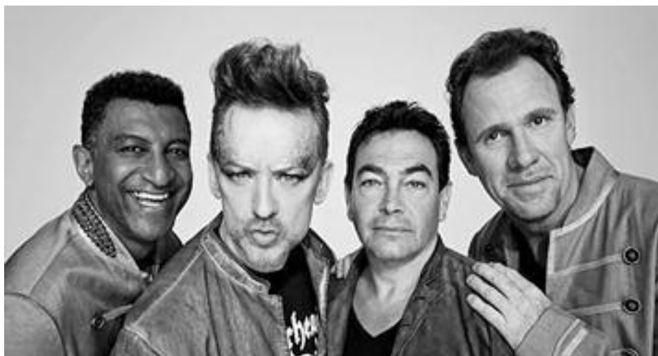
Boy George (second from left), will be in Manila in June.

His look is iconic, so do his band's songs. And he is coming to Manila at this time when the LGBT community here is at its most profound as a collective soul.