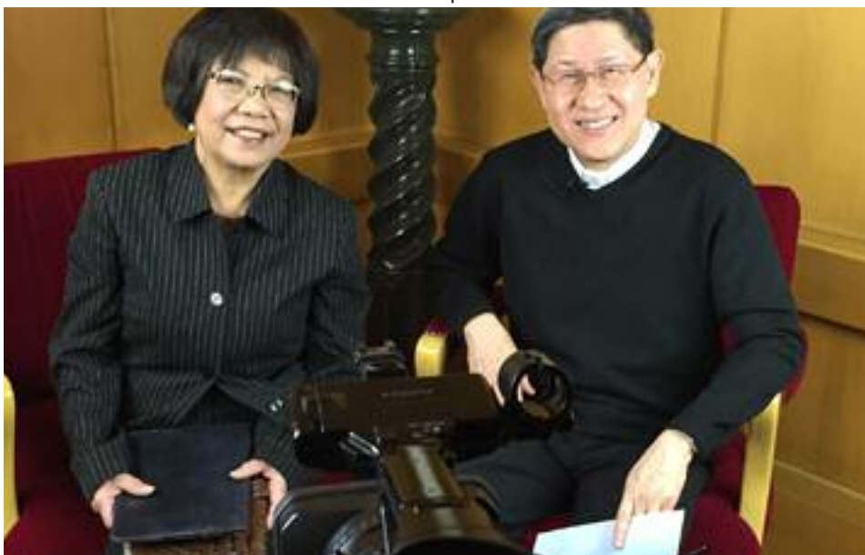
Cardinal Tagle being interviewed by Amy Manon-og of MMTV Global

Expected crowd was about 1,000 but the number doubled that the security agents had a problem escorting Cardinal Tagle to the Eucharistic mass. Though the mass was scheduled at 6:00 p.m. the church was almost full at 5:00